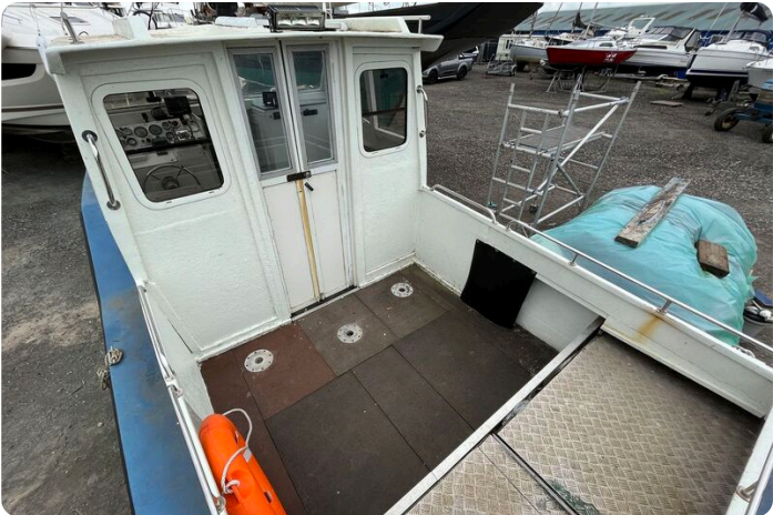
Tight lines- Cockpit