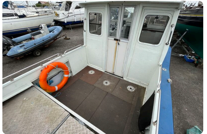
Tight lines-life ring