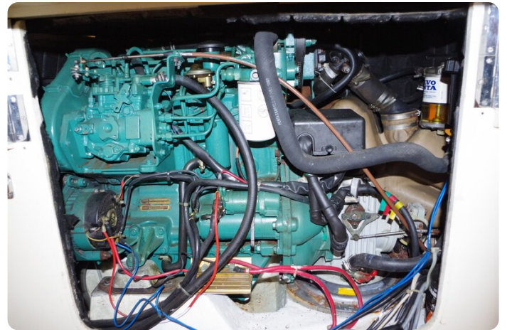
MSP_5286 - Kopie