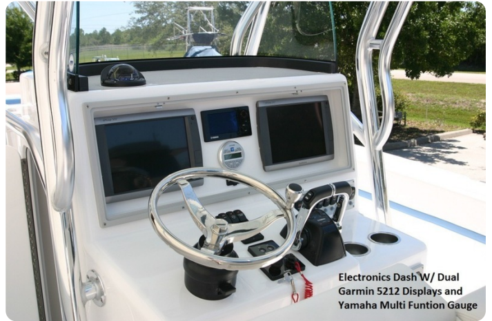
Electronics Dash W/ Dual Garmin 5212 Displays and Yamaha Multi Functon Gauge