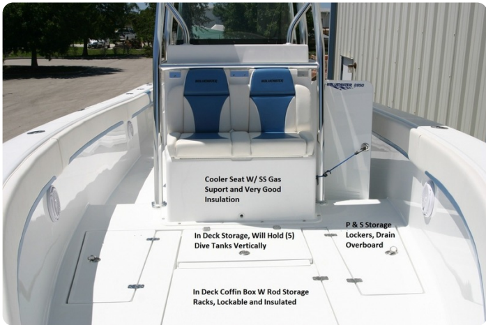
Cooler Seat W/ SS Gas Support and Very Good Insulation In Deck Storage, Will Hold (5) Dive Tanks Vertically P & S Storage Lockers, Drain Overboard In Deck Coffin Box W Rod Storage Racks, Lockable and Insulated