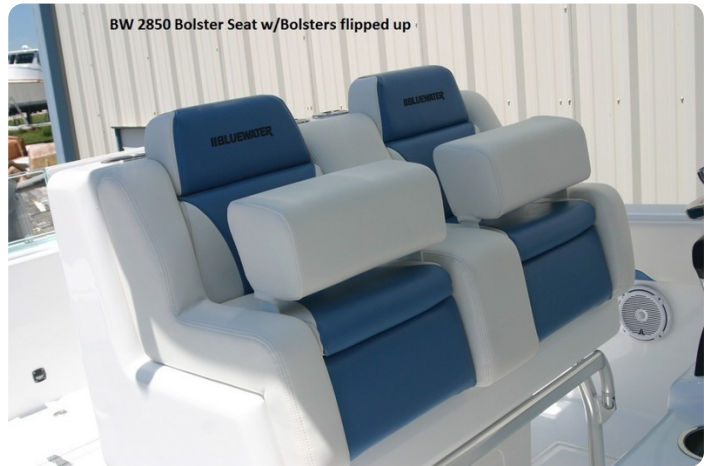
BW 2850 Bolster Seat w/Bolsters flipped up