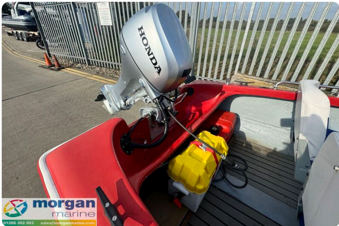
Classic mid-1970s river launch-fuel