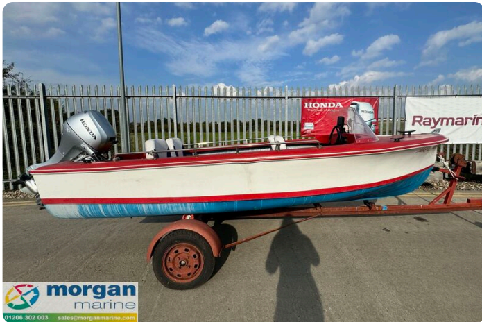
Classic mid-1970s river launch-side-view