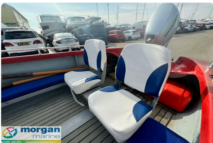
Classic mid-1970s river launch-back-seat