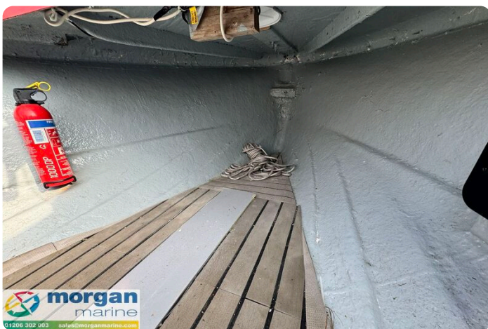
Classic mid-1970s river launch-storage