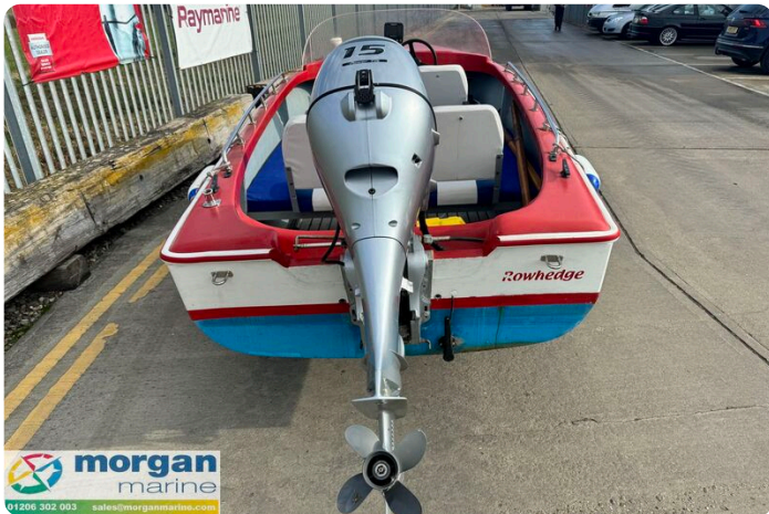
Classic mid-1970s river launch-prop