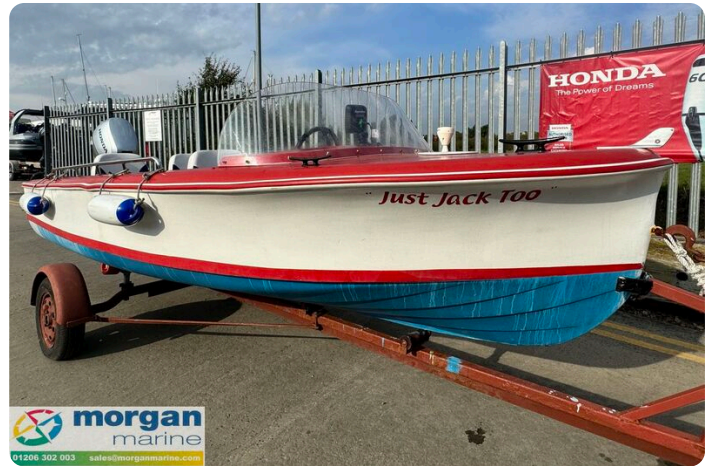
Classic mid-1970s river launch-side