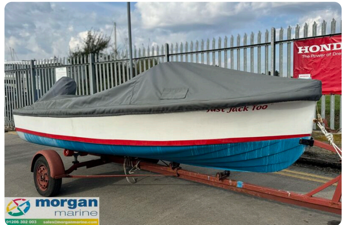
Classic mid-1970s river launch-cover