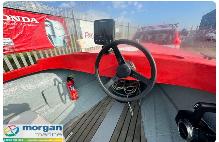
Classic mid-1970s river launch-wheel