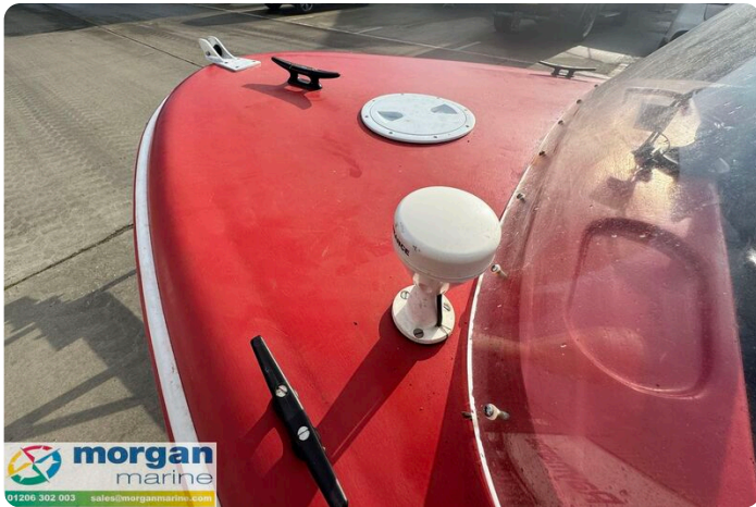
Classic mid-1970s river launch-mooring-cleat