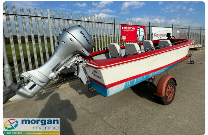
Classic mid-1970s river launch-engine