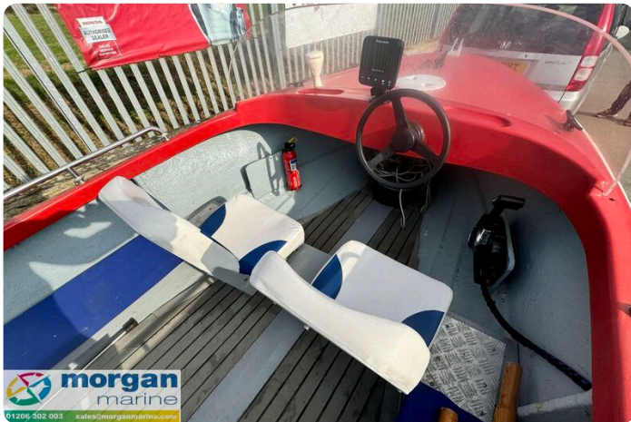
Classic mid-1970s river launch-engine-dash