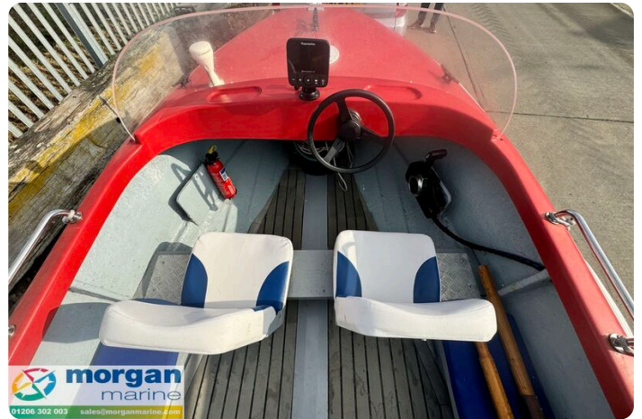
Classic mid-1970s river launch-pilot-seat