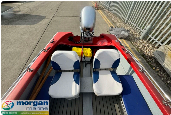
Classic mid-1970s river launch-seat