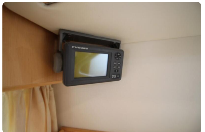
Cranchi 41 Mediterranee