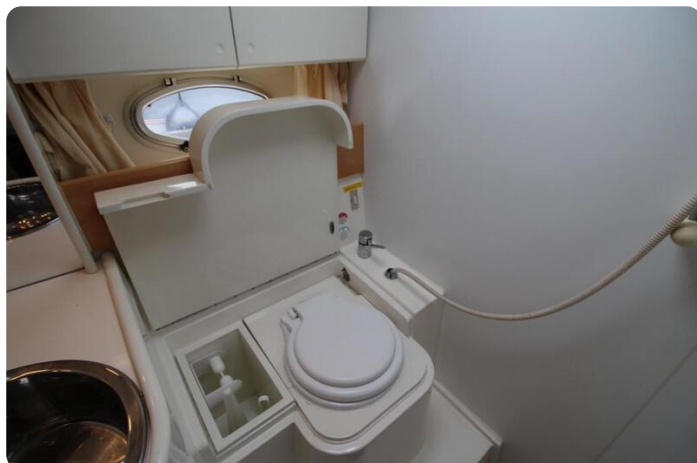
Cranchi 41 Mediterranean