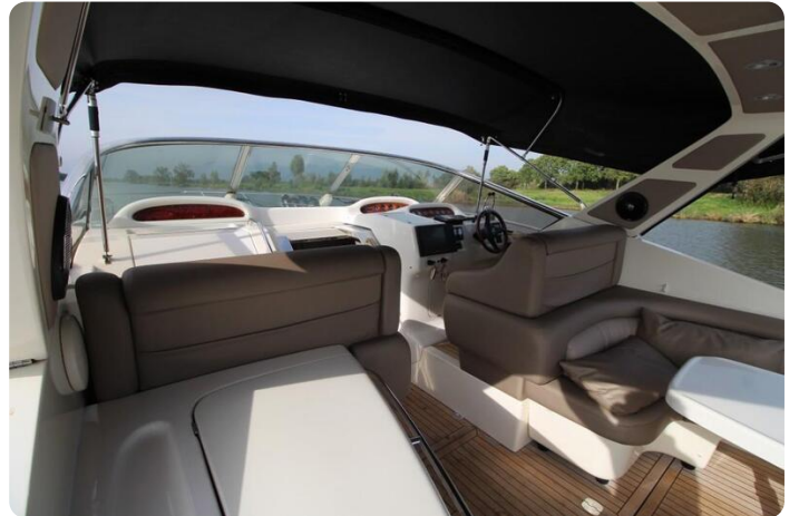
Cranchi 41 Mediterranee