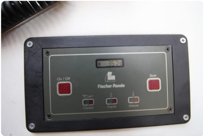
Cranchi 41 Mediterranee