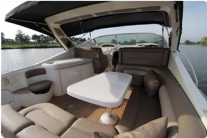
Cranchi 41 Mediterranee