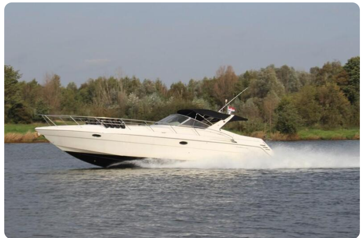
Cranchi 41 Mediterranee