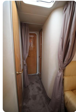
Cranchi 41 Mediterranee