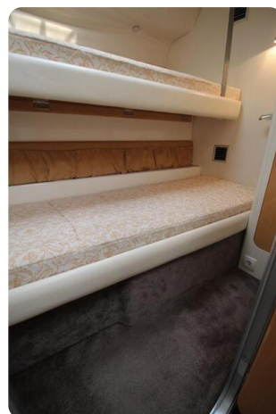
Cranchi 41 Mediterranean