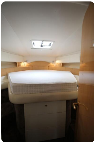
Cranchi 41 Mediterranee