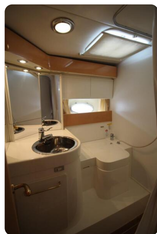
Cranchi 41 Mediterranee