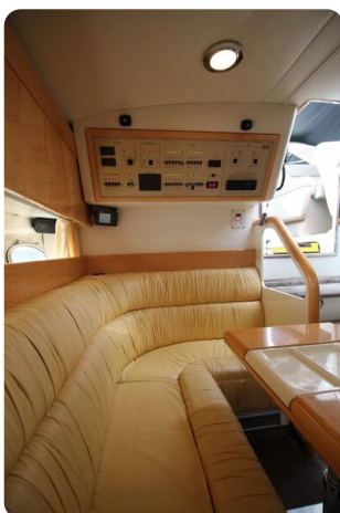
Cranchi 41 Mediterranee