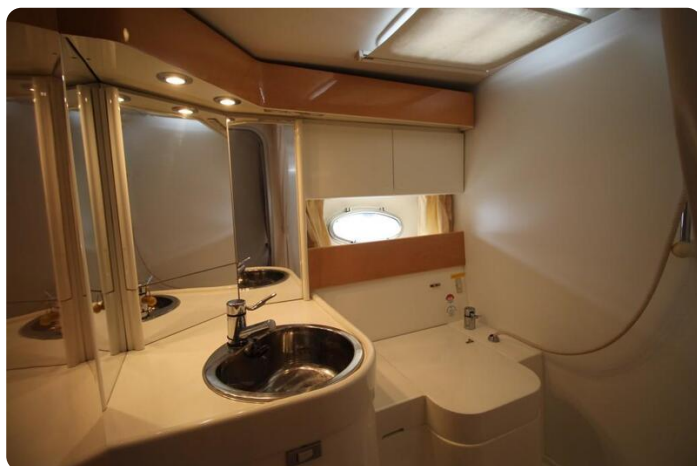
Cranchi 41 Mediterranean