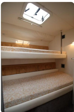
Cranchi 41 Mediterranean