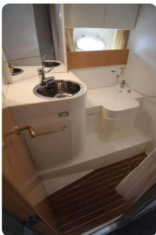
Cranchi 41 Mediterranean