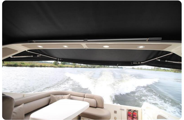
Cranchi 41 Mediterranee