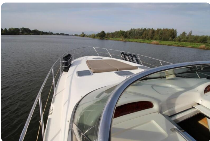
Cranchi 41 Mediterranee