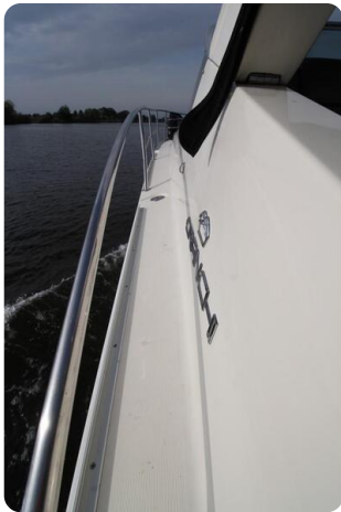
Cranchi 41 Mediterranee