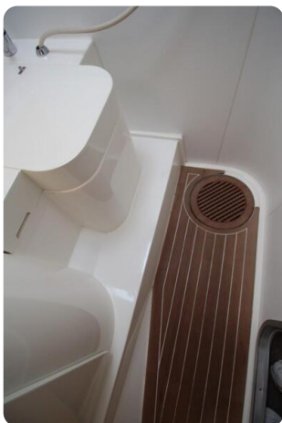
Cranchi 41 Mediterranean