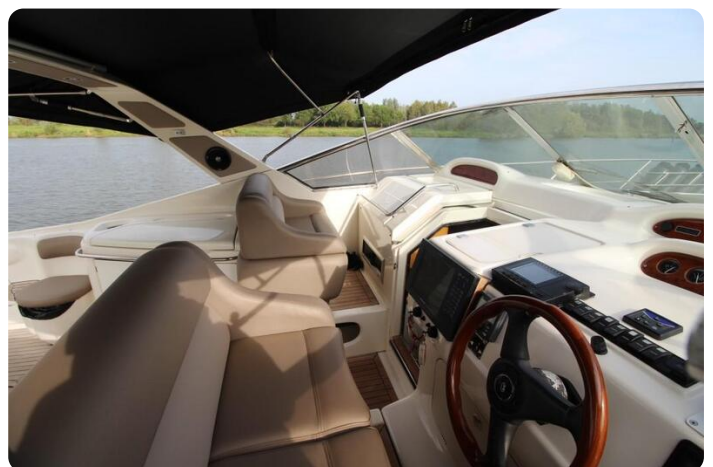
Cranchi 41 Mediterranee