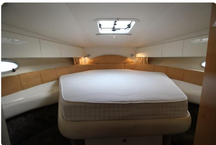
Cranchi 41 Mediterranee