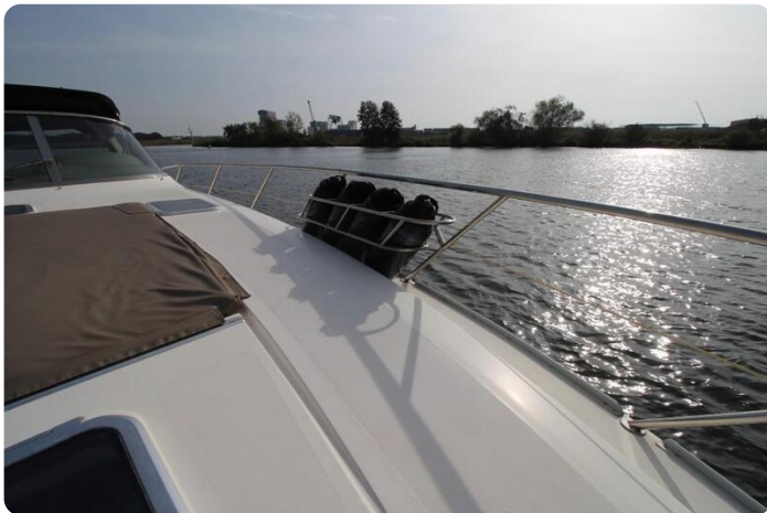
Cranchi 41 Mediterranee