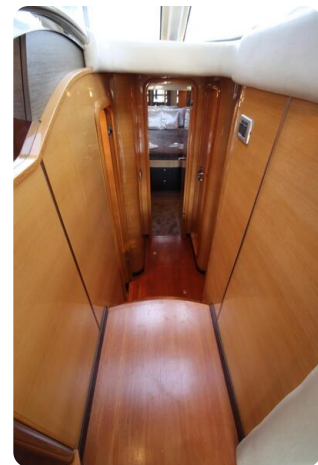
Cranchi Atlantique 50