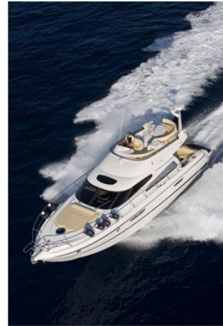
Cranchi Atlantique 50