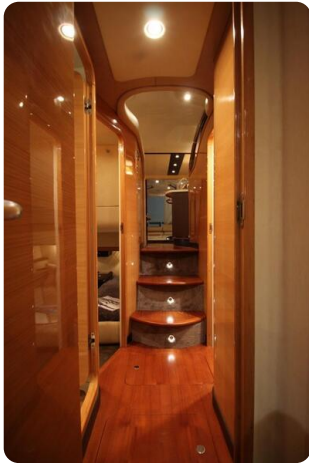
Cranchi Atlantique 50