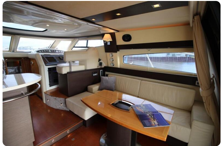
Cranchi Atlantique 50