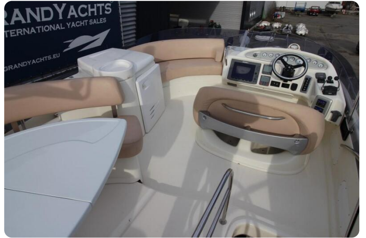
Cranchi Atlantique 50