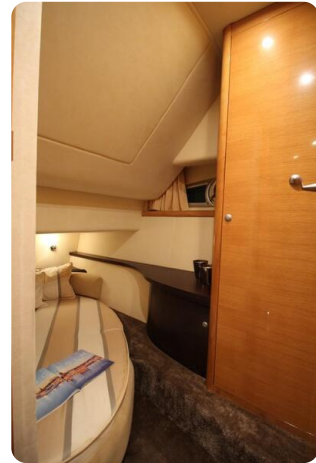
Cranchi Atlantique 50