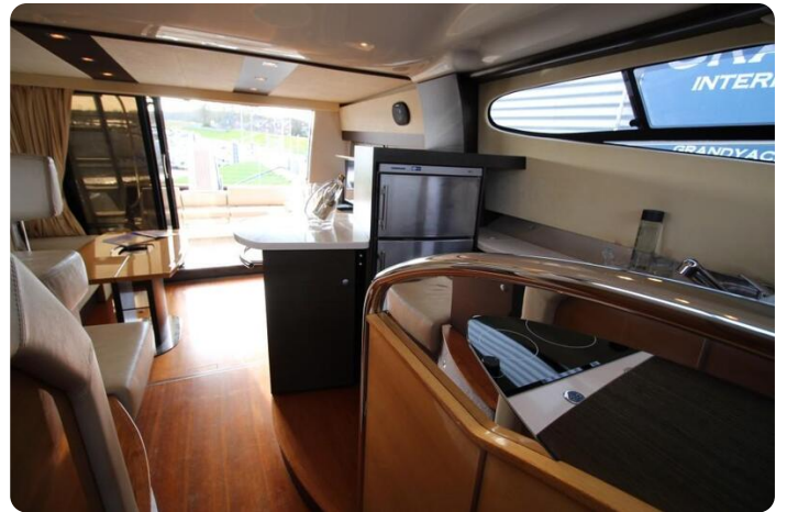
Cranchi Atlantique 50