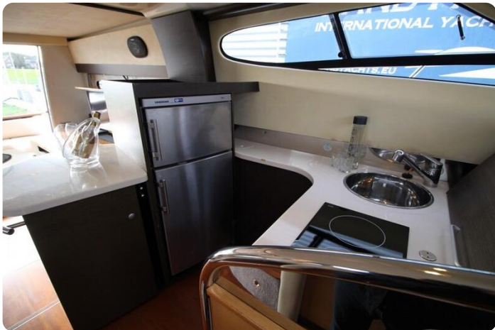
Cranchi Atlantique 50