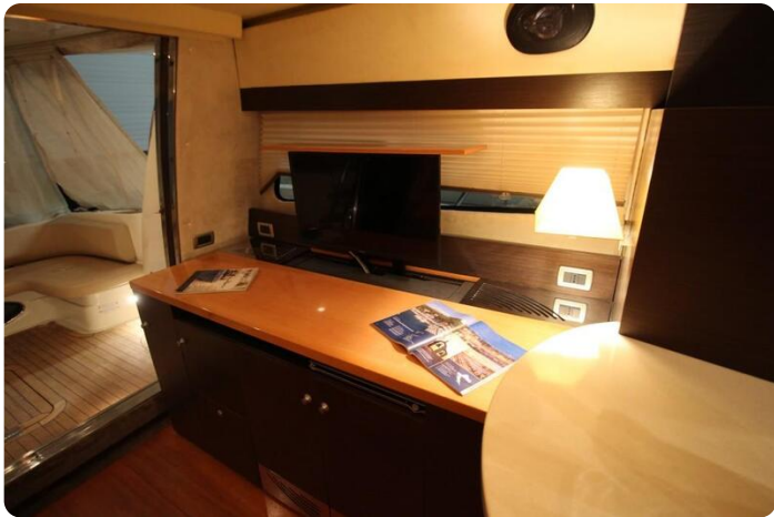
Cranchi Atlantique 50