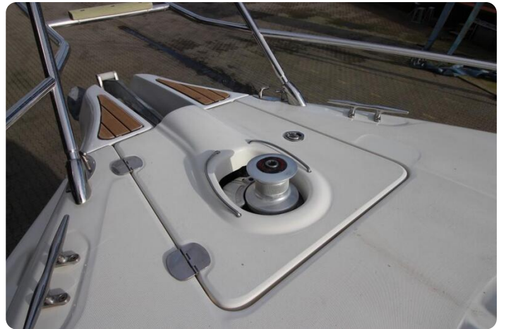
Cranchi Atlantique 50