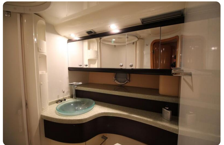
Cranchi Atlantique 50