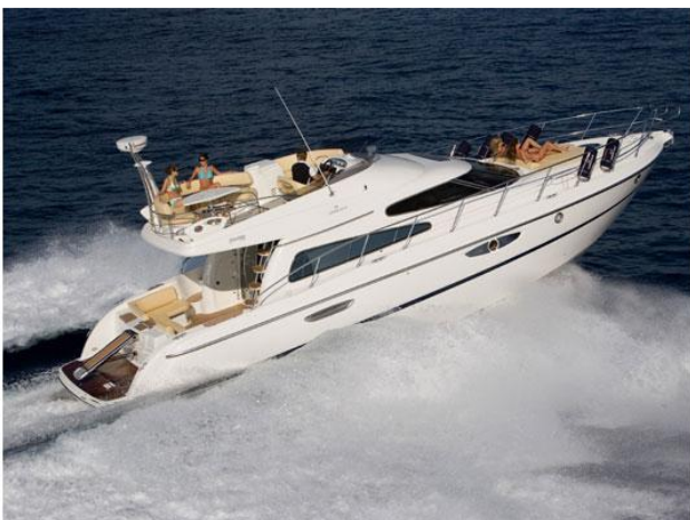
Cranchi Atlantique 50