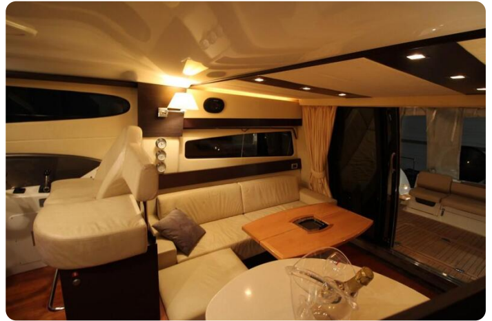
Cranchi Atlantique 50