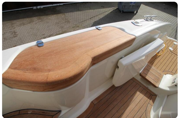
Cranchi Atlantique 50