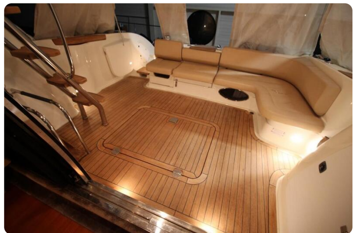
Cranchi Atlantique 50