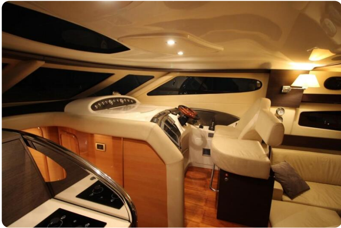
Cranchi Atlantique 50