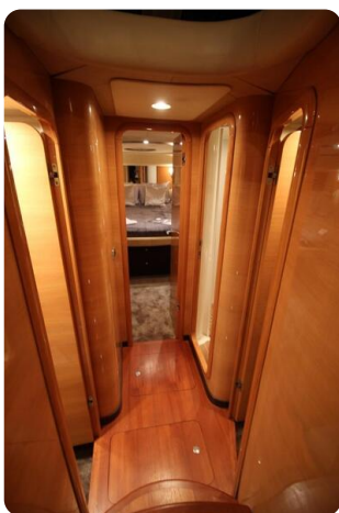
Cranchi Atlantique 50