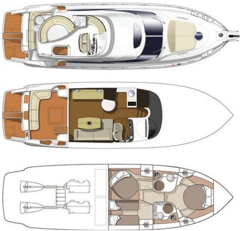
Cranchi Atlantique 50