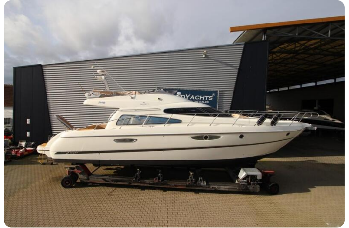
Cranchi Atlantique 50