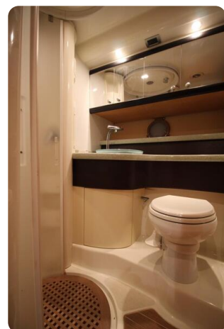
Cranchi Atlantique 50