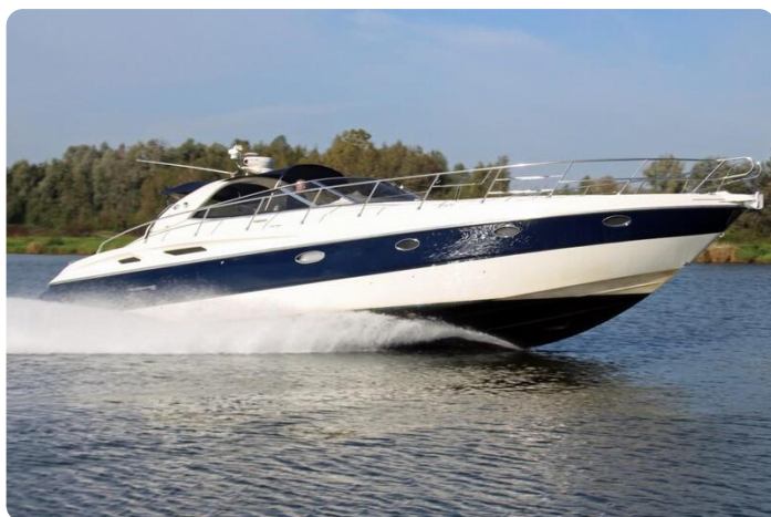
Cranchi Mediterrannée 50