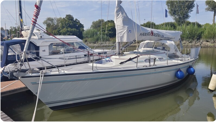
Dehler 36 mr_msp788732_4