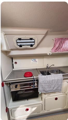
Dehler 36 mr_msp788732_29