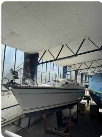
Dehler 36 CWS Halle 3