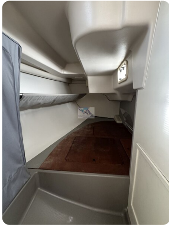
Dehler 36 CWS Halle 39