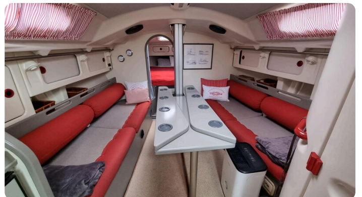
20210402_173110 - Kopie