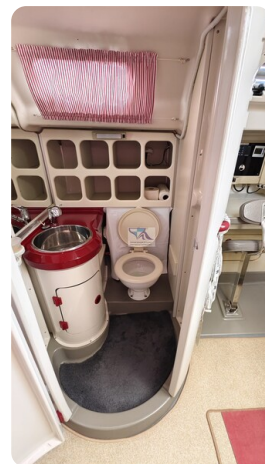
Dehler 36 mr_msp788732_32