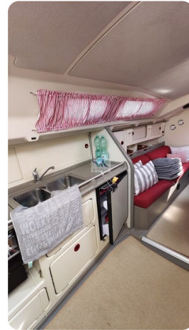
Dehler 36 mr_msp788732_28