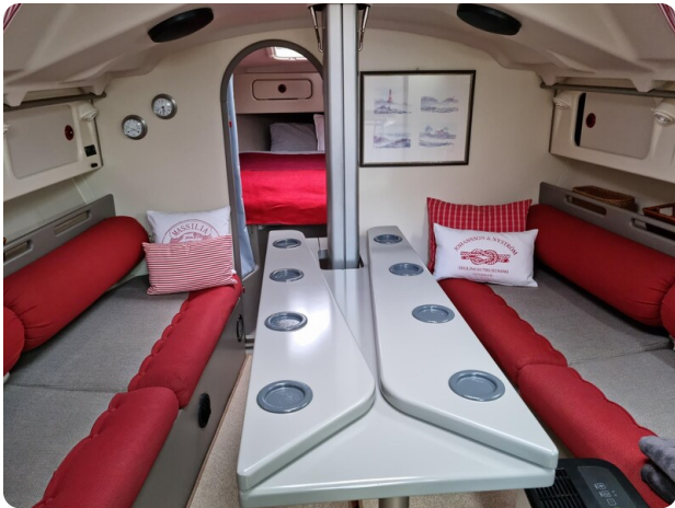
20210402_173037 - Kopie