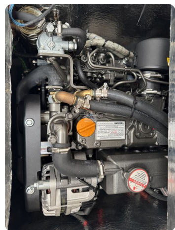
Dehler 36 CWS Halle 51