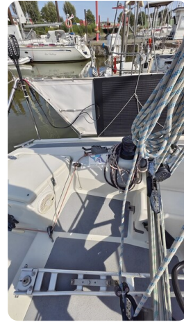
Dehler 36 mr_msp788732_19