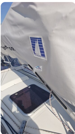
Dehler 36 mr_msp788732_15