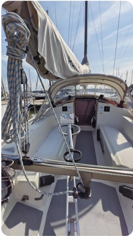
Dehler 36 mr_msp788732_24