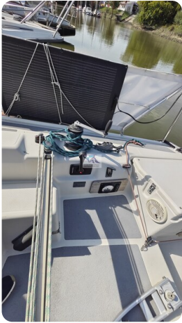
Dehler 36 mr_msp788732_18