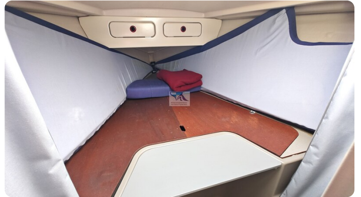
Dehler 36 mr_msp788732_41