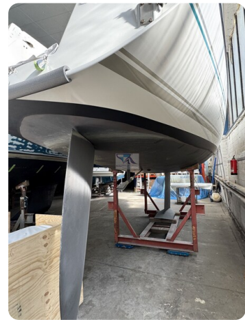
Dehler 36 CWS Halle 68