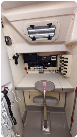
Dehler 36 mr_msp788732_34