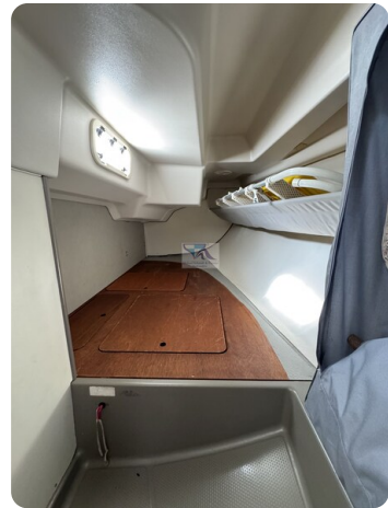
Dehler 36 CWS Halle 57