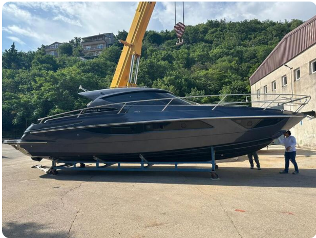
Focus Power 36