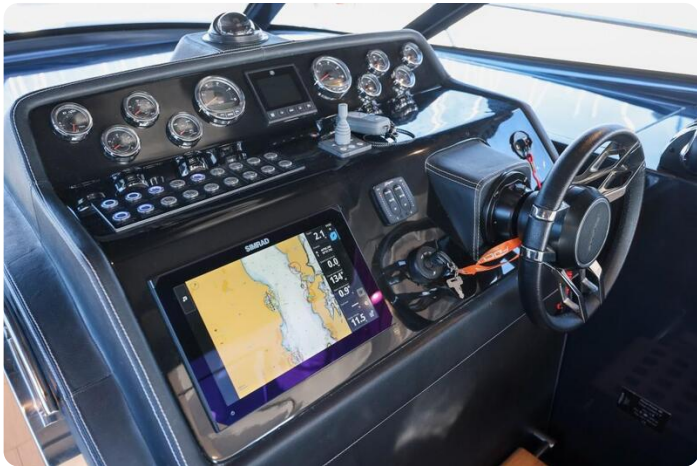
Focus Power 36