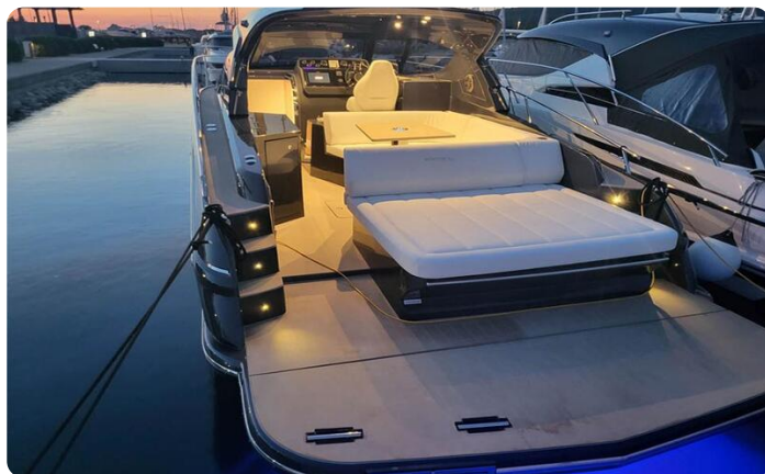
Focus Power 36