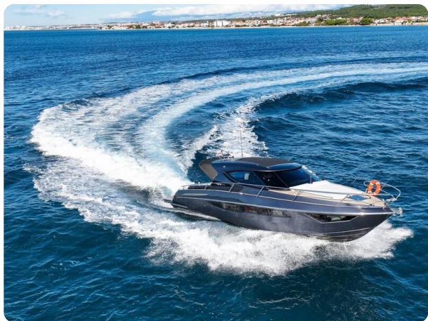
Focus Power 36