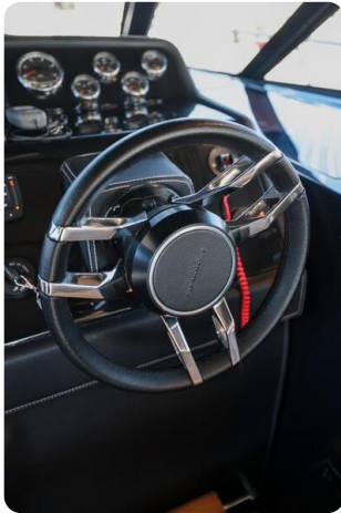
Focus Power 36