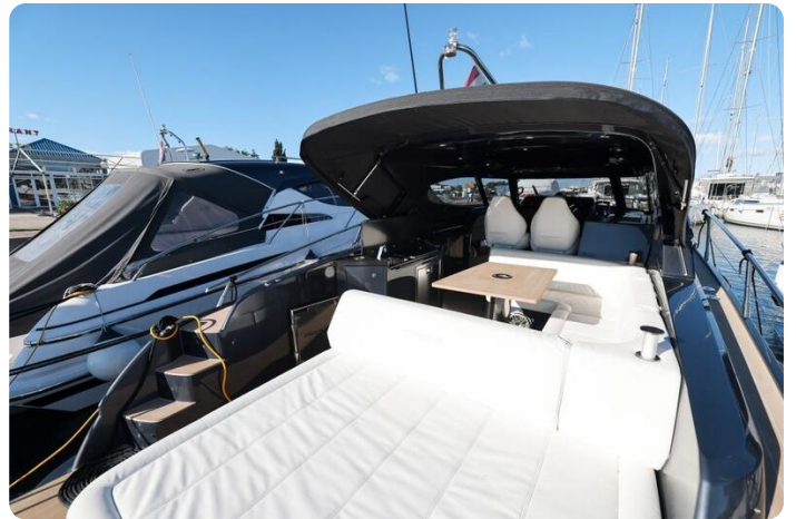
Focus Power 36