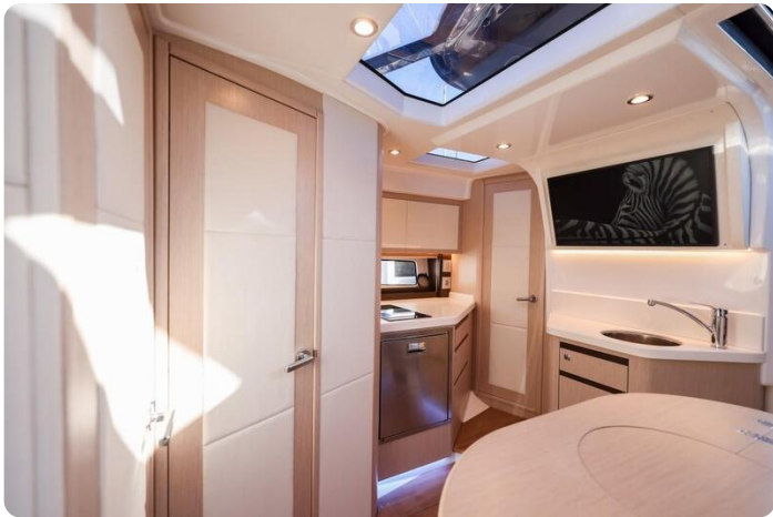
Focus Power 36