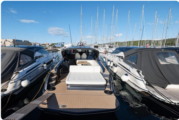
Focus Power 36