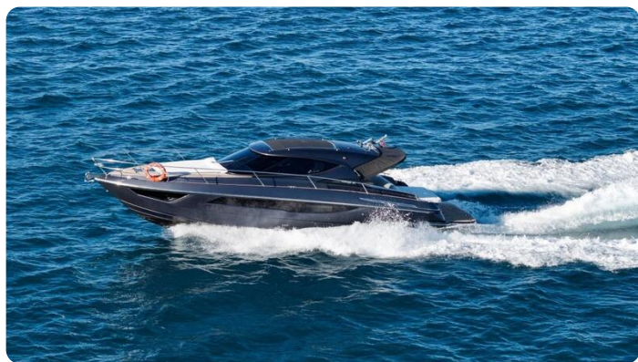
Focus Power 36