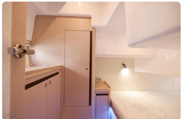
Focus Power 36