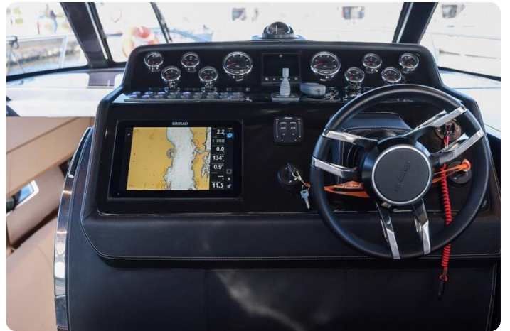
Focus Power 36