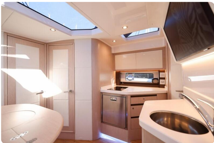
Focus Power 36