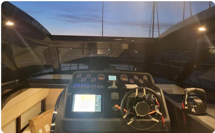
Focus Power 36