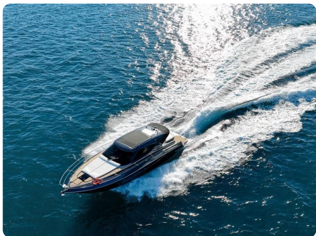
Focus Power 36