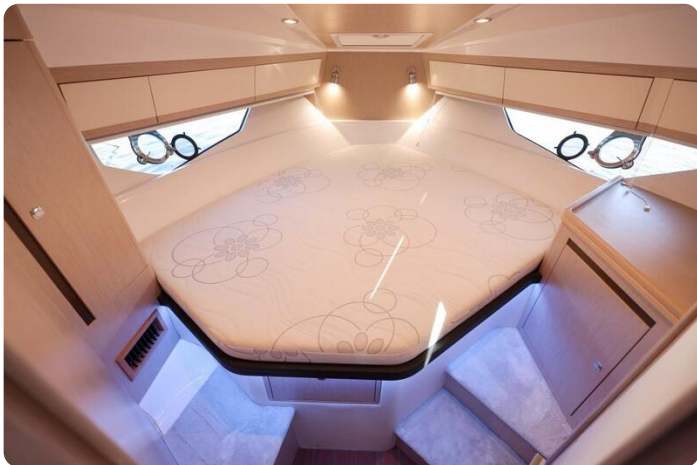
Focus Power 36