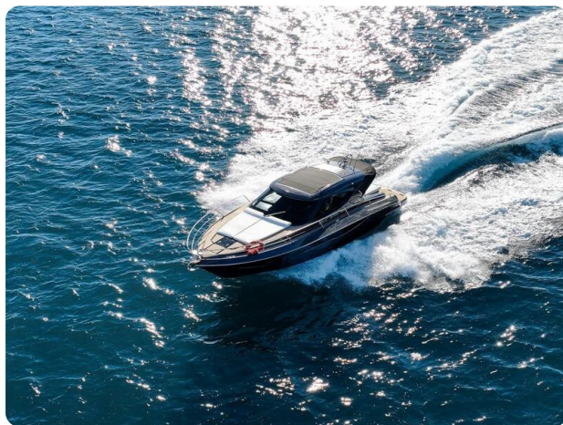
Focus Power 36