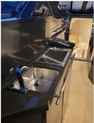
Focus Power 36