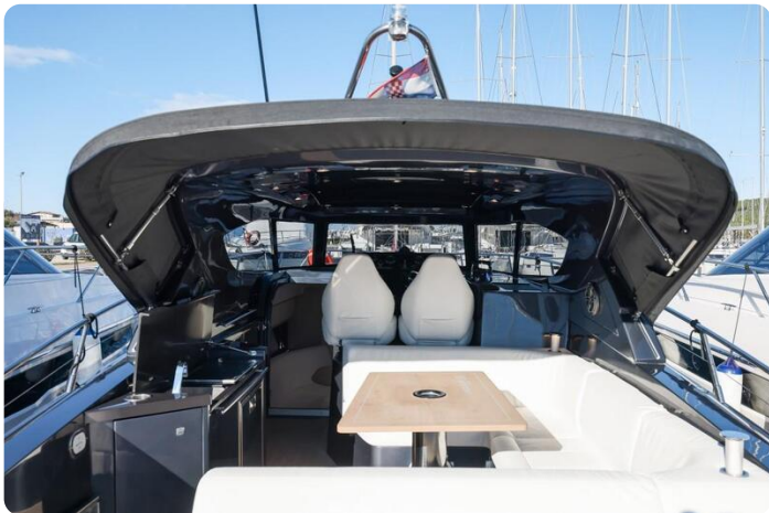
Focus Power 36