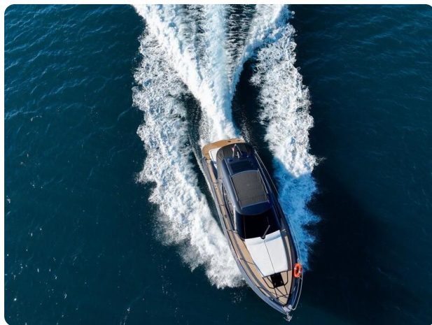
Focus Power 36