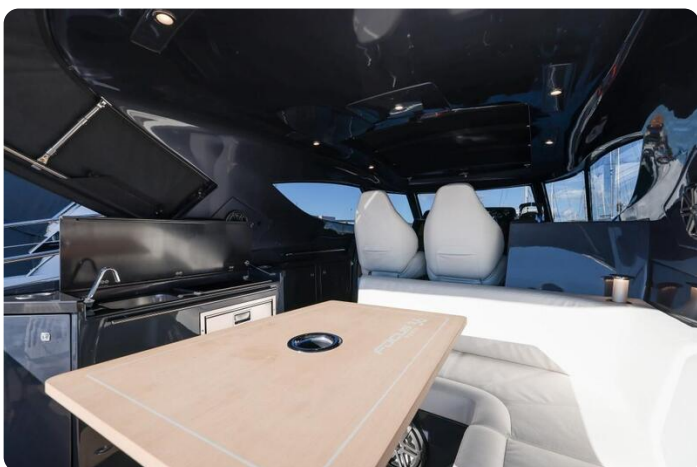
Focus Power 36