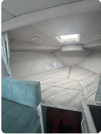
Formula BALU 68