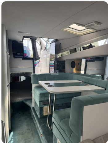
Formula BALU 61