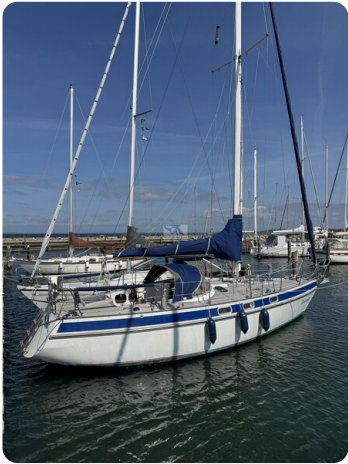
Phantom 35 TOWANDA 105