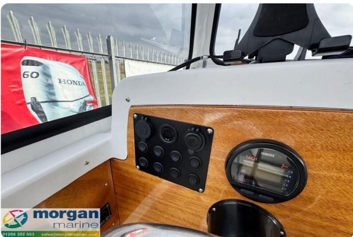
Hardy PH 17 - gauge