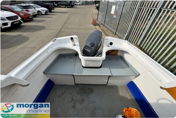
Hardy PH 17 - back bench