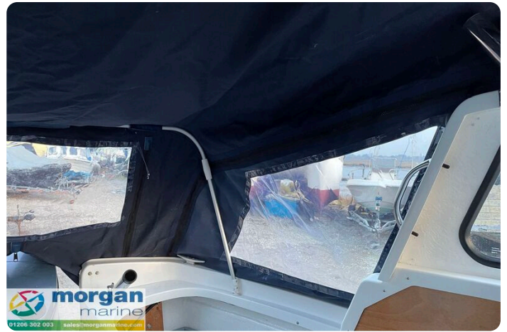
Hardy PH 17 - window