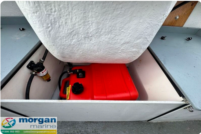
Hardy PH 17 - fuel tank