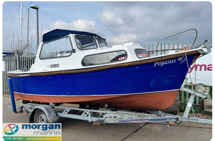
Hardy PH 17 - side view