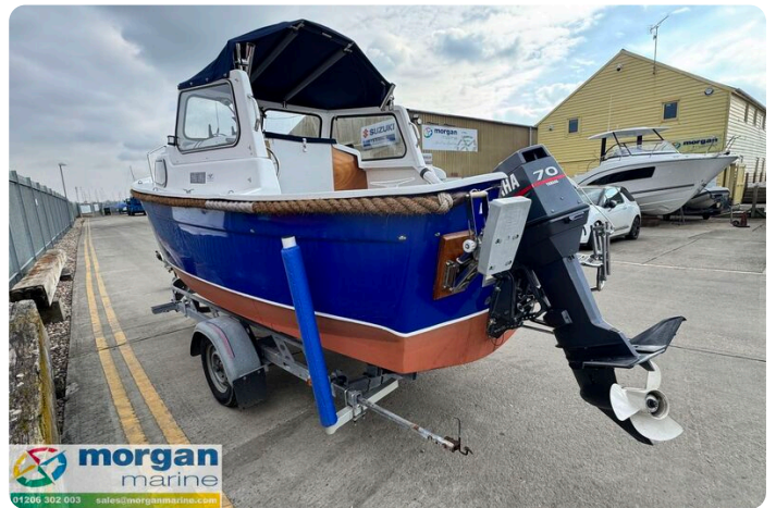
Hardy PH 17 - engine