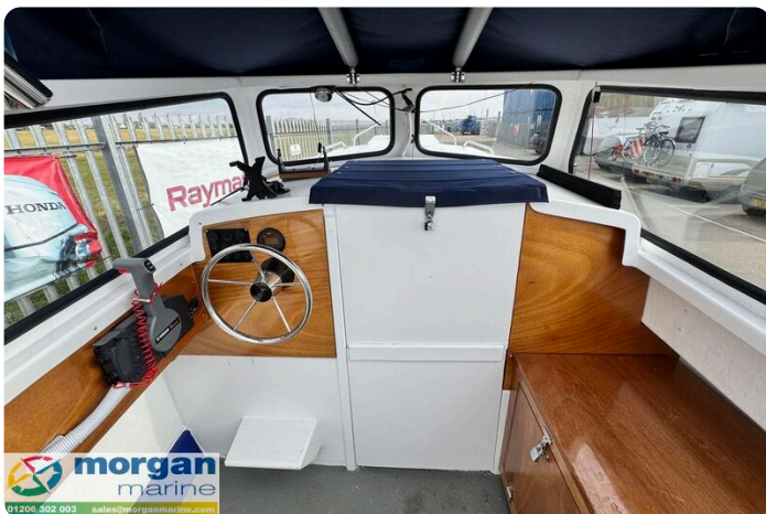
Hardy PH 17 - cockpit