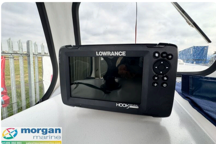
Hardy PH 17 - plotter