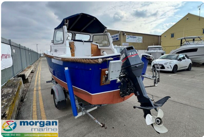
Hardy PH 17 - engine back