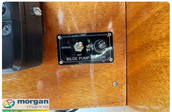
Hardy PH 17 - bilge