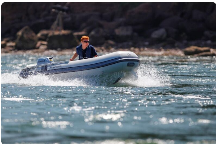
Highfield CL 290 aluminium hull RIB - starboard side bow