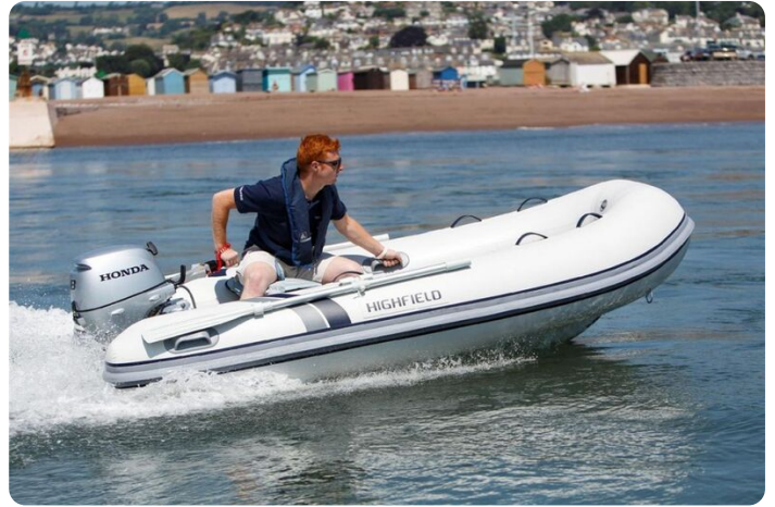
Highfield CL 290 aluminium hull RIB