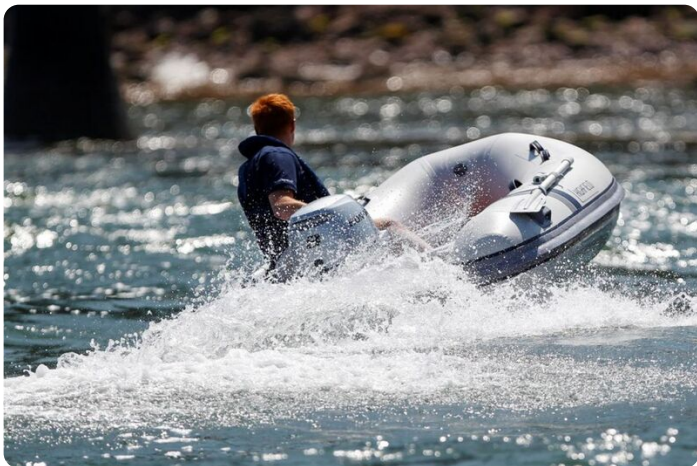
Highfield CL 290 aluminium hull RIB - transom on the water