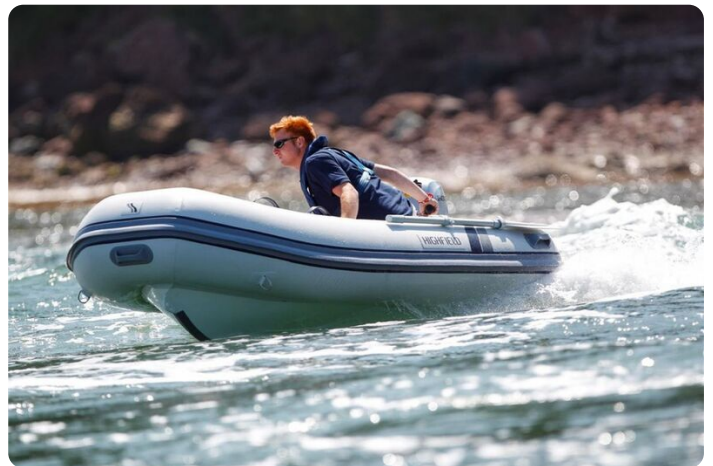
Highfield CL 290 aluminium hull RIB - port side bow