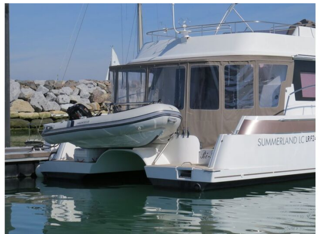
Highfield CL 290 aluminium hull RIB - tender on larger boat