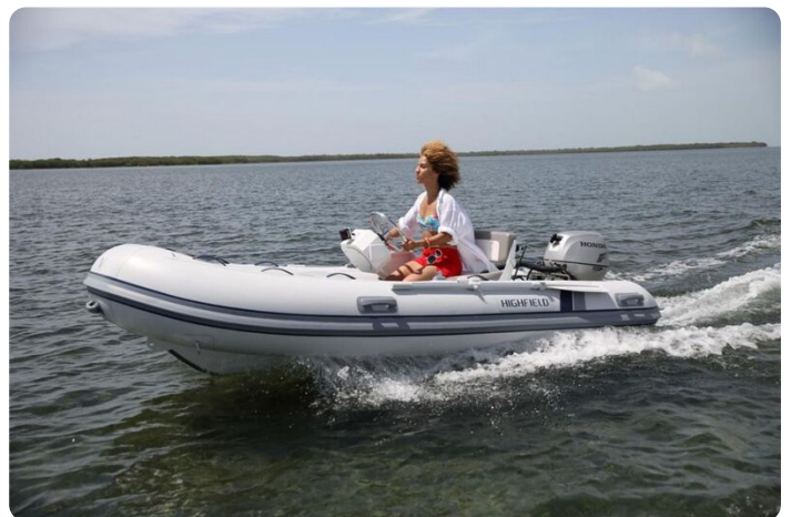
Highfield CL 360 aluminium RIB - on the water