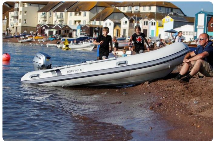
Highfield CL 360 aluminium RIB - port side