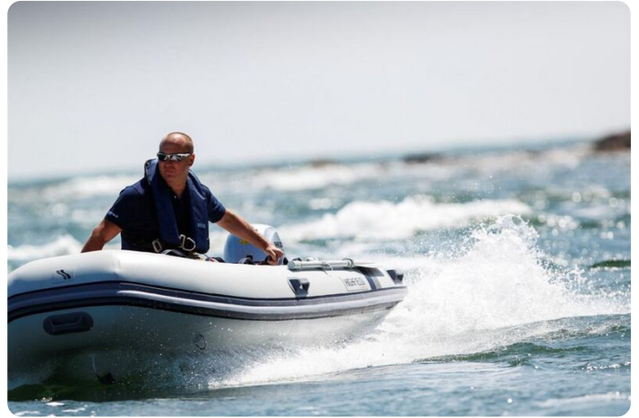
Highfield CL 360 aluminium RIB - view towards bow