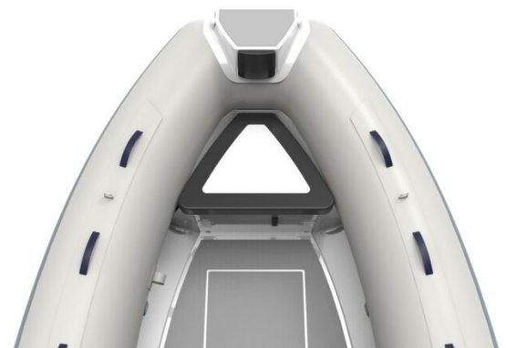
Highfield Classic 420 aluminium RIB - bow