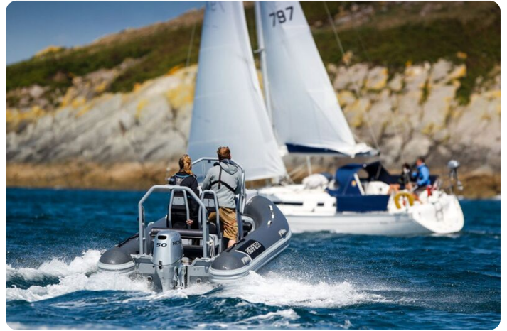
Highfield Classic 460 aluminium RIB - support sailing boats