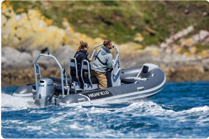
Highfield Classic 460 aluminium RIB