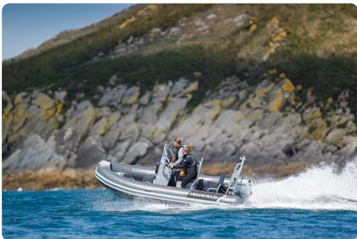
Highfield Classic 460 aluminium RIB - on the water