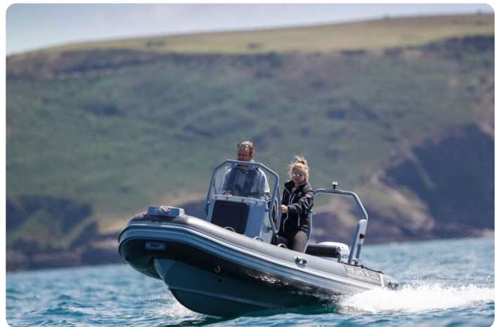
Highfield Classic 460 aluminium RIB - bow and keel