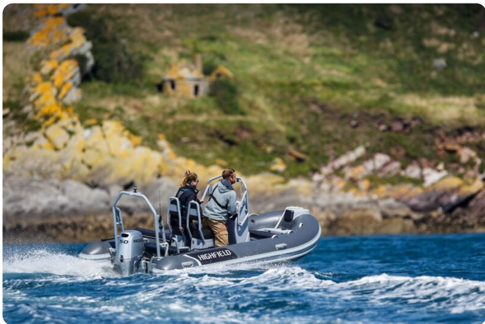
Highfield Classic 460 aluminium RIB