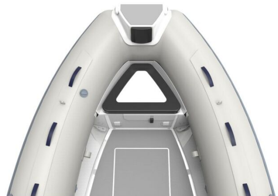
Highfield Classic 460 aluminium RIB - bow