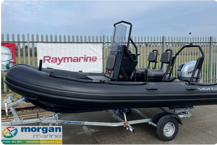
Highfield Patrol 460 black - main