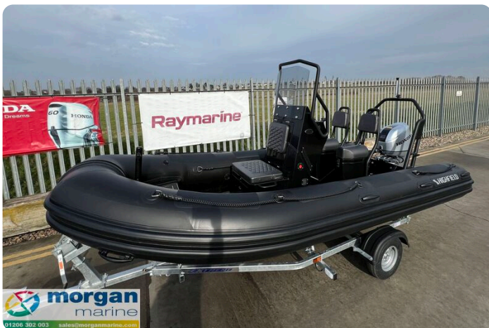
Highfield Patrol 460 black - bow