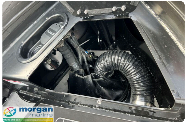
Highfield Patrol 460 black - locker bow