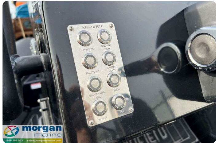
Highfield Patrol 460 black - switch panel