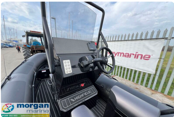
Highfield Patrol 460 black - dash