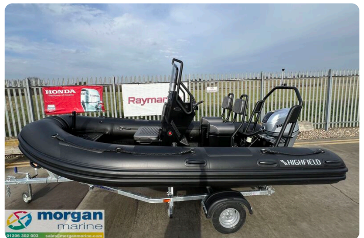
Highfield Patrol 460 black - side photo