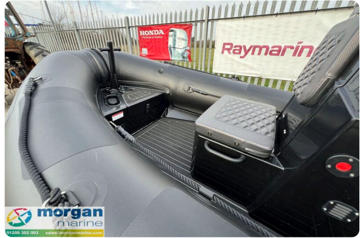
Highfield Patrol 460 black - front seat