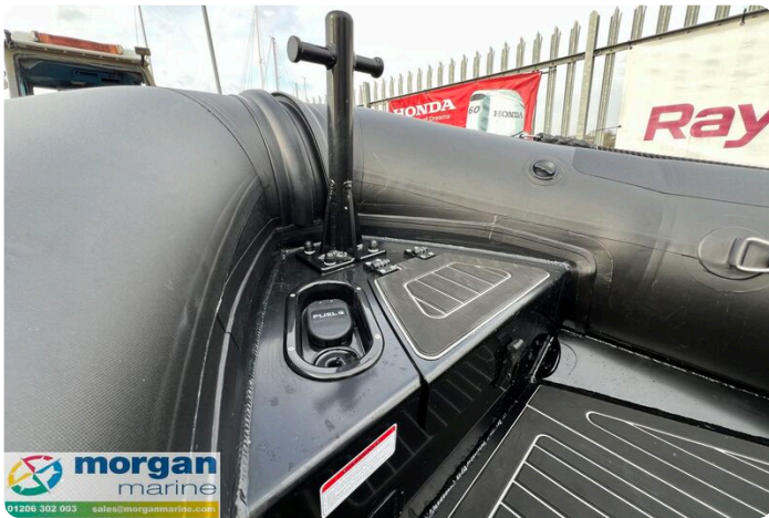
Highfield Patrol 460 black - tow post