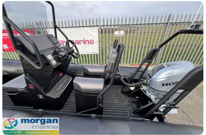
Highfield Patrol 460 black - jockey seats