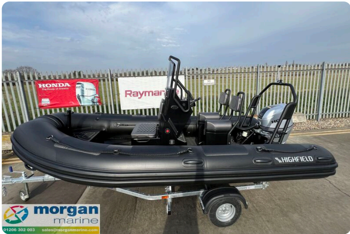
Highfield Patrol 460 black - side view