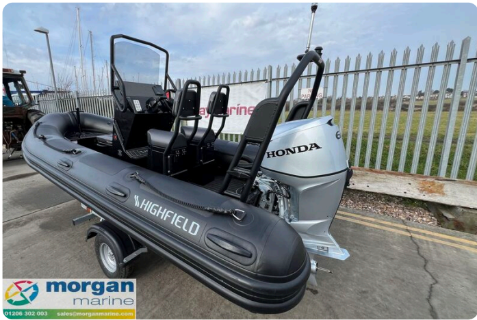
Highfield Patrol 460 black - A frame