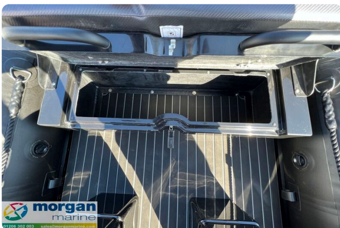
Highfield Patrol 500 aluminium RIB - deck and locker