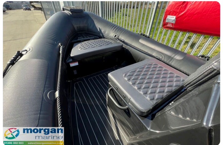
Highfield Patrol 500 aluminium RIB - forward console seat