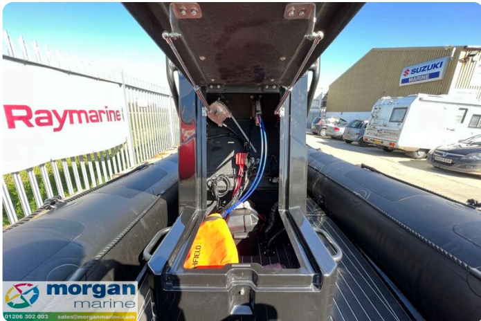
Highfield Patrol 500 aluminium RIB - storage in console