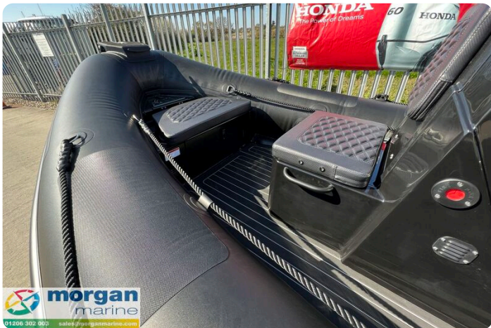
Highfield Patrol 500 aluminium RIB - bow seating