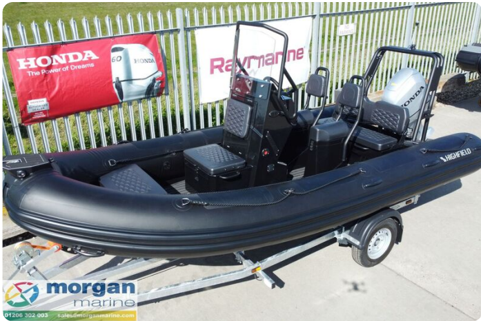
Highfield Patrol 500 aluminium RIB - bow seating