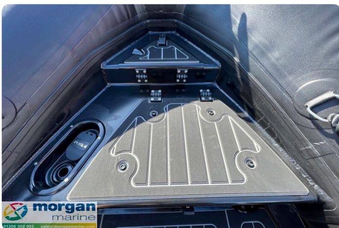
Highfield Patrol 500 aluminium RIB - bow cushion