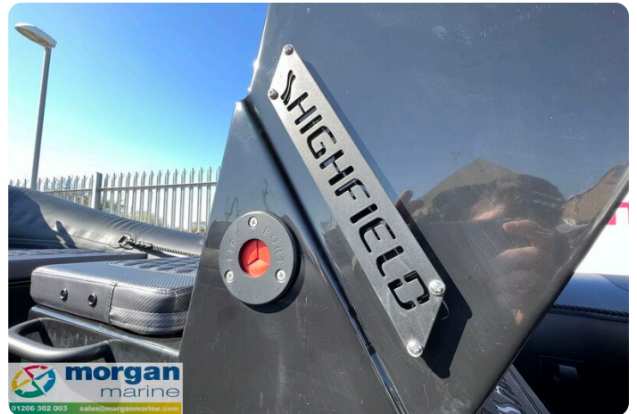
Highfield Patrol 500 aluminium RIB - decal