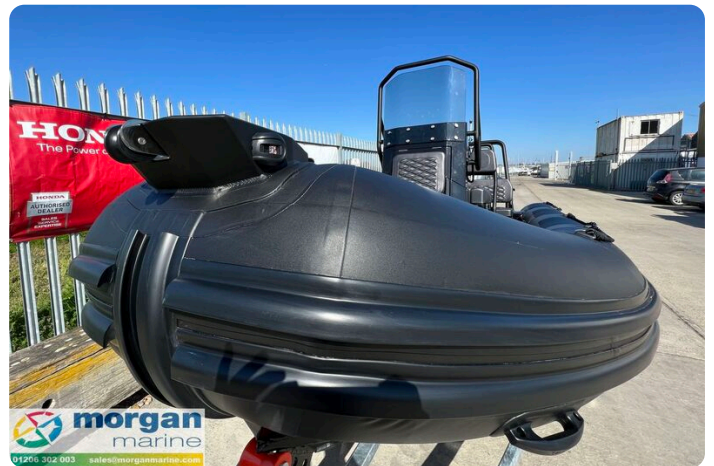
Highfield Patrol 500 aluminium RIB - bow and tubes