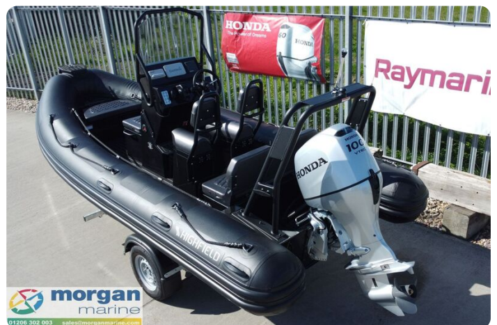
Highfield Patrol 500 aluminium RIB - aft port side with Honda outboard