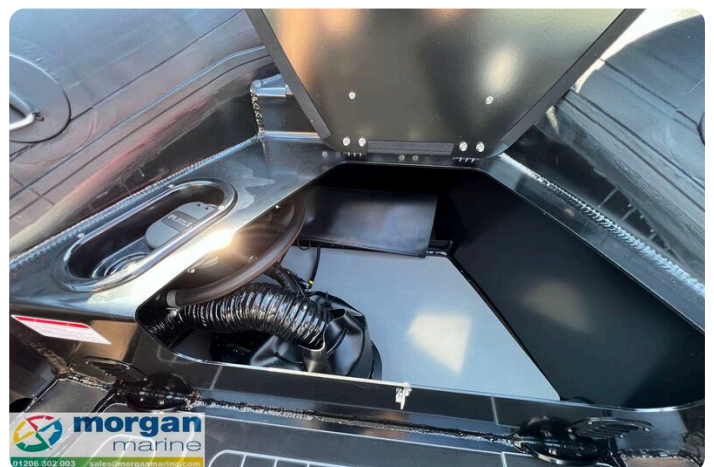
Highfield Patrol 500 aluminium RIB - bow locker