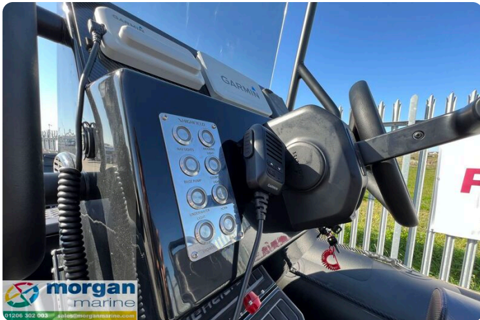
Highfield Patrol 500 aluminium RIB - switch panel