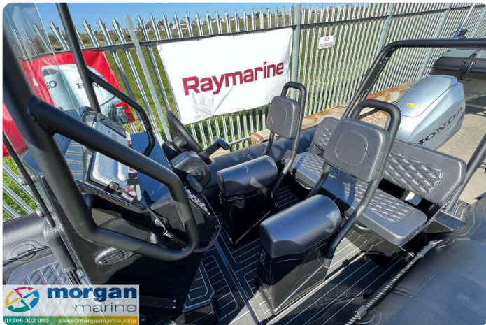
Highfield Patrol 500 aluminium RIB - overhead view of jockey seats