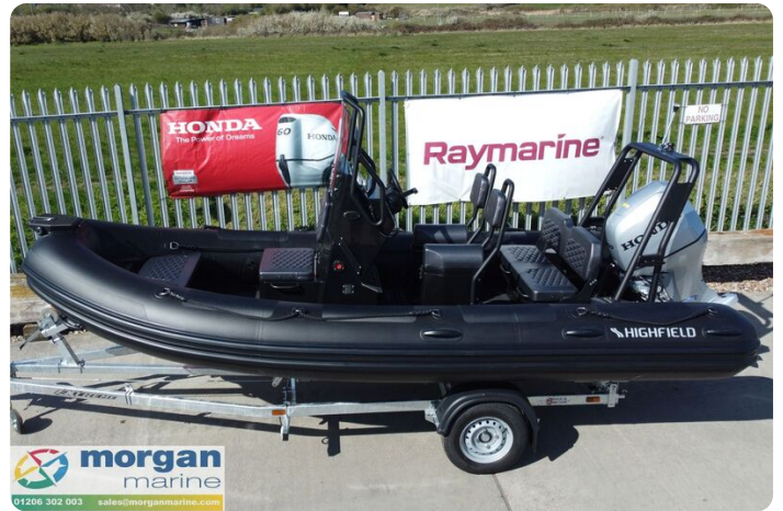
Highfield Patrol 500 aluminium RIB - port side