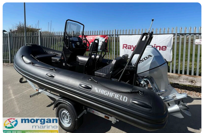
Highfield Patrol 500 aluminium RIB - A-frame