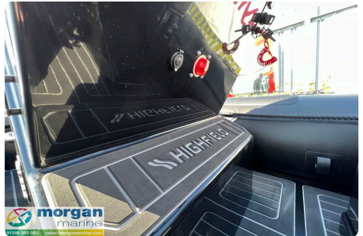
Highfield Patrol 500 aluminium RIB - deck