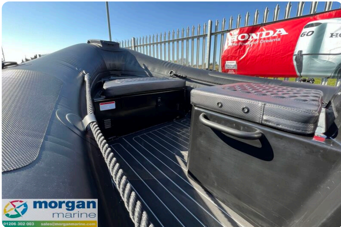
Highfield Patrol 500 aluminium RIB - flooring in bow