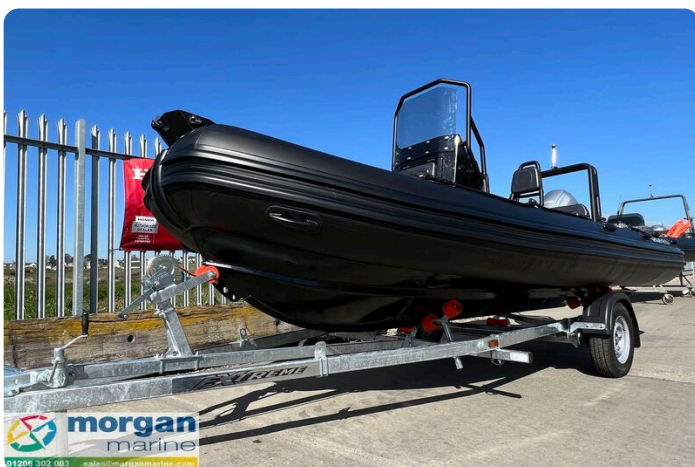
Highfield Patrol 500 aluminium RIB - under bow and hull