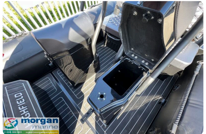
Highfield Patrol 500 aluminium RIB - storage locker