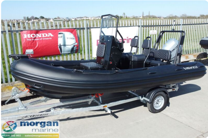
Highfield Patrol 500 aluminium RIB