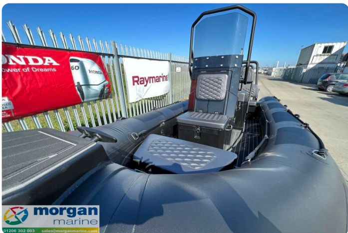
Highfield Patrol 500 aluminium RIB - tubes and bow seating