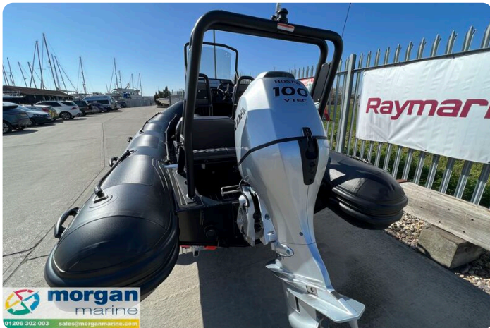
Highfield Patrol 500 aluminium RIB - Honda BF100 outboard