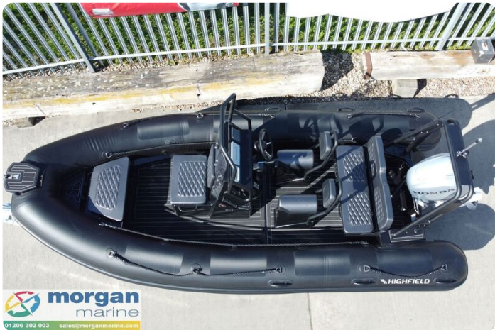
Highfield Patrol 500 aluminium RIB - overhead view