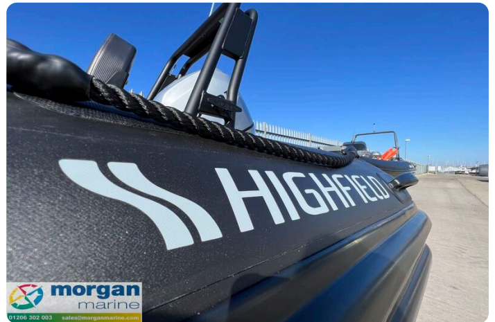
Highfield Patrol 500 aluminium RIB - decal on tube