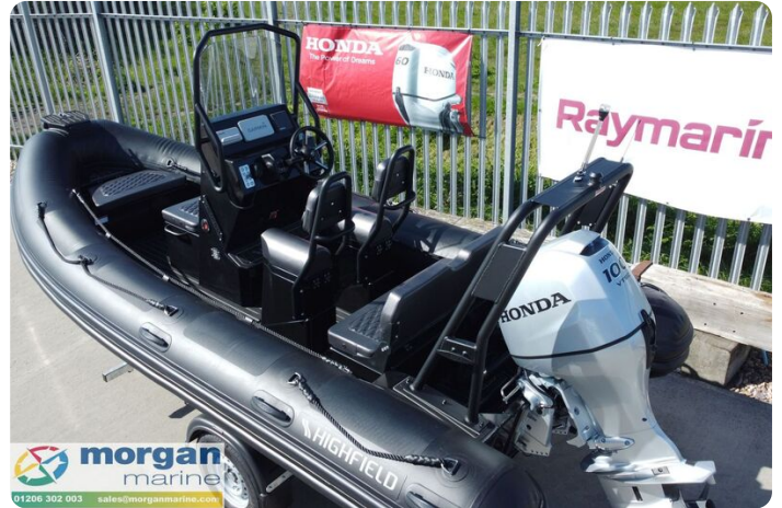
Highfield Patrol 500 aluminium RIB - overhead view of console