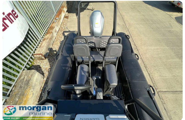
Highfield Patrol 500 aluminium RIB - overhead view from console to aft