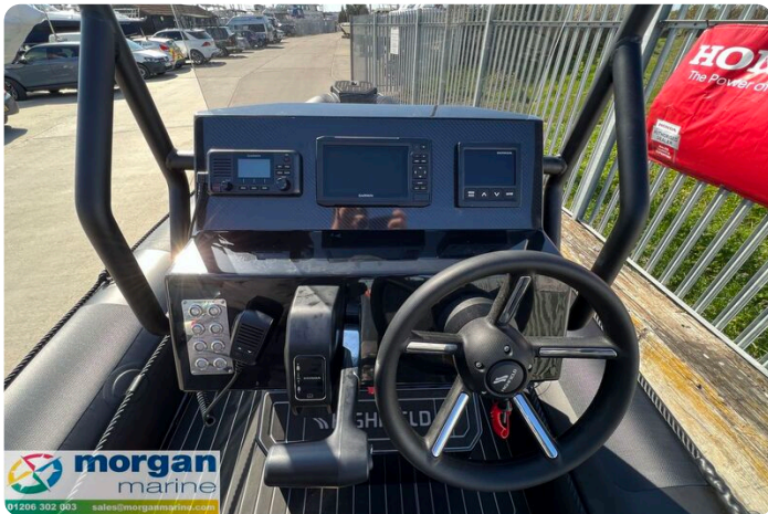
Highfield Patrol 500 aluminium RIB - steering wheel and dash