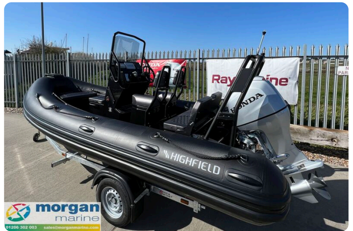
Highfield Patrol 500 aluminium RIB - A-frame