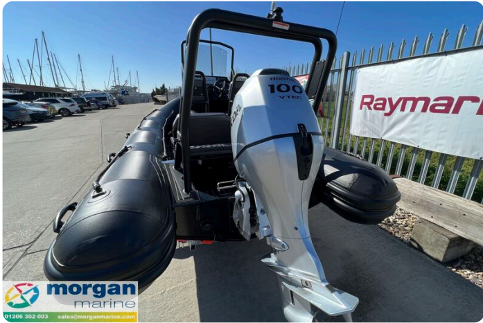
Highfield Patrol 500 aluminium RIB - Honda BF100 outboard