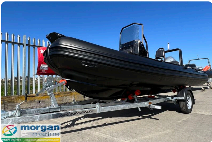
Highfield Patrol 500 aluminium RIB - under bow and hull