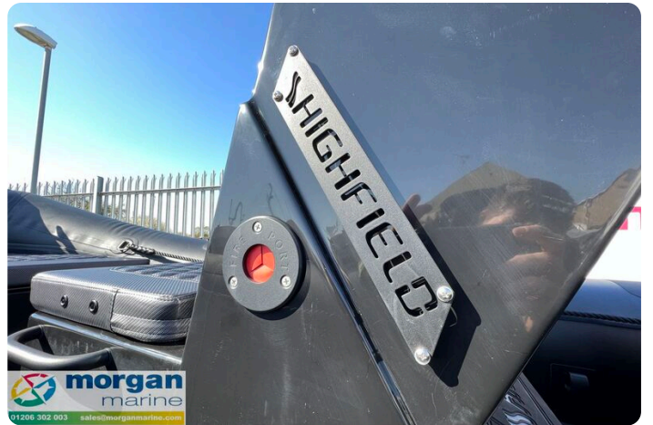
Highfield Patrol 500 aluminium RIB - decal