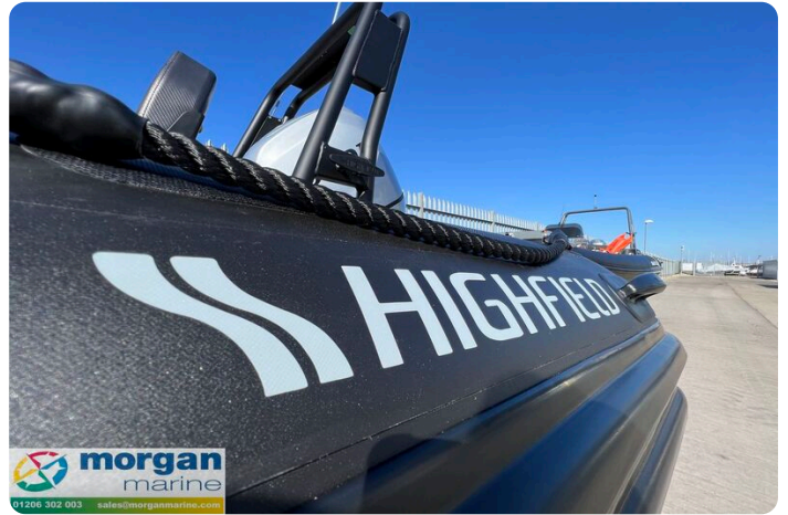
Highfield Patrol 500 aluminium RIB - decal on tube