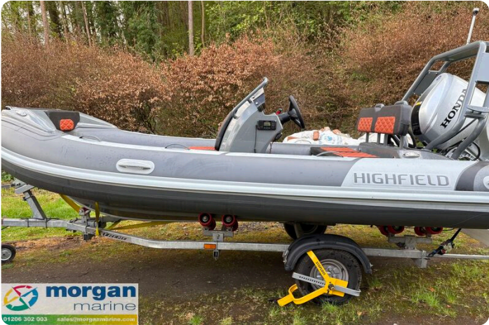
Highfield Sport 420 - Main