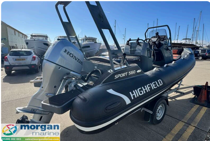
Highfield Sport 560 Hunter - grab - handles