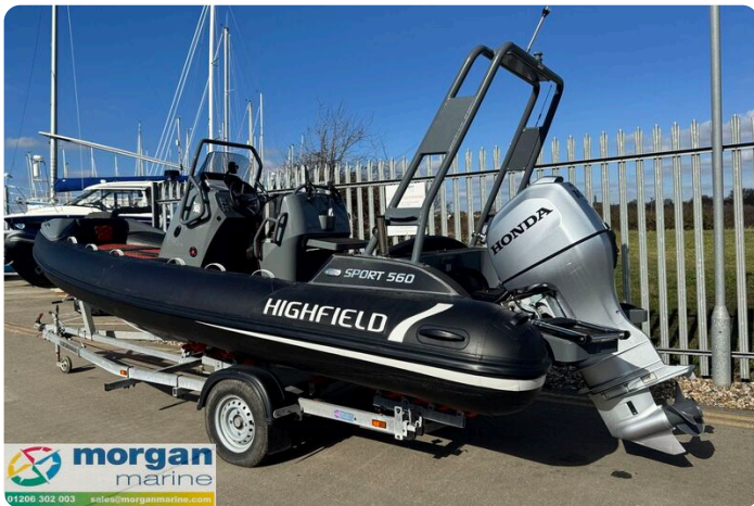
Highfield Sport 560 Hunter - back view