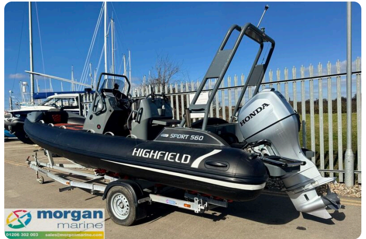
Highfield Sport 560 Hunter - A-frame