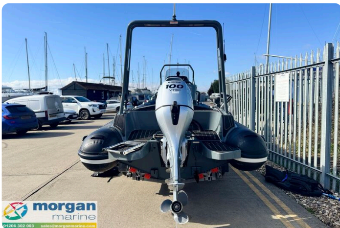
Highfield Sport 560 Hunter - engine