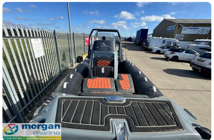
Highfield Sport 560 Hunter - bow step