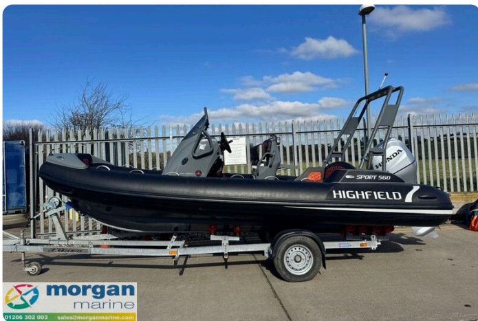
Highfield Sport 560 Hunter - side view