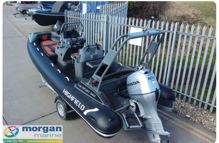
Highfield Sport 560 Hunter - Honda