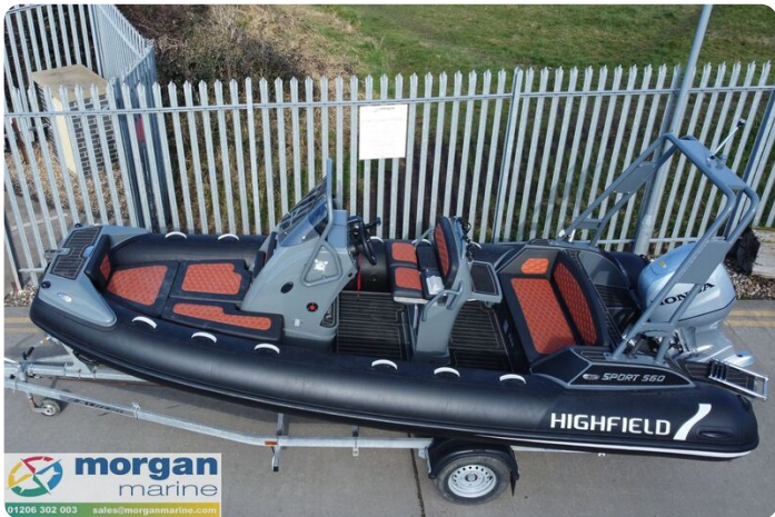
Highfield Sport 560 Hunter - overview