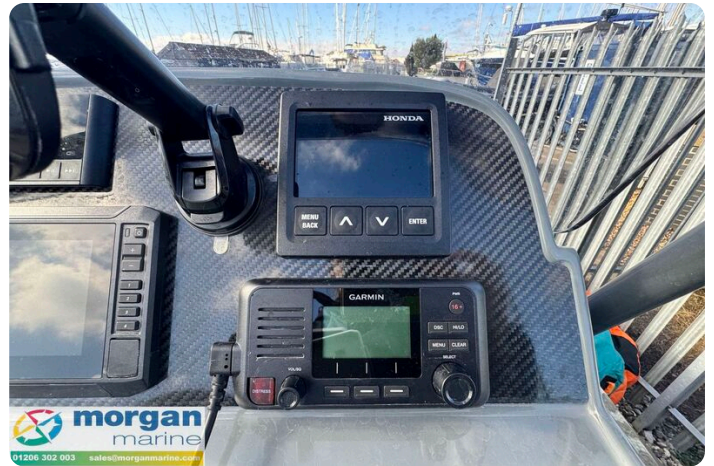
Highfield Sport 560 Hunter - VHF Radio