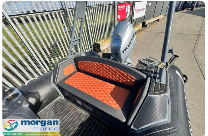
Highfield Sport 560 Hunter - bench seating