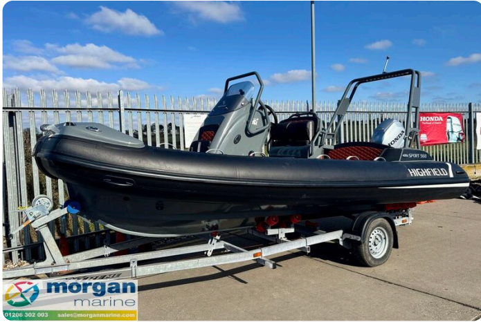
Highfield Sport 560 Hunter - front