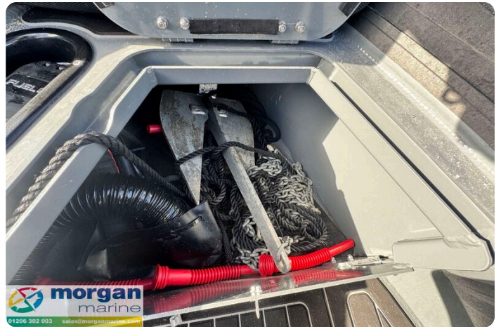
Highfield Sport 560 Hunter - anchor locker