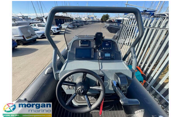
Highfield Sport 560 Hunter - dash