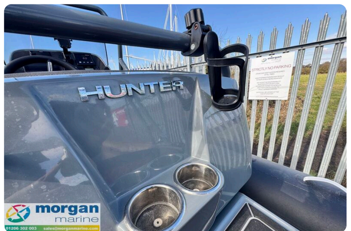
Highfield Sport 560 Hunter - cup holders