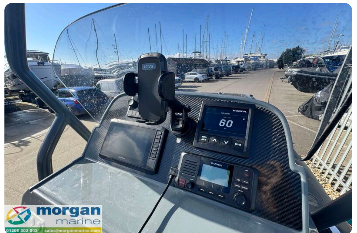
Highfield Sport 560 Hunter - fusions