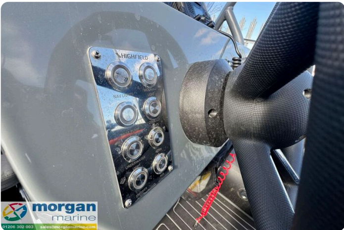
Highfield Sport 560 Hunter - controls