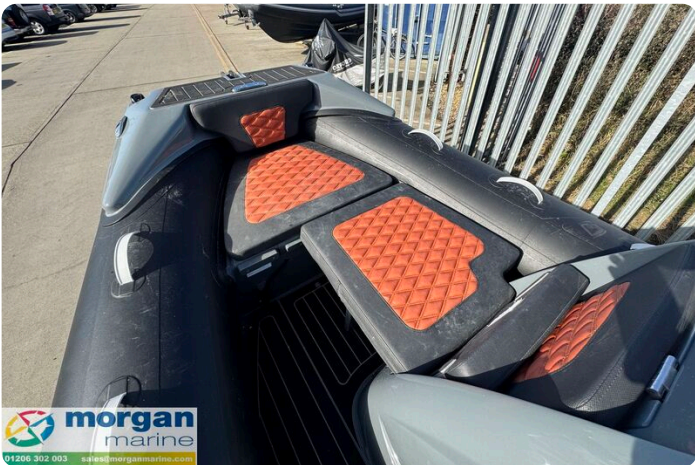
Highfield Sport 560 Hunter - bow seating