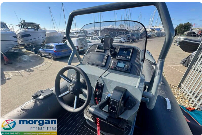
Highfield Sport 560 Hunter - controls