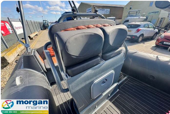
Highfield Sport 560 Hunter - fold up