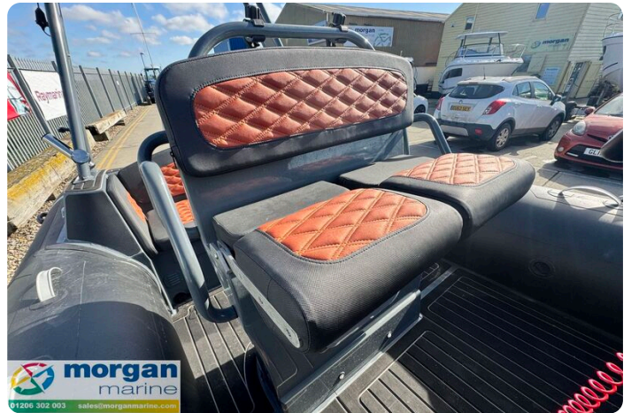
Highfield Sport 560 Hunter - chair