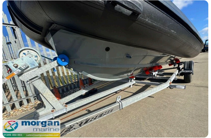
Highfield Sport 560 Hunter - hull