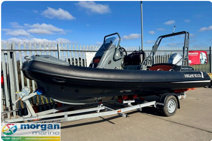
Highfield Sport 560 Hunter - Main