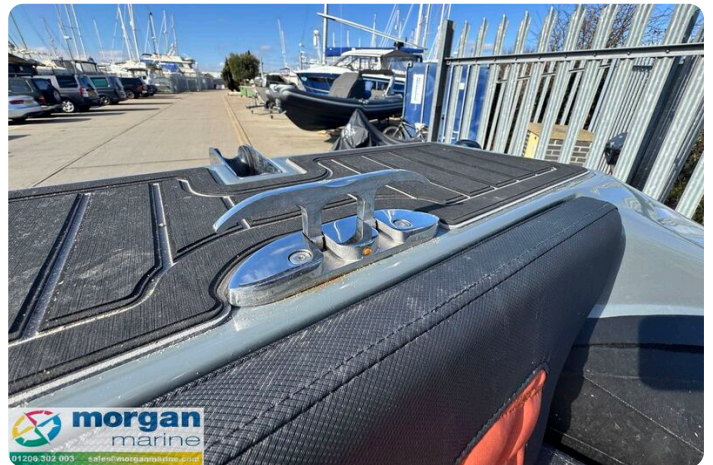
Highfield Sport 560 Hunter - pop up cleats