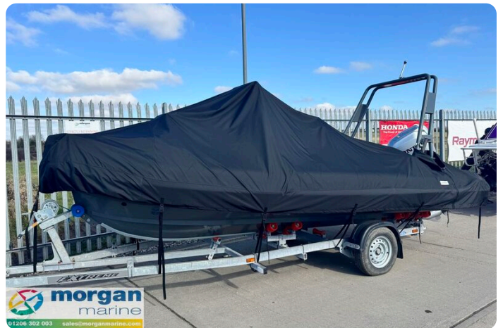
Highfield Sport 560 Hunter - full cover