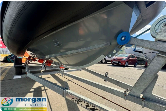
Highfield Sport 560 Hunter - rollers