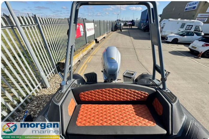
Highfield Sport 560 Hunter - bench seat