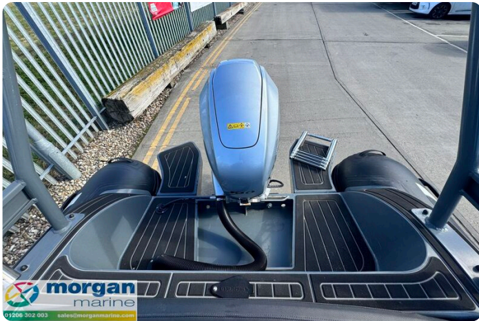
Highfield Sport 560 Hunter - back swim platforms