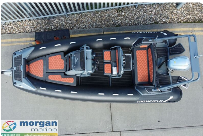
Highfield Sport 560 Hunter - top view