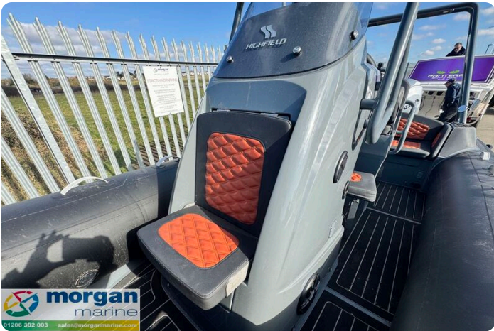
Highfield Sport 560 Hunter - console seat