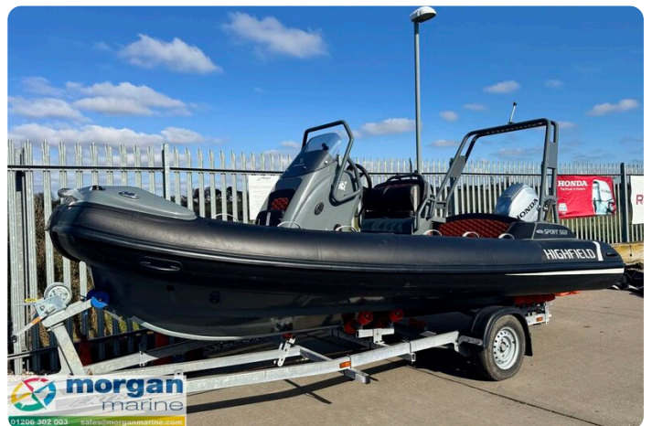
Highfield Sport 560 Hunter - side