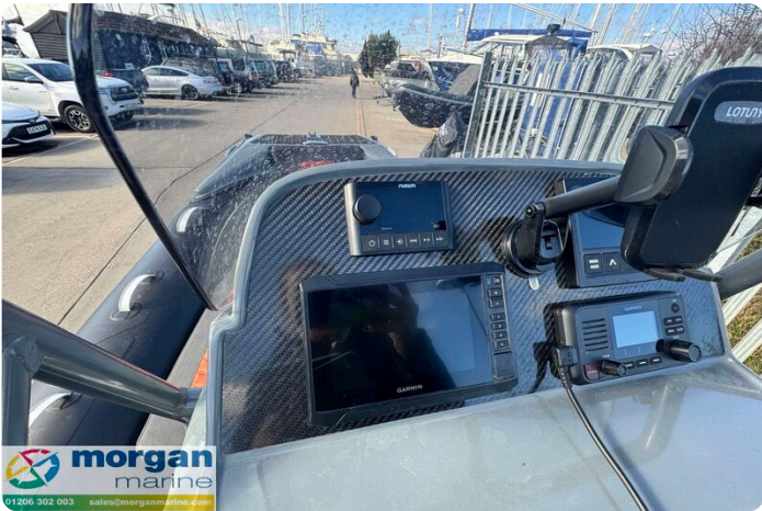
Highfield Sport 560 Hunter - Garmin plotter