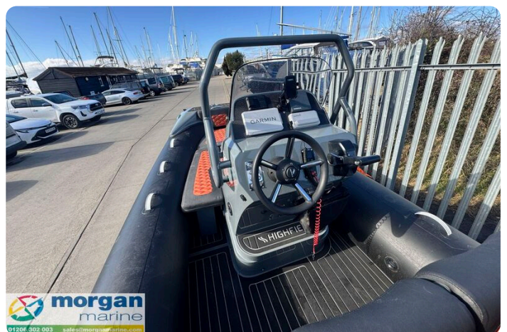
Highfield Sport 560 Hunter - steering wheel