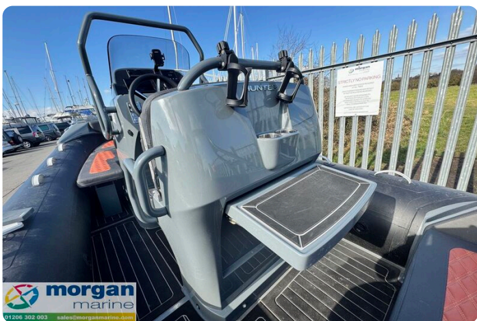
Highfield Sport 560 Hunter - pop up table