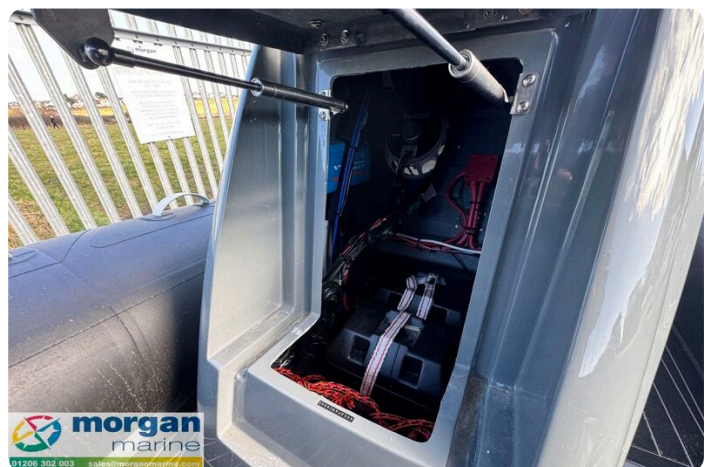
Highfield Sport 560 Hunter - console storage