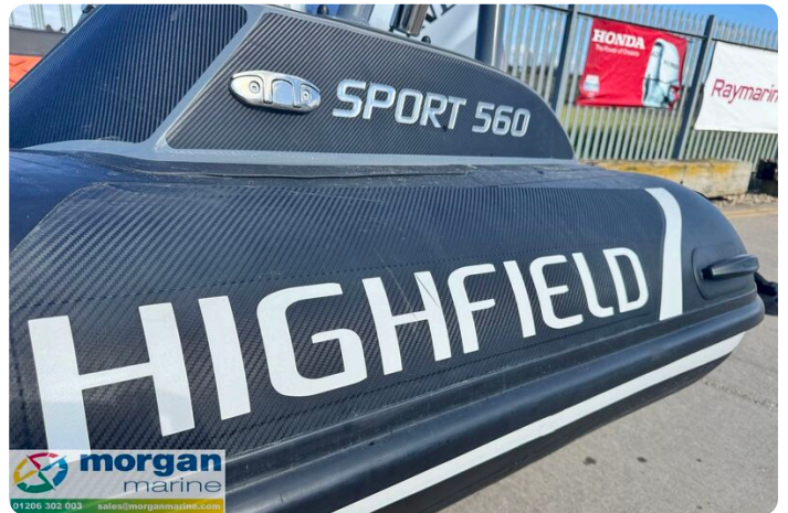
Highfield Sport 560 Hunter - make