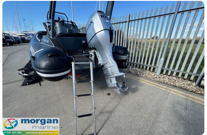
Highfield Sport 560 Hunter - ladder