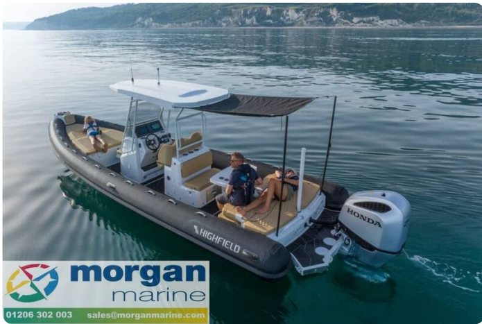
Highfield Sport 800 aluminium RIB