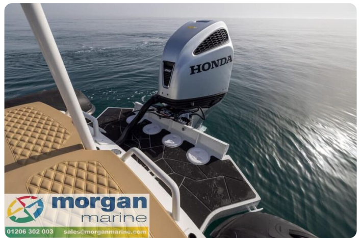
Highfield Sport 800 aluminium RIB - transom with Honda outboard