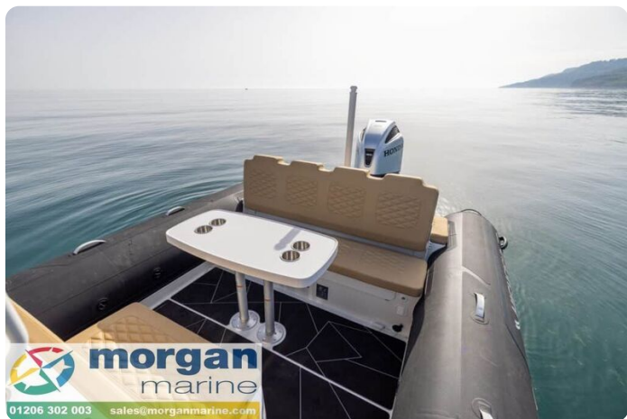
Highfield Sport 800 aluminium RIB - aft table and seating