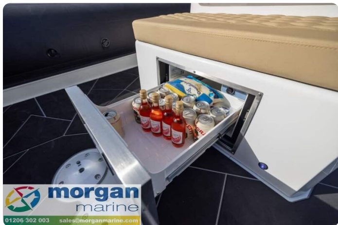
Highfield Sport 800 aluminium RIB - drinks storage