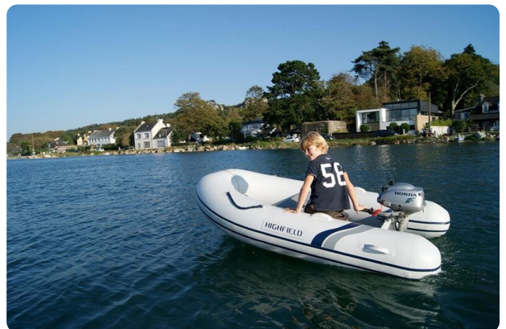
Highfield UL 240 aluminium RIB - on the water