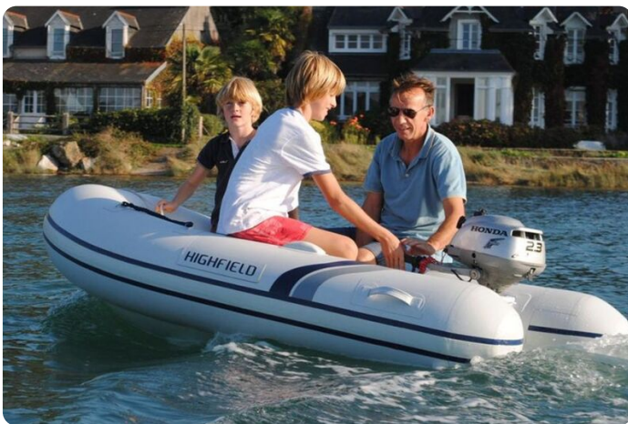
Highfield UL 240 aluminium RIB