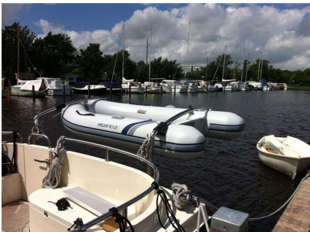
Highfield UL 340 aluminium RIB - on a larger boat