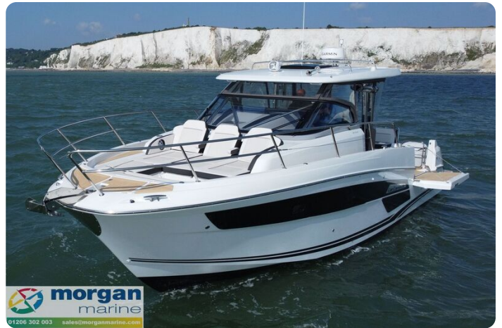
Jeanneau Cap Camarat 12.5 WA - seating in bow