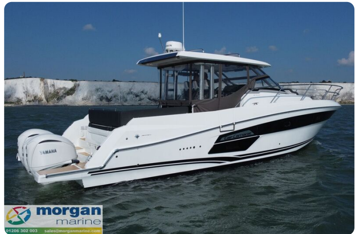
Jeanneau Cap Camarat 12.5 WA - starboard side from aft