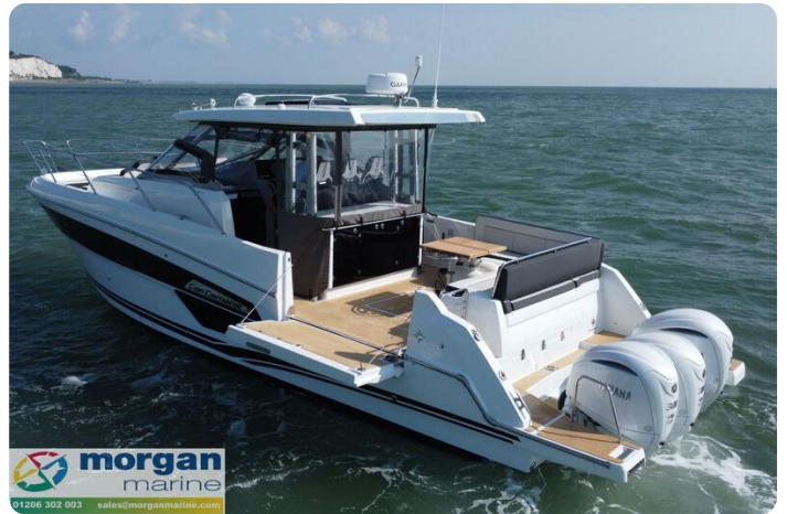
Jeanneau Cap Camarat 12.5 WA - overhead view of cockpit