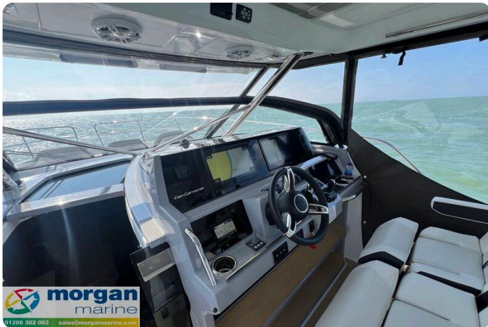
Jeanneau Cap Camarat 12.5 WA - helm position with great visibility