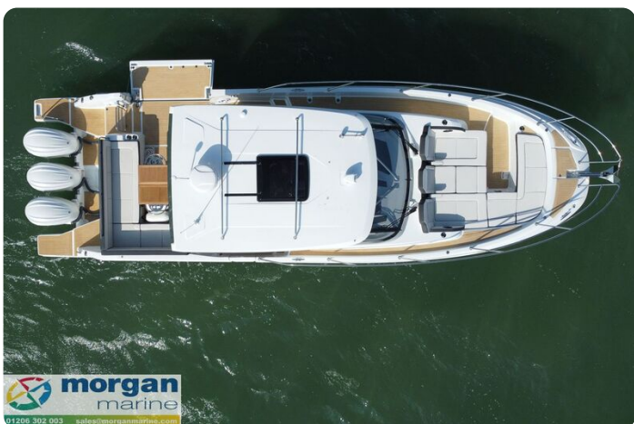
Jeanneau Cap Camarat 12.5 WA - overhead view of roof from port side