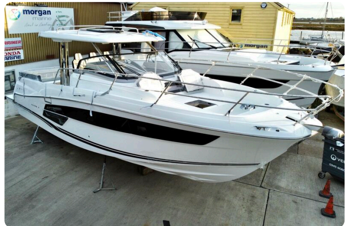
Jeanneau Cap Camarat 12.5 WA in Morgan Marine's yard