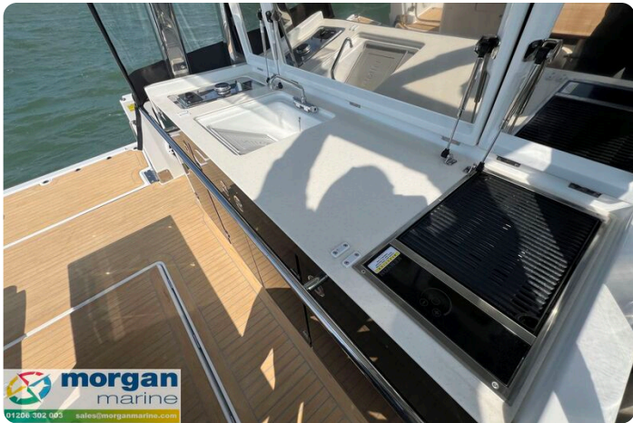
Jeanneau Cap Camarat 12.5 WA - cockpit galley