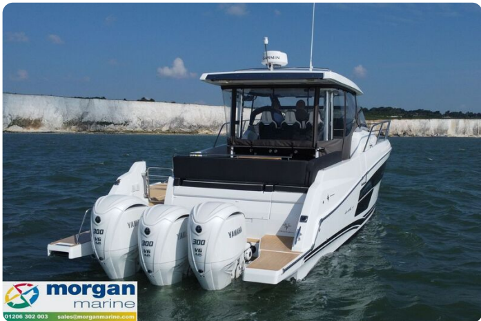
Jeanneau Cap Camarat 12.5 WA - transom from starboard side aft