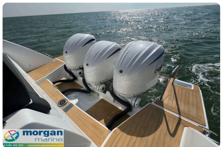
Jeanneau Cap Camarat 12.5 WA - triple Yamaha outboards from the swim platform