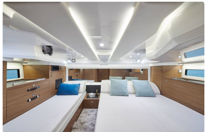
Jeanneau Cap Camarat 12.5 WA - aft cabin