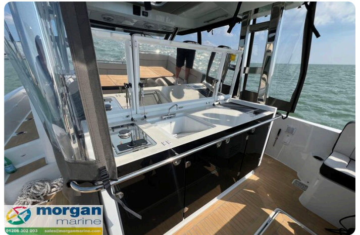
Jeanneau Cap Camarat 12.5 WA - full cockpit galley