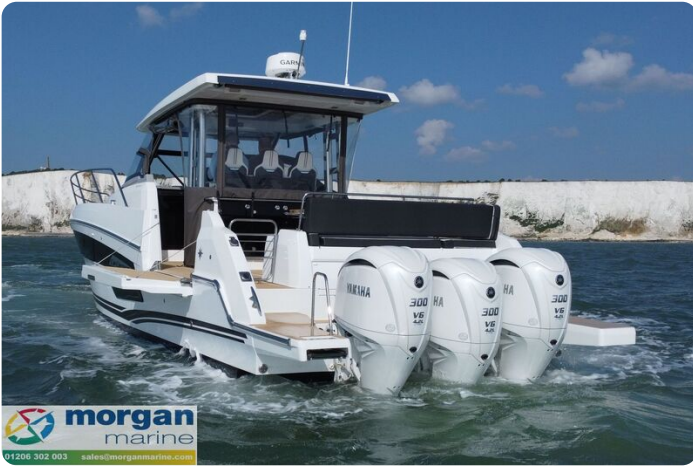
Jeanneau Cap Camarat 12.5 WA - view of transom from port side aft