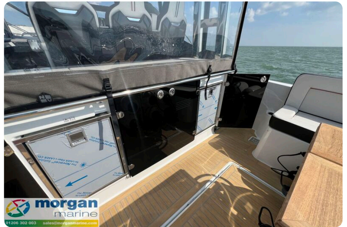
Jeanneau Cap Camarat 12.5 WA - cockpit galley with storage and fridge