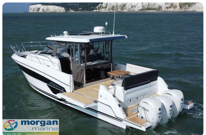
Jeanneau Cap Camarat 12.5 WA - open port side terrace