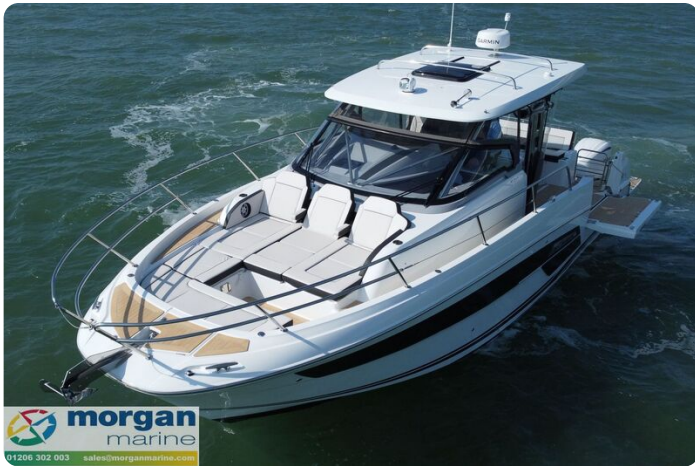
Jeanneau Cap Camarat 12.5 WA - overhead view towards bow