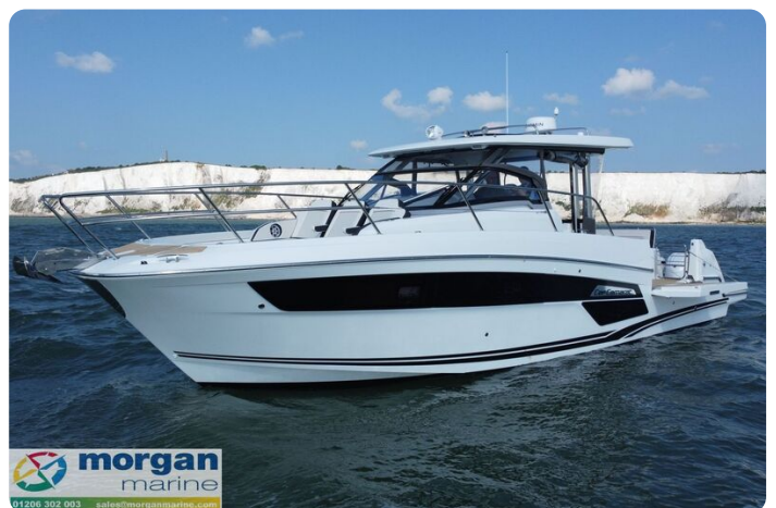
Jeanneau Cap Camarat 12.5 WA - view from bow on the water