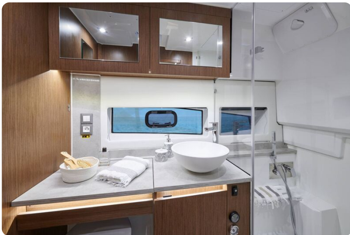
Jeanneau Cap Camarat 12.5 WA - toilet compartment