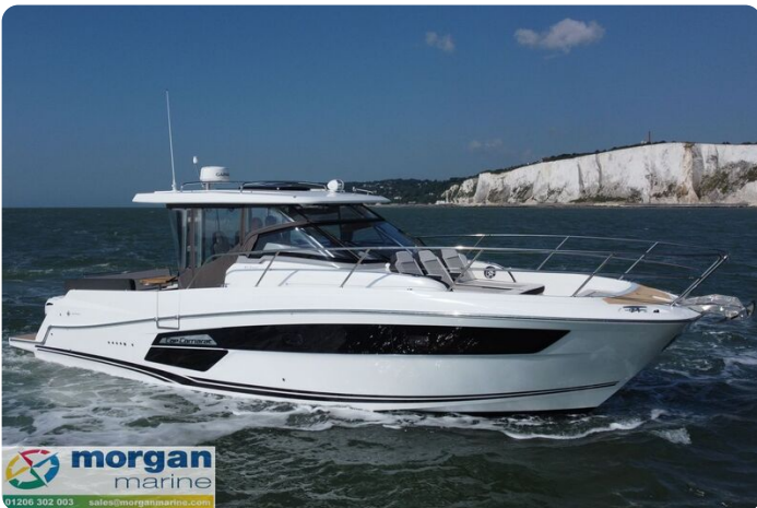
Jeanneau Cap Camarat 12.5 WA - bow from starboard side