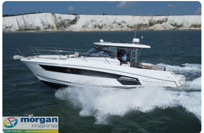
Jeanneau Cap Camarat 12.5 WA - port side