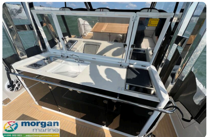
Jeanneau Cap Camarat 12.5 WA - cockpit galley with sink and grill