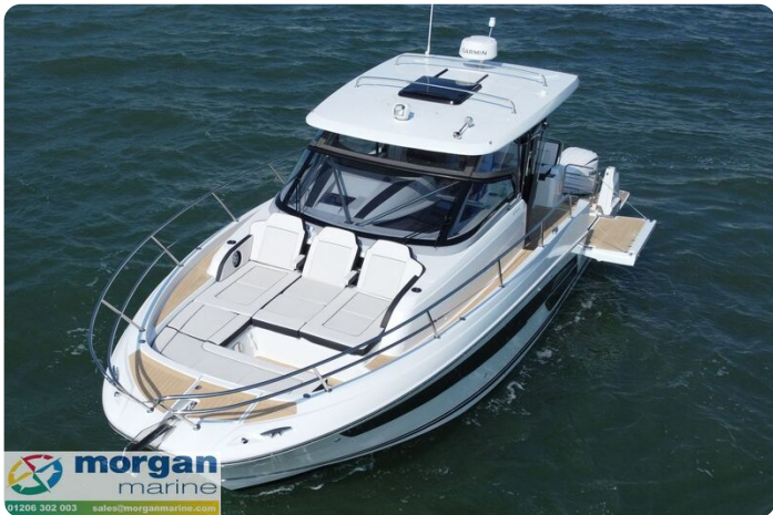
Jeanneau Cap Camarat 12.5 WA - bow seating