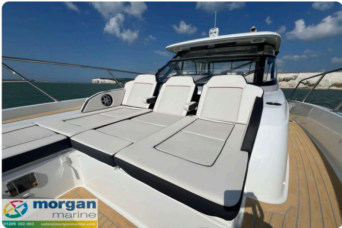
Jeanneau Cap Camarat 12.5 WA - seating on bow