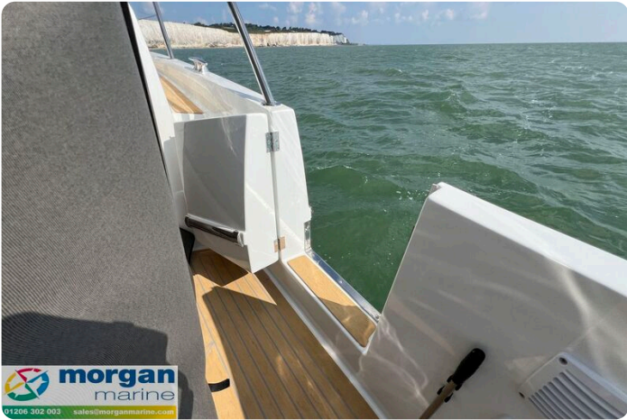
Jeanneau Cap Camarat 12.5 WA - starboard side cockpit gate for easy access to pontoons