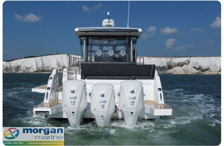
Jeanneau Cap Camarat 12.5 WA - transom with triple Yamaha outboards