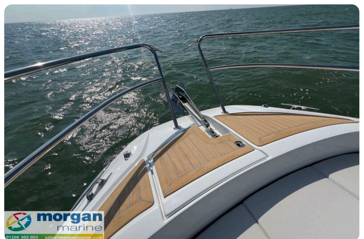
Jeanneau Cap Camarat 12.5 WA - anchor locker and pulpit rails