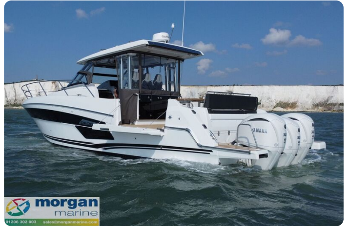
Jeanneau Cap Camarat 12.5 WA - view towards port side terrace and outboards