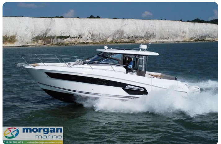
Jeanneau Cap Camarat 12.5 WA - moving through the water