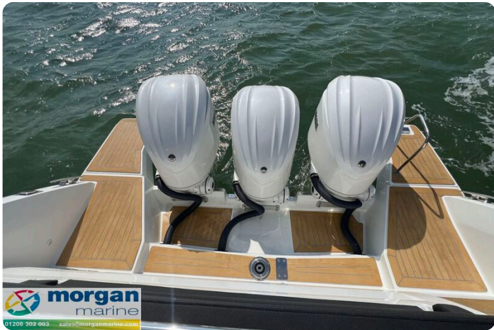
Jeanneau Cap Camarat 12.5 WA - triple Yamaha outboards from the cockpit