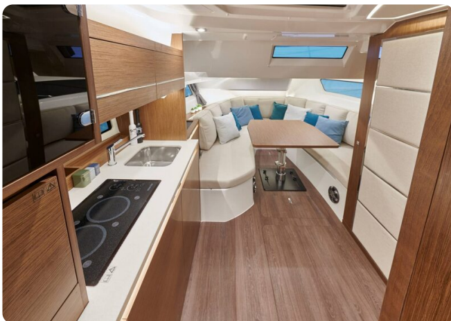
Jeanneau Cap Camarat 12.5 WA - galley in forward cabin / saloon