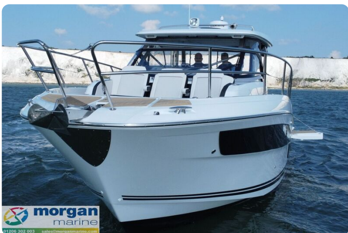
Jeanneau Cap Camarat 12.5 WA - bow seating