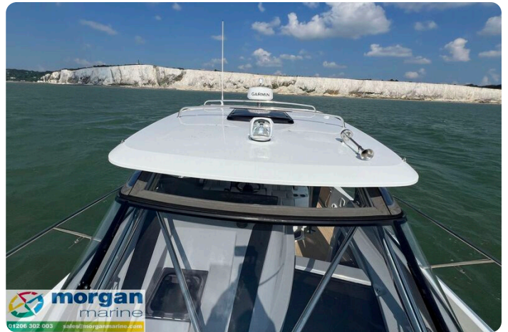
Jeanneau Cap Camarat 12.5 WA - overhead view of hardtop roof