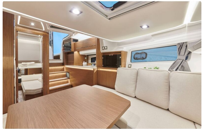
Jeanneau Cap Camarat 12.5 WA - forward cabin / saloon