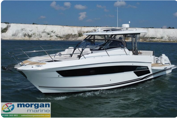
Jeanneau Cap Camarat 12.5 WA