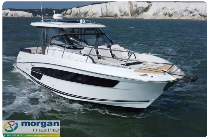
Jeanneau Cap Camarat 12.5 WA - starboard side bow