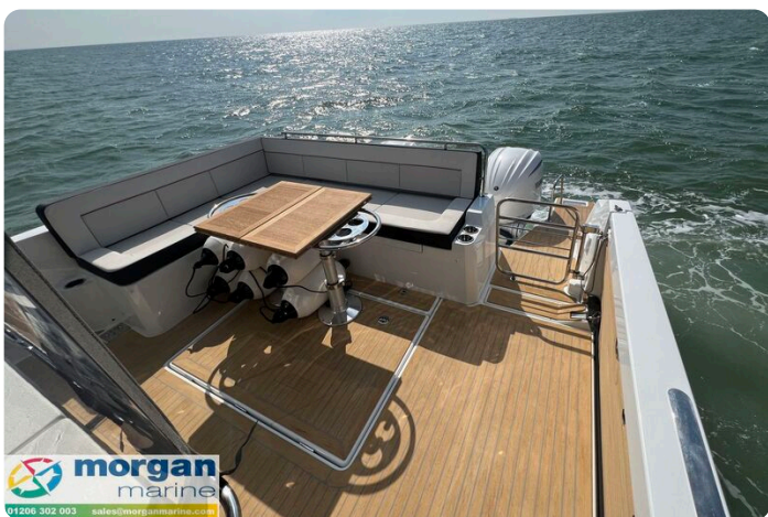
Jeanneau Cap Camarat 12.5 WA - cockpit