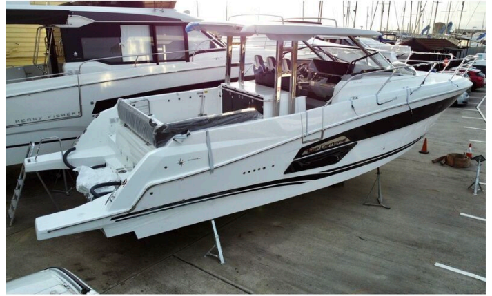
Jeanneau Cap Camarat 12.5 WA - starboard side