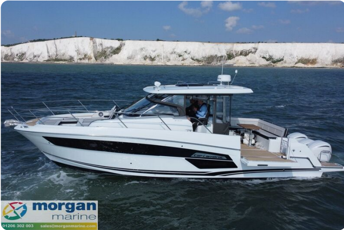
Jeanneau Cap Camarat 12.5 WA - port side view of cockpit and hardtop roof