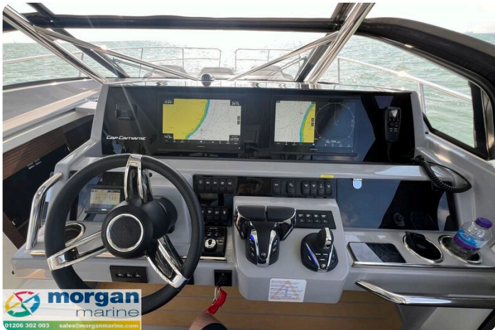
Jeanneau Cap Camarat 12.5 WA - full helm position