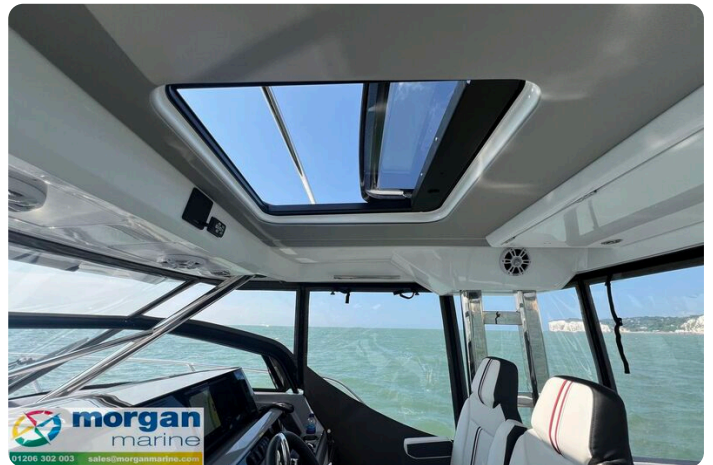
Jeanneau Cap Camarat 12.5 WA - hard top with electric sliding roof