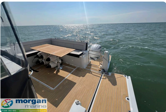
Jeanneau Cap Camarat 12.5 WA - inside cockpit with terrace open