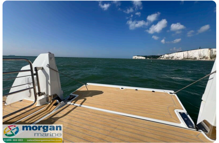
Jeanneau Cap Camarat 12.5 WA - view out to sea from cockpit and terrace