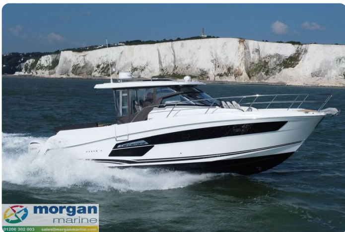
Jeanneau Cap Camarat 12.5 WA - starboard side