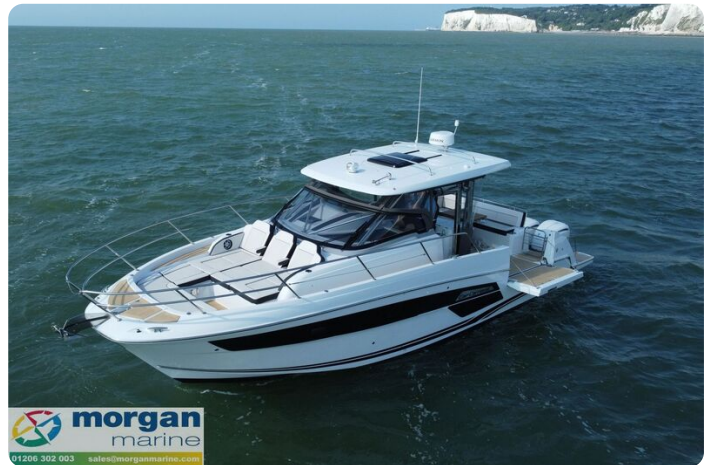
Jeanneau Cap Camarat 12.5 WA - overhead view of bow and hardtop roof