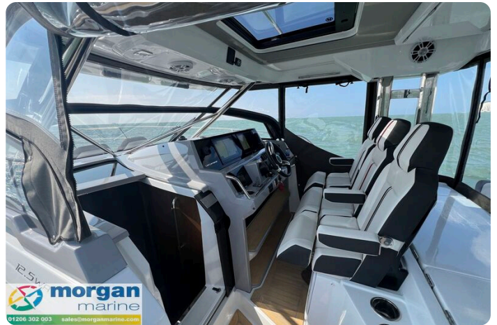
Jeanneau Cap Camarat 12.5 WA - door to cabin