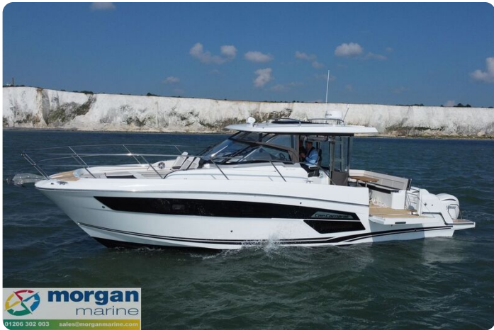
Jeanneau Cap Camarat 12.5 WA - port side with terrace open