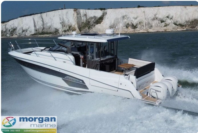
Jeanneau Cap Camarat 12.5 WA - port side aft