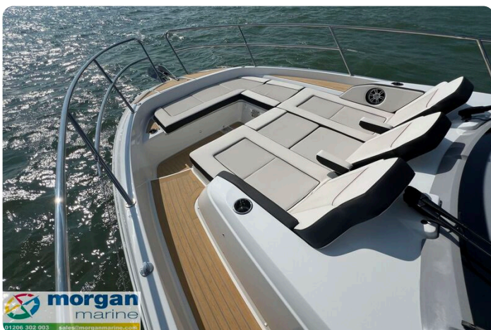
Jeanneau Cap Camarat 12.5 WA - side deck towards bow