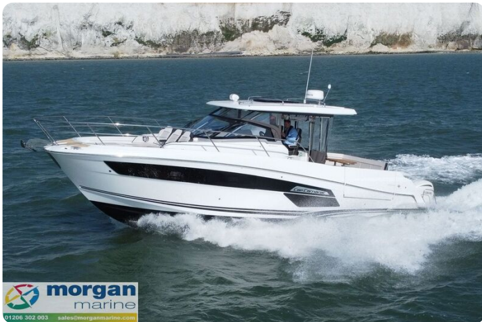
Jeanneau Cap Camarat 12.5 WA - port side on the water