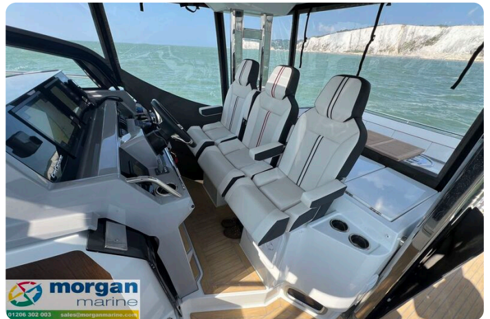
Jeanneau Cap Camarat 12.5 WA - engine controls and triple seats