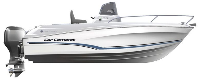
Jeanneau Cap Camarat 5.5 CC - diagram of side view