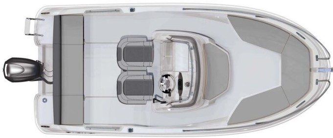
Jeanneau Cap Camarat 5.5 CC - diagram of overhead view