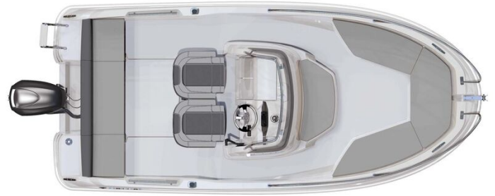
Jeanneau Cap Camarat 5.5 CC - diagram of overhead view