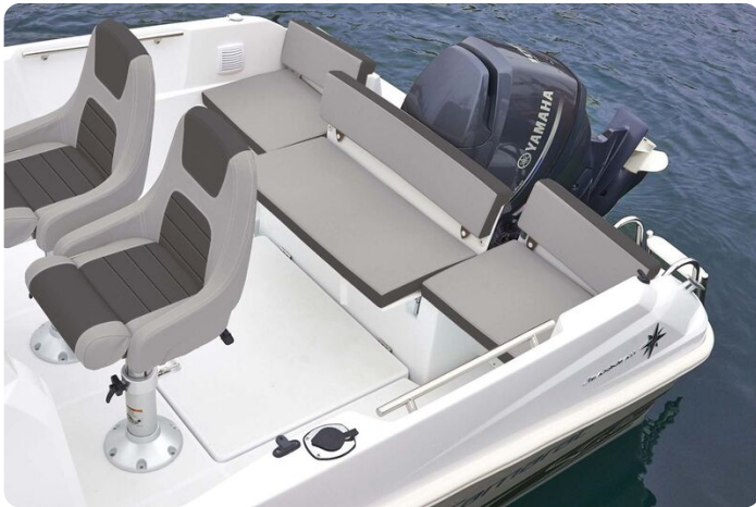
Jeanneau Cap Camarat 5.5 CC - sliding aft bench