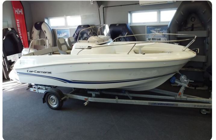
Jeanneau Cap Camarat 5.5 CC - starboard side