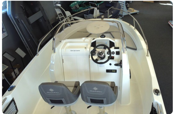
Jeanneau Cap Camarat 5.5 CC - pilot and co-pilot seats