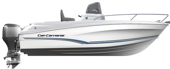
Jeanneau Cap Camarat 5.5 CC - diagram of side view