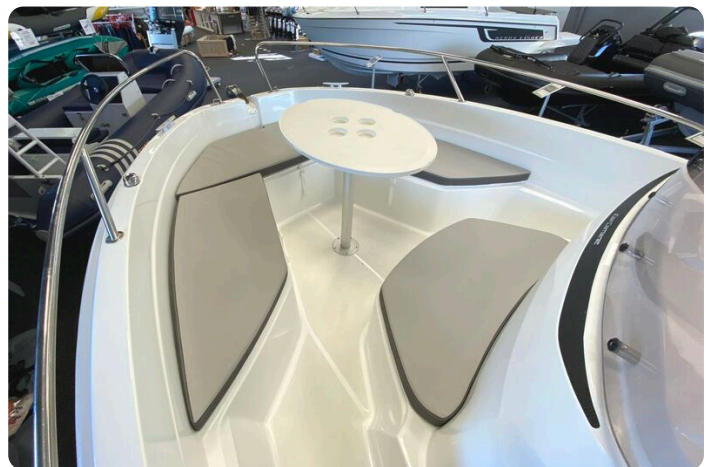
Jeanneau Cap Camarat 5.5 CC - bow seating with seating in-front of console