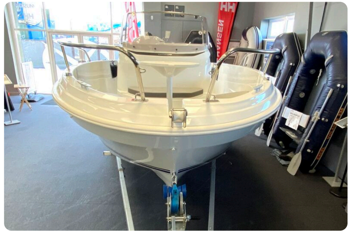
Jeanneau Cap Camarat 5.5 CC - bow