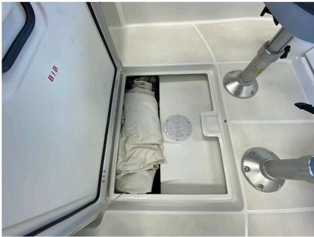
Jeanneau Cap Camarat 5.5 CC - storage under cockpit