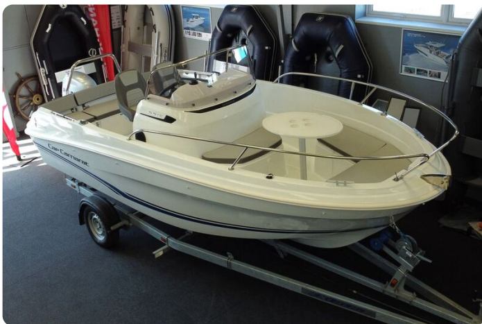
Jeanneau Cap Camarat 5.5 CC - bow seating from starboard side