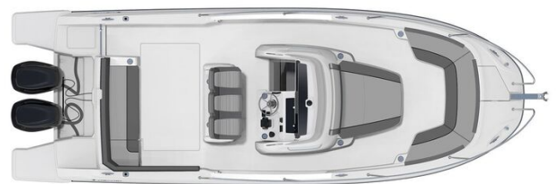
Jeanneau Cap Camarat 9.0 CC - layout diagram of cockpit