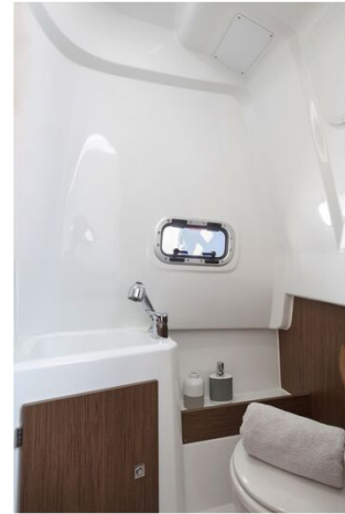
Jeanneau Cap Camarat 9.0 CC - toilet and shower compartment