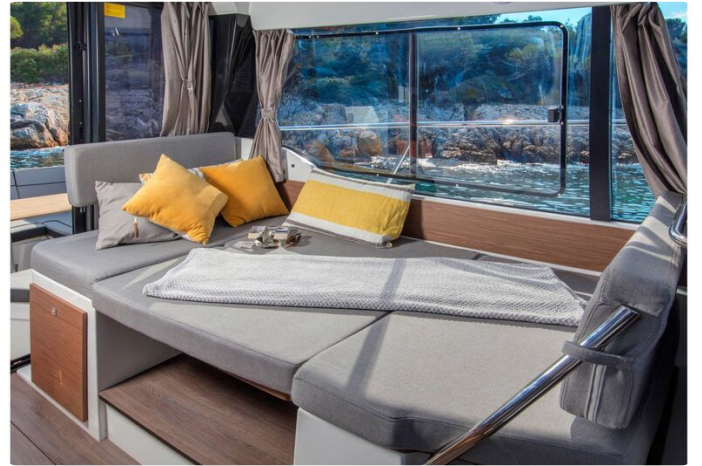
Jeanneau Merry Fisher 1095 - table in wheelhouse converts to berth