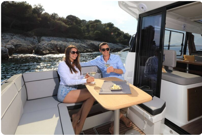
Jeanneau Merry Fisher 1095 - cockpit U shape saloon seating and table