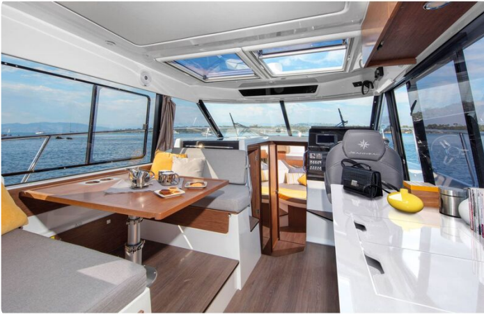
Jeanneau Merry Fisher 1095 - wheelhouse with port side seating and starboard side helm position and galley