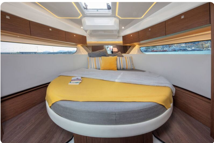
Jeanneau Merry Fisher 1095 - main cabin with double berth and hatch to deck