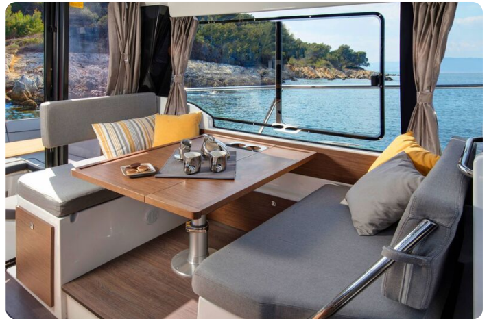
Jeanneau Merry Fisher 1095 - wheelhouse saloon seating and table