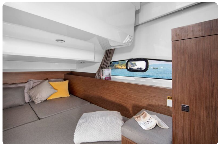
Jeanneau Merry Fisher 1095 - 3rd cabin