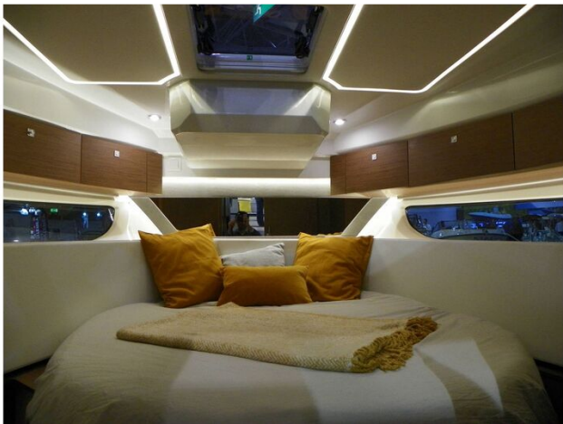
Jeanneau Merry Fisher 1095 - LED lights in the cabins