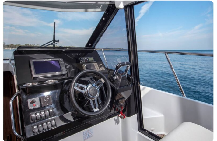
Jeanneau Merry Fisher 1095 - helm position and side door