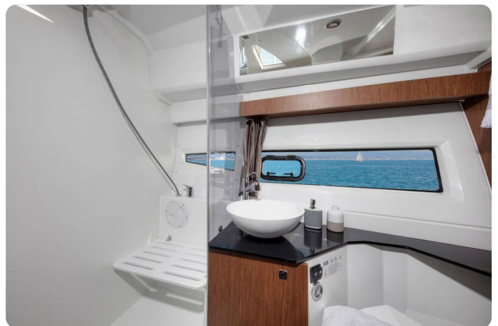
Jeanneau Merry Fisher 1095 - toilet and shower