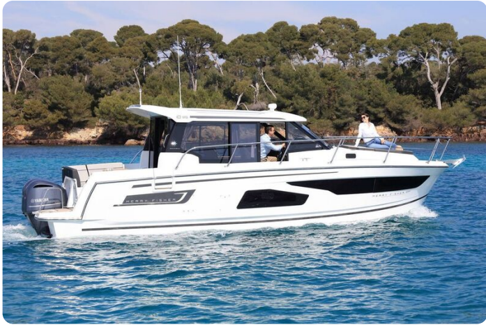
Jeanneau Merry Fisher 1095