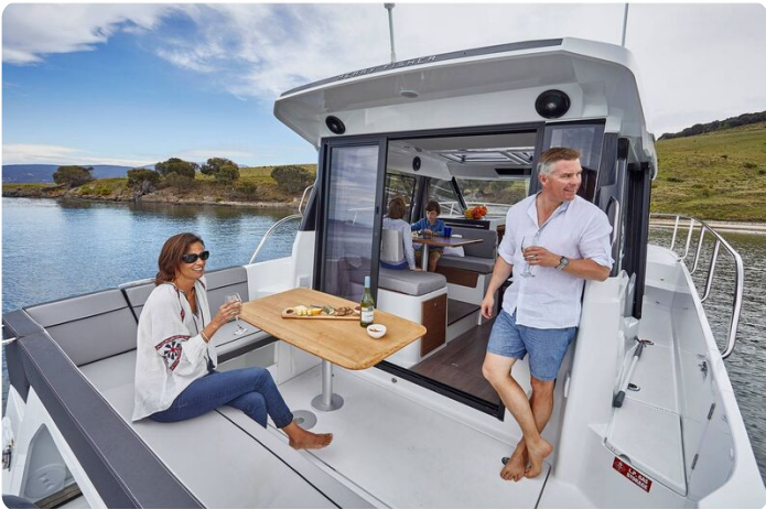
Jeanneau Merry Fisher 1095 - view from cockpit to wheelhouse