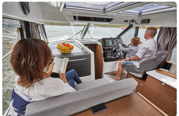
Jeanneau Merry Fisher 1095 - co-pilot seat and pilot seat