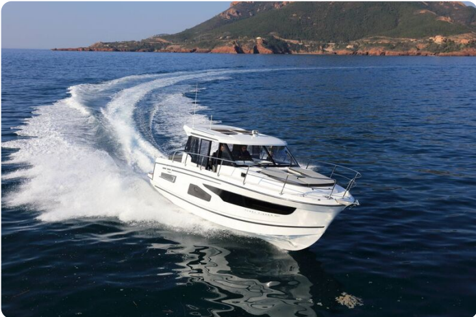
Jeanneau Merry Fisher 1095 - on the water