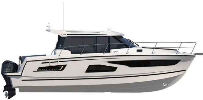
Jeanneau Merry Fisher 1095 - diagram of starboard side