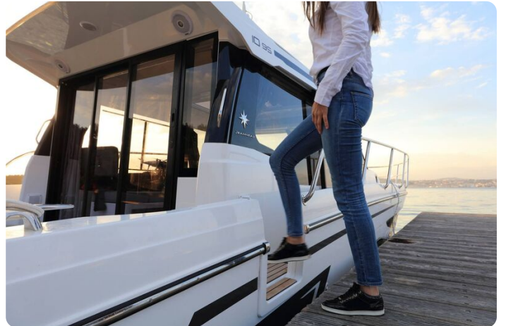
Jeanneau Merry Fisher 1095 - cockpit side gate for easy access from pontoon