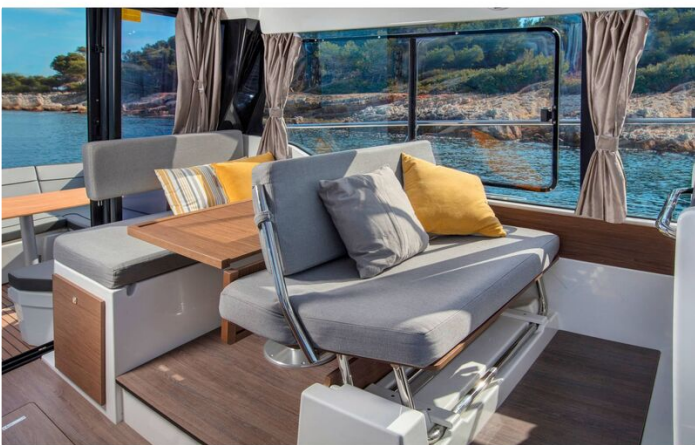
Jeanneau Merry Fisher 1095 - table folds and forward seat converts to co-pilot seat