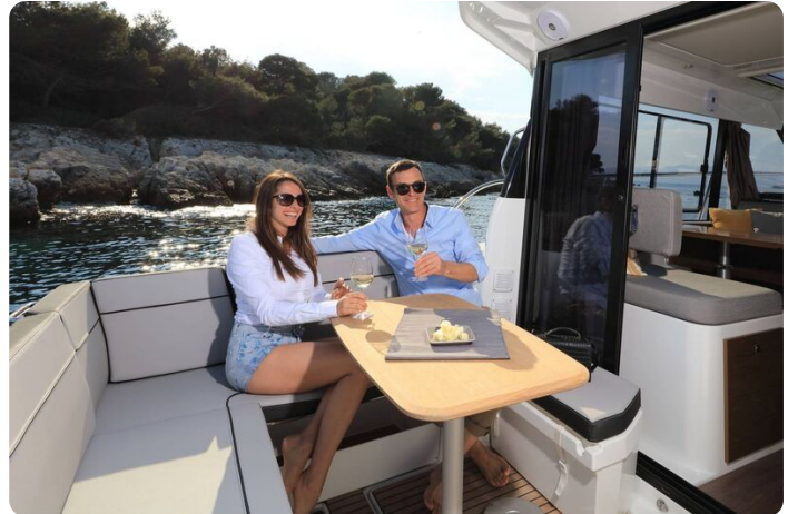
Jeanneau Merry Fisher 1095 - cockpit U shape saloon seating and table