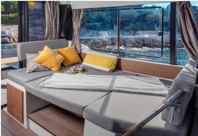
Jeanneau Merry Fisher 1095 - table in wheelhouse converts to berth