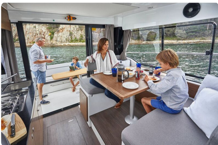
Jeanneau Merry Fisher 1095 - view from wheelhouse to cockpit