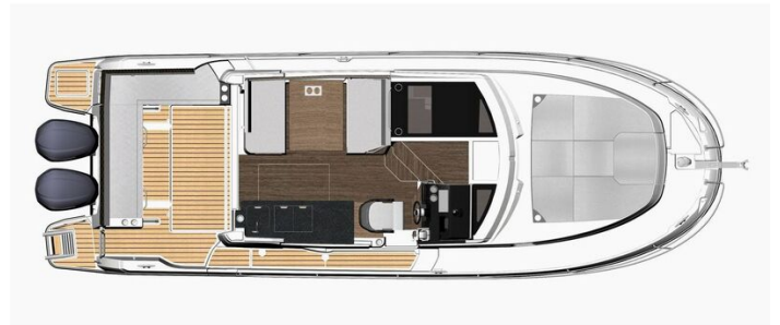
Jeanneau Merry Fisher 1095 - diagram of wheelhouse and bow