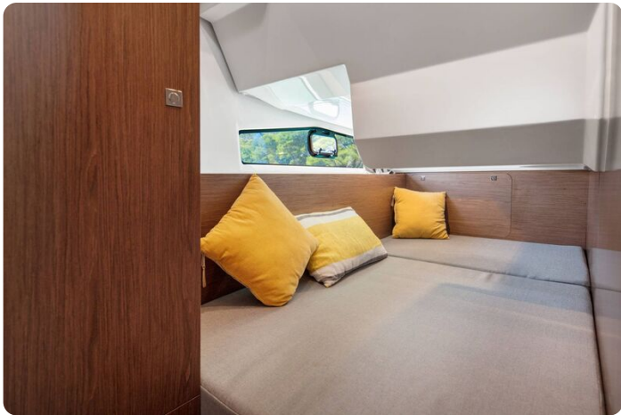
Jeanneau Merry Fisher 1095 - 2nd cabin