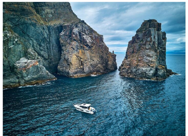
Jeanneau Merry Fisher 1095 - in beautiful surroundings