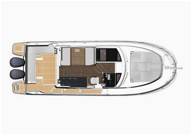
Jeanneau Merry Fisher 1095 Fly - diagram of top view and wheelhouse interior