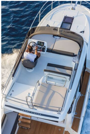
Jeanneau Merry Fisher 1095 Fly - overhead view of flybridge