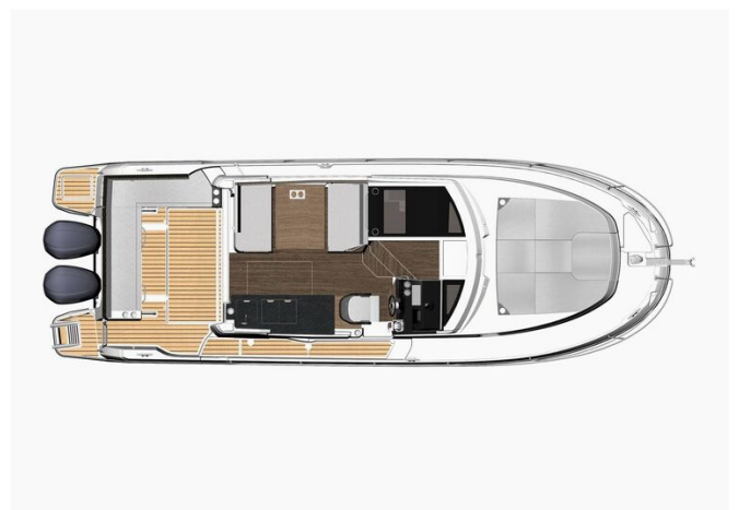
Jeanneau Merry Fisher 1095 Flybridge - diagram of wheelhouse layout