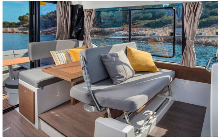
Jeanneau Merry Fisher 1095 Flybridge - co-pilot seat converts to seating at saloon table