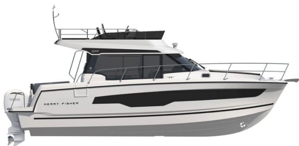
Jeanneau Merry Fisher 1095 Flybridge - diagram of starboard side