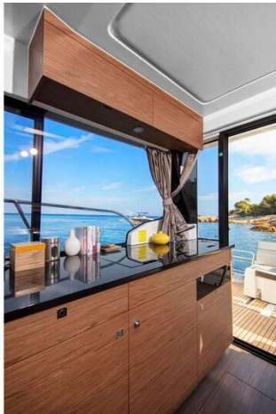
Jeanneau Merry Fisher 1095 Flybridge - wheelhouse galley