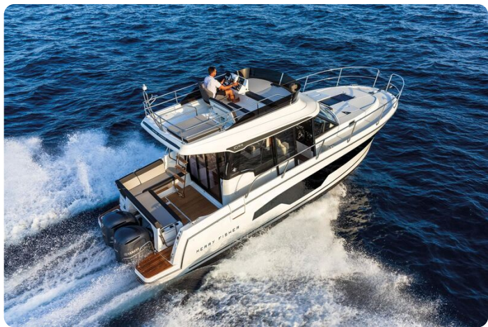
Jeanneau Merry Fisher 1095 Flybridge