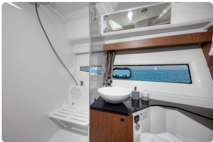
Jeanneau Merry Fisher 1095 Flybridge - toilet compartment