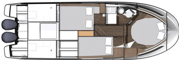
Jeanneau Merry Fisher 1095 Flybridge - diagram of cabins layout