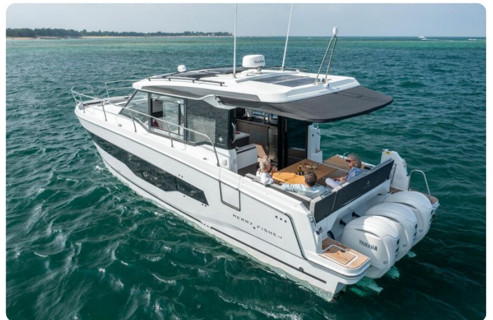
Jeanneau Merry Fisher 1295 Coupe - aft port side