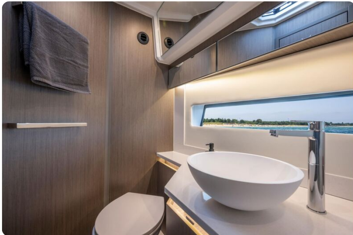
Jeanneau Merry Fisher 1295 Coupe - toilet and wash basin