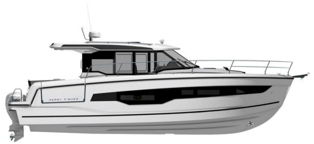
Jeanneau Merry Fisher 1295 Coupe - diagram of side view