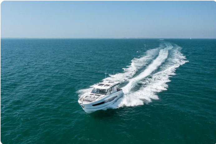
Jeanneau Merry Fisher 1295 Coupe - boat moving through the water