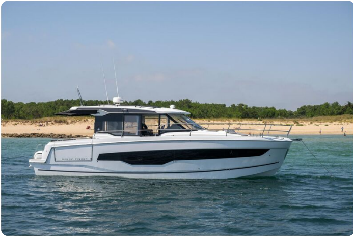
Jeanneau Merry Fisher 1295 Coupe - on the water starboard side