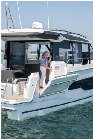
Jeanneau Merry Fisher 1295 Coupe - electric folding terrace in operation