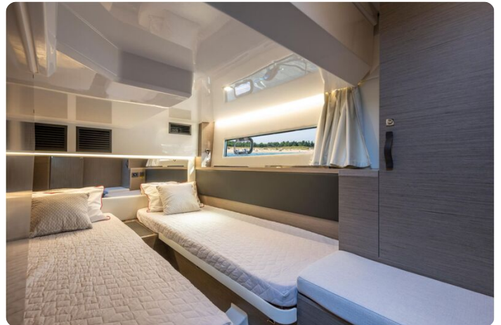
Jeanneau Merry Fisher 1295 Coupe - 2nd cabin