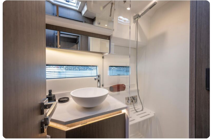
Jeanneau Merry Fisher 1295 Coupe - wash basin and shower