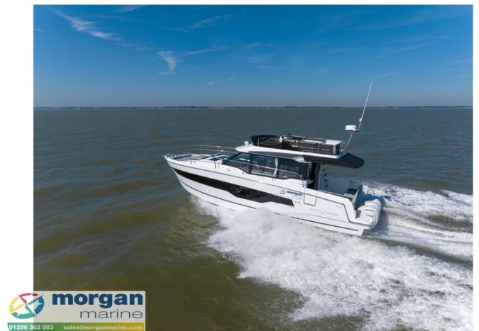
Jeanneau Merry Fisher 1295 Flybridge - port side on the water