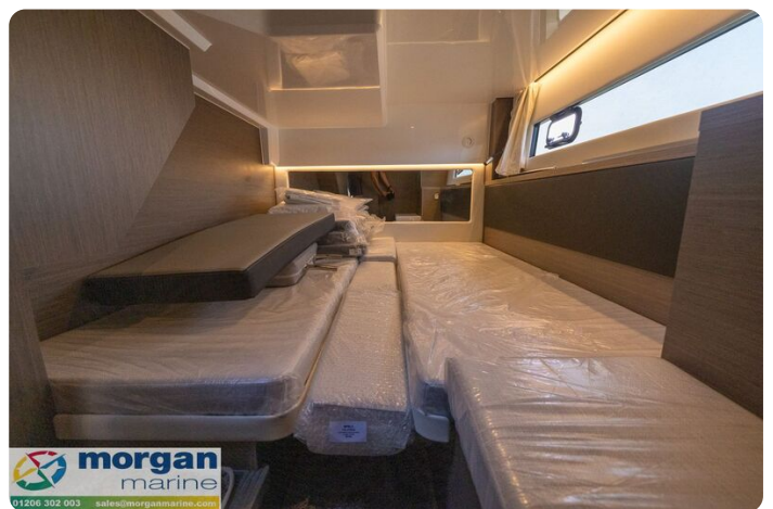
Jeanneau Merry Fisher 1295 Flybridge - 3rd cabin with two single berths and infill