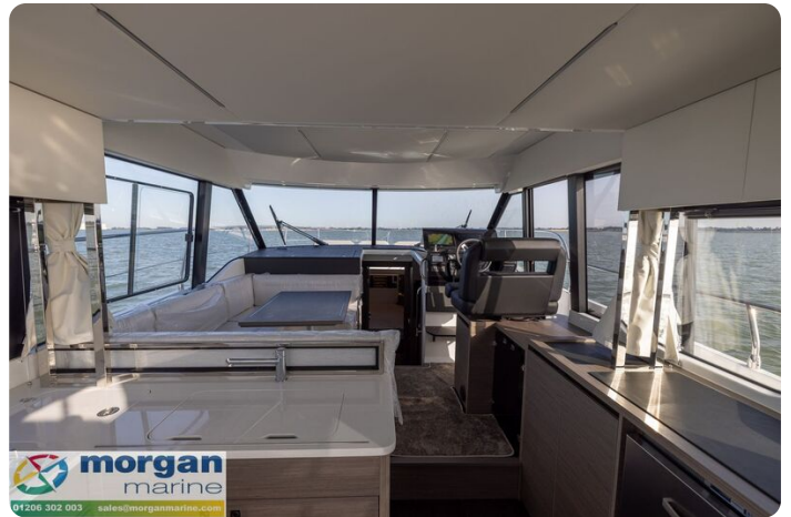
Jeanneau Merry Fisher 1295 Flybridge - wheelhouse saloon with galley