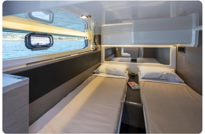
Jeanneau Merry Fisher 1295 Flybridge - port side aft cabin