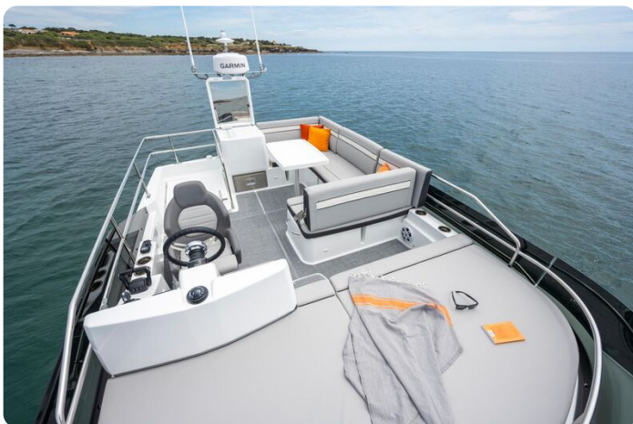
Jeanneau Merry Fisher 1295 Flybridge - flybridge