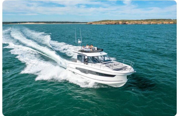
Jeanneau Merry Fisher 1295 Flybridge - on the water