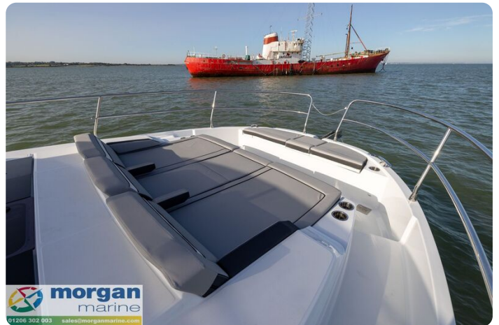
Jeanneau Merry Fisher 1295 Flybridge - bow sun loungers