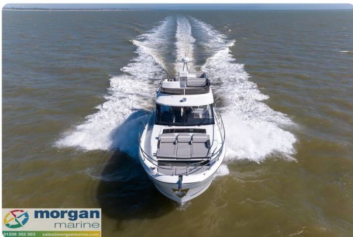
Jeanneau Merry Fisher 1295 Fly - overhead view coming towards camera