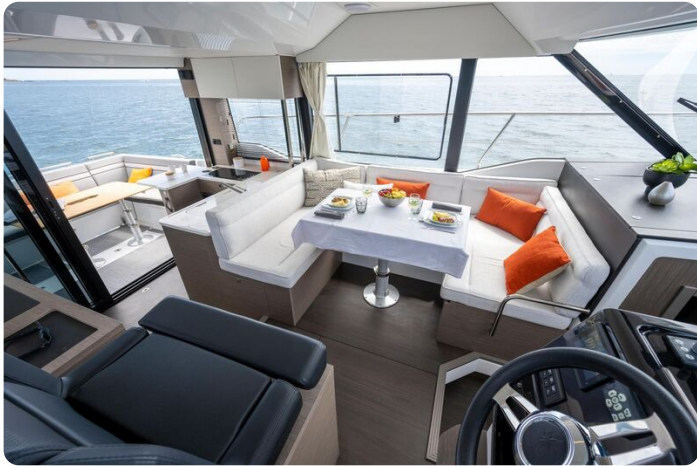
Jeanneau Merry Fisher 1295 Flybridge - wheelhouse saloon