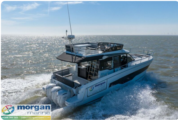
Jeanneau Merry Fisher 1295 Flybridge - overhead view from starboard side aft