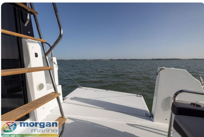
Jeanneau Merry Fisher 1295 Flybridge - ladder to flybridge