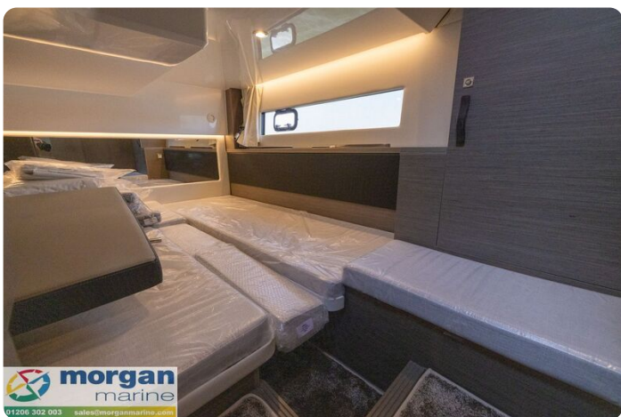
Jeanneau Merry Fisher 1295 Flybridge - 3rd cabin with two single berths