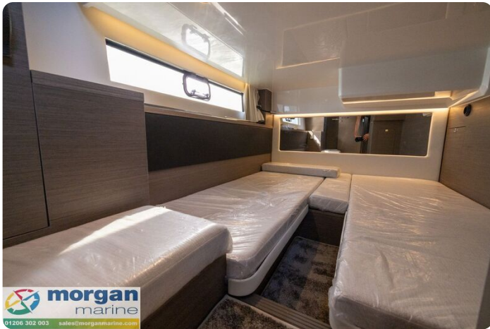
Jeanneau Merry Fisher 1295 Flybridge - 2nd cabin