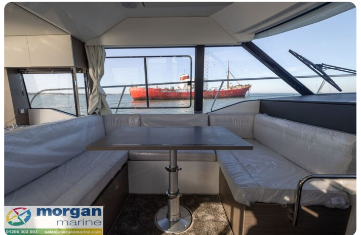
Jeanneau Merry Fisher 1295 Flybridge - saloon seating and table