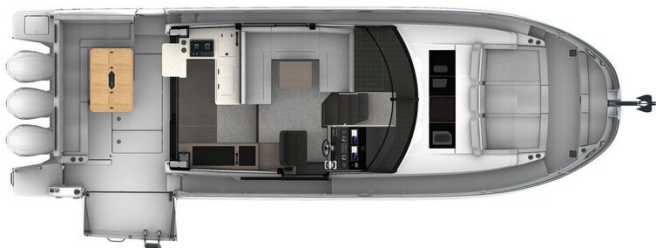
Jeanneau Merry Fisher 1295 Flybridge - diagram of wheelhouse interior