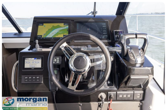
Jeanneau Merry Fisher 1295 Flybridge - dash and engine controls