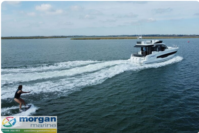
Jeanneau Merry Fisher 1295 Fly - wakeboarding - view towards aft