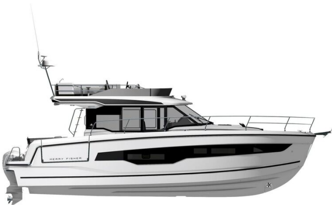
Jeanneau Merry Fisher 1295 Flybridge - diagram of side view