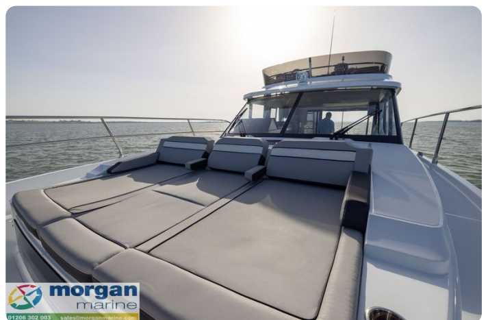
Jeanneau Merry Fisher 1295 Flybridge - bow sun lounge - view towards flybridge