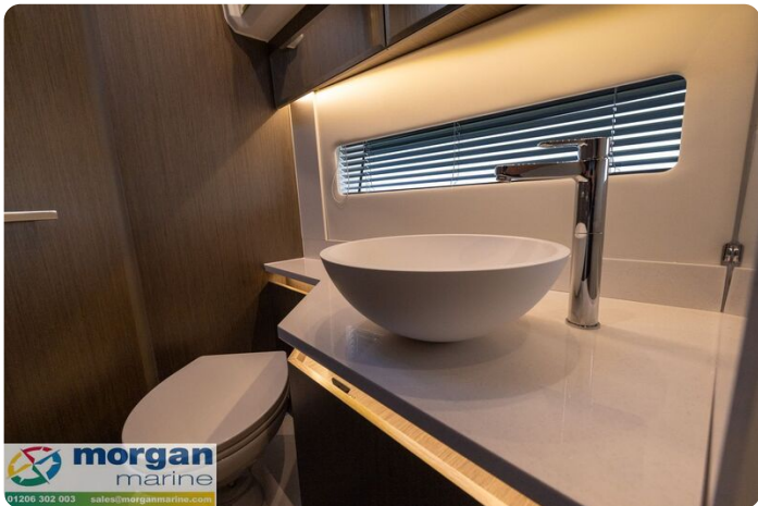
Jeanneau Merry Fisher 1295 Flybridge - toilet compartment