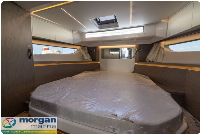
Jeanneau Merry Fisher 1295 Flybridge - forward cabin with double berth