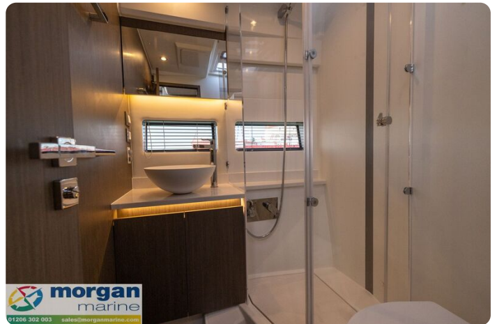
Jeanneau Merry Fisher 1295 Flybridge - toilet compartment with shower