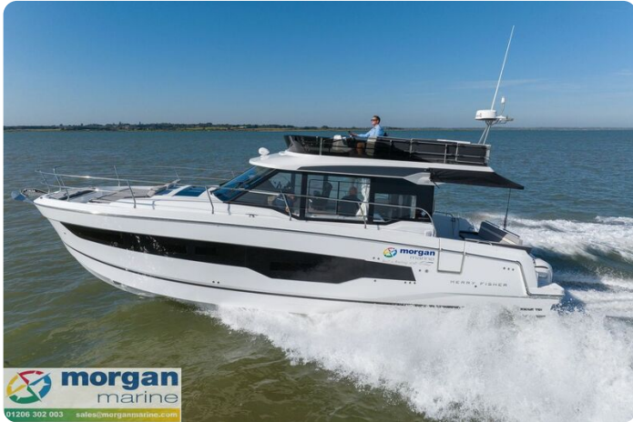
Jeanneau Merry Fisher 1295 Fly