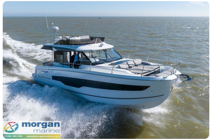
Jeanneau Merry Fisher 1295 Flybridge - overhead view from starboard side