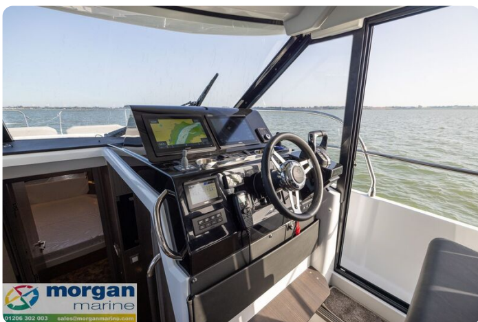
Jeanneau Merry Fisher 1295 Flybridge - helm position with side door