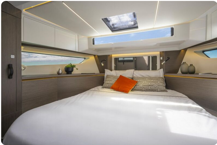
Jeanneau Merry Fisher 1295 Flybridge - forward cabin with double berth and roof hatch