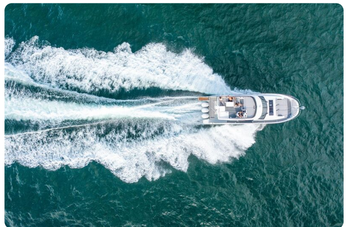
Jeanneau Merry Fisher 1295 Flybridge - on the water overhead view