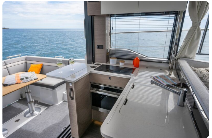
Jeanneau Merry Fisher 1295 Flybridge - galley