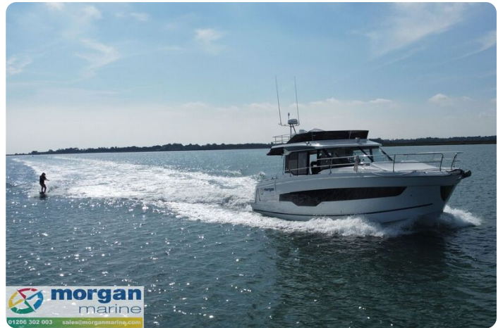
Jeanneau Merry Fisher 1295 Flybridge - wakeboarding - starboard side view