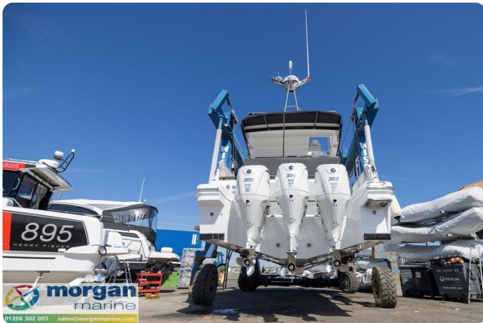
Jeanneau Merry Fisher 1295 Fly - triple Yamaha engines