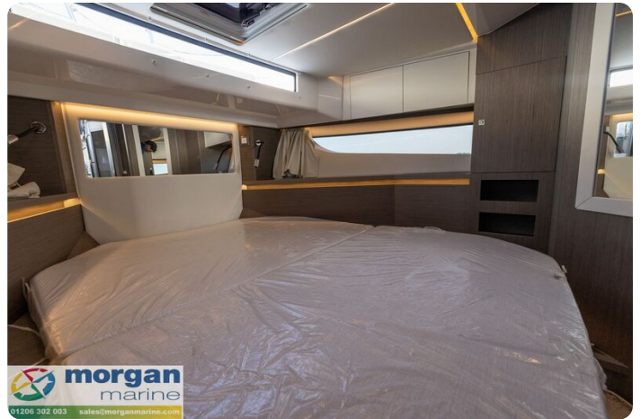
Jeanneau Merry Fisher 1295 Flybridge - 2nd cabin