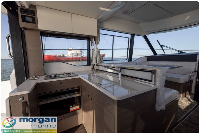
Jeanneau Merry Fisher 1295 Flybridge - cockpit galley