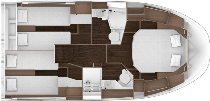
Jeanneau Merry Fisher 1295 Flybridge - diagram of cabins layout