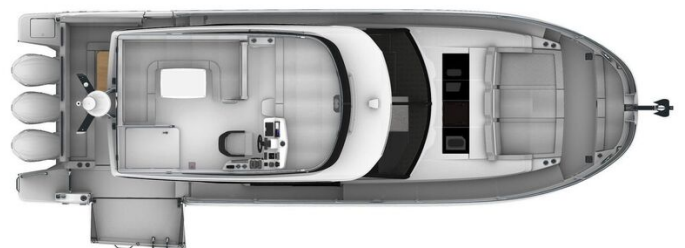
Jeanneau Merry Fisher 1295 Flybridge - diagram of overhead layout