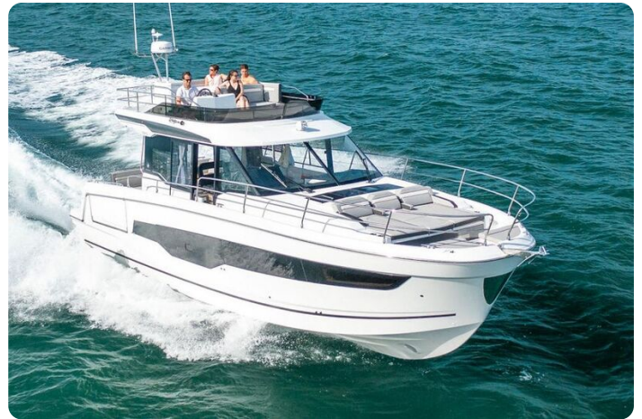
Jeanneau Merry Fisher 1295 Flybridge