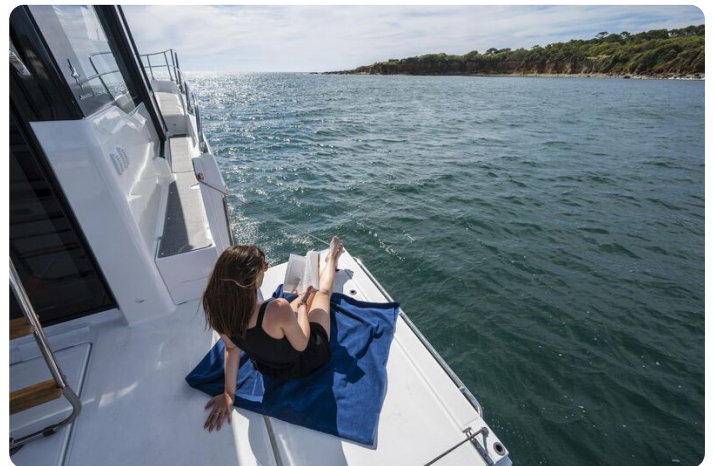
Jeanneau Merry Fisher 1295 Flybridge - folding terrace