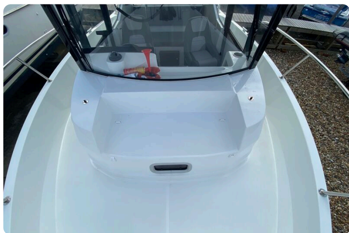
Jeanneau Merry Fisher 795 Marlin-front-seating