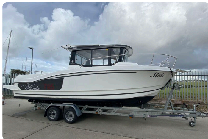
Jeanneau Merry Fisher 795 Marlin - starboard side