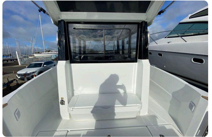
Jeanneau Merry Fisher 795 Marlin-window