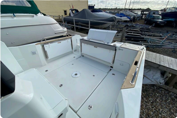
Jeanneau Merry Fisher 795 Marlin-deck