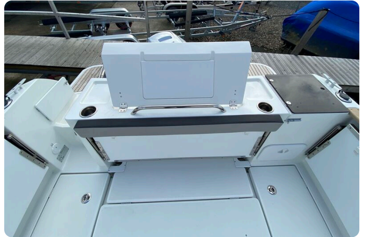
Jeanneau Merry Fisher 795 Marlin-storage