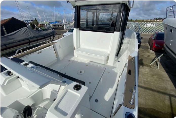
Jeanneau Merry Fisher 795 Marlin-back-deck