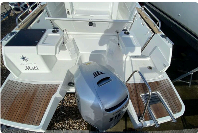
Jeanneau Merry Fisher 795 Marlin-engine