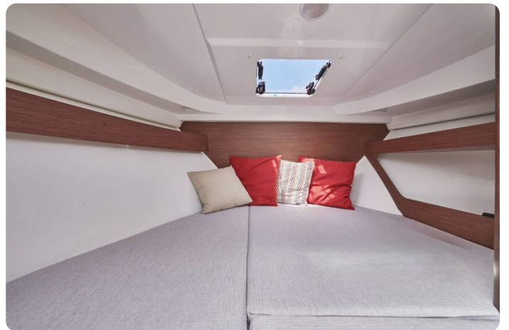
Jeanneau Merry Fisher 795 Series 2 - cabin with double berth and hatch to deck