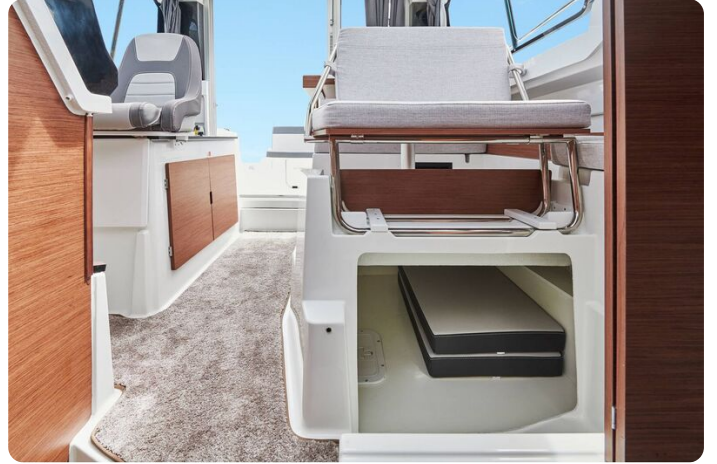
Jeanneau Merry Fisher 795 Series 2 - storage under seat