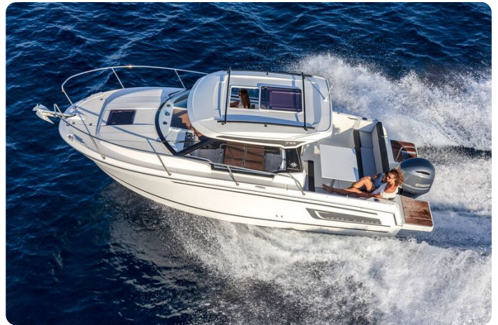
Jeanneau Merry Fisher 795 Series 2 - overhead view from port side