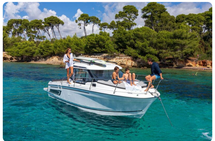
Jeanneau Merry Fisher 795 Series 2 - relaxing on the water