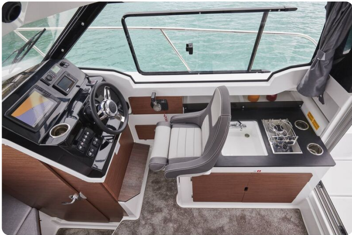
Jeanneau Merry Fisher 795 Series 2 - helm position