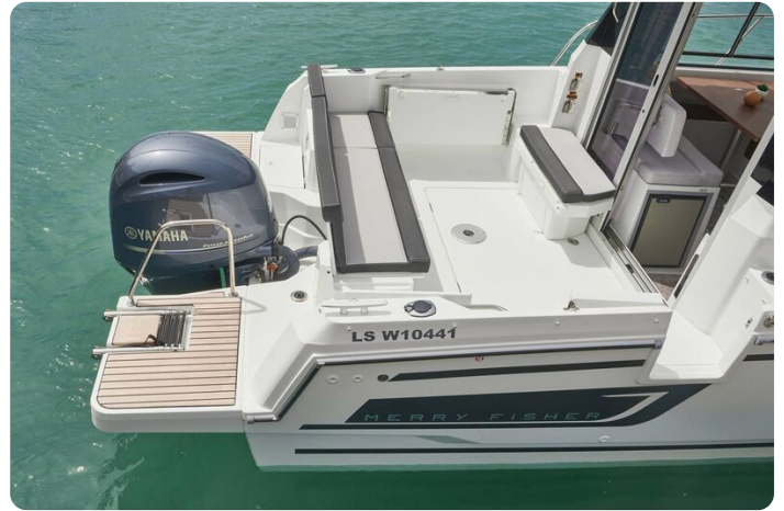
Jeanneau Merry Fisher 795 Series 2 - folding port side bench in aft cockpit