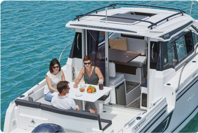
Jeanneau Merry Fisher 795 Series 2 - aft cockpit saloon with table