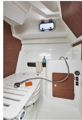
Jeanneau Merry Fisher 795 Series 2 - toilet and shower compartment