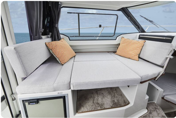
Jeanneau Merry Fisher 795 Series 2 - table in wheelhouse converts to berth