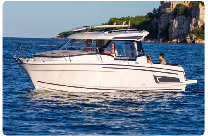
Jeanneau Merry Fisher 795 Series 2 - port side view