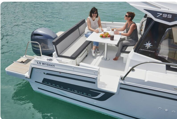
Jeanneau Merry Fisher 795 Series 2 - view into cockpit saloon through side gate