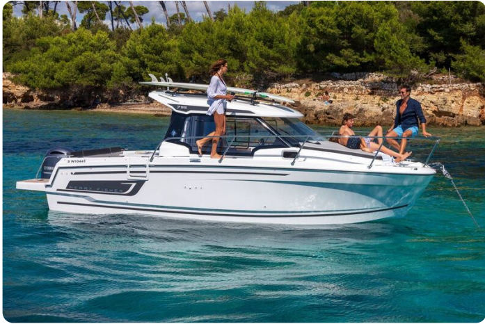
Jeanneau Merry Fisher 795