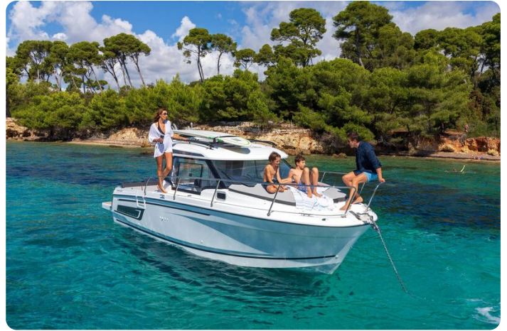
Jeanneau Merry Fisher 795 - side deck for easy access to bow