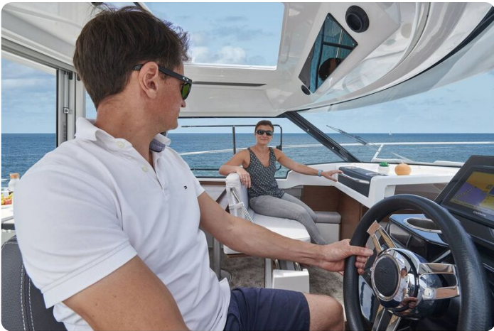
Jeanneau Merry Fisher 795 - pilot and co-pilot seating