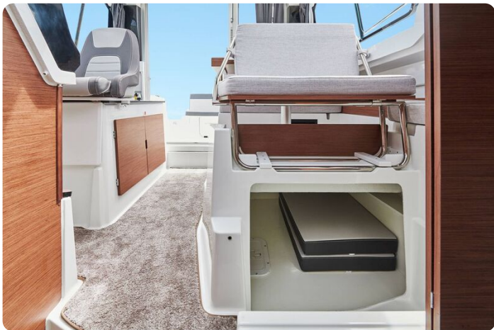
Jeanneau Merry Fisher 795 - storage under seating