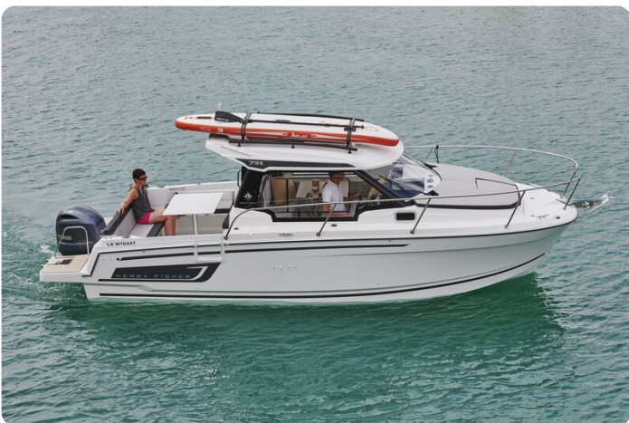
Jeanneau Merry Fisher 795 - starboard side on the water