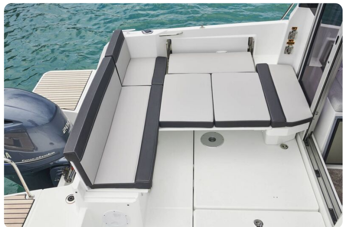
Jeanneau Merry Fisher 795 - cockpit saloon converts to sun lounger