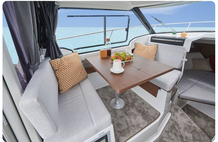
Jeanneau Merry Fisher 795 - wheelhouse saloon with table and seating