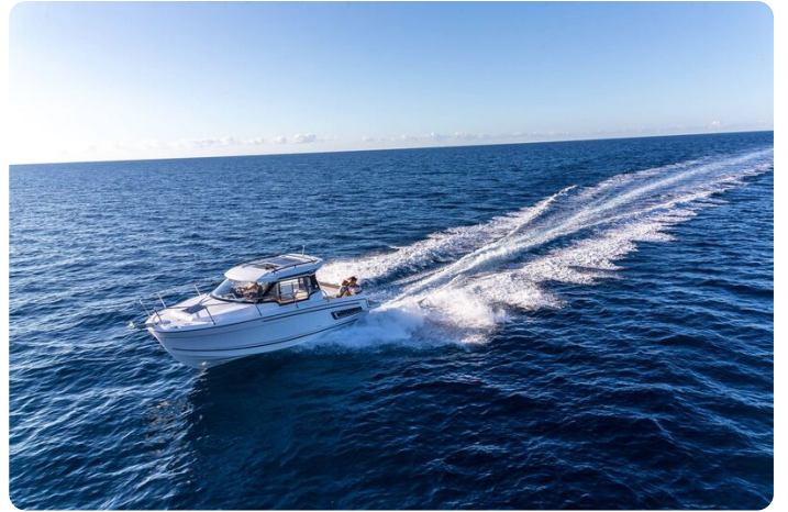
Jeanneau Merry Fisher 795 - on the water with long wake