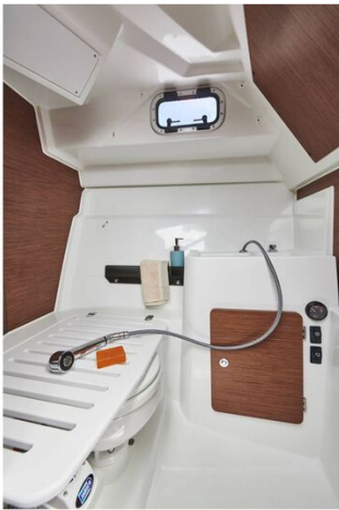
Jeanneau Merry Fisher 795 - toilet and shower compartment