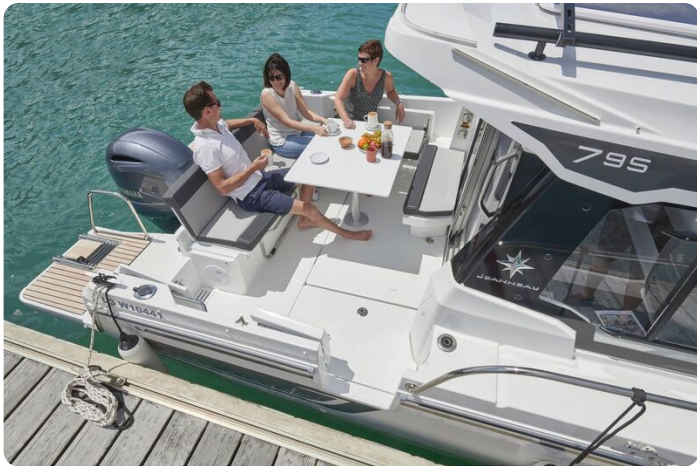
Jeanneau Merry Fisher 795 - sitting around cockpit table