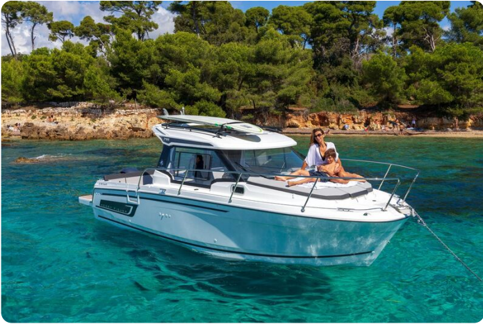
Jeanneau Merry Fisher 795 - relaxing on the bow cushions