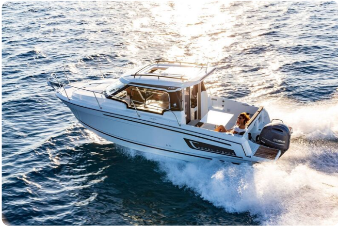
Jeanneau Merry Fisher 795 - on beautiful water