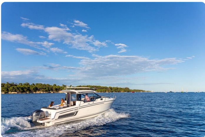
Jeanneau Merry Fisher 795 - on the water