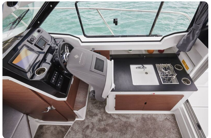
Jeanneau Merry Fisher 795 - helm seat folds forward for access to galley