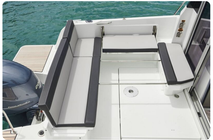
Jeanneau Merry Fisher 795 - U-shape cockpit seating