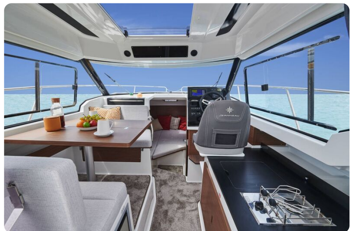
Jeanneau Merry Fisher 795 - wheelhouse with roof hatch, port side saloon and starboard side galley