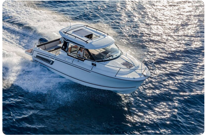
Jeanneau Merry Fisher 795 - overhead view towards bow