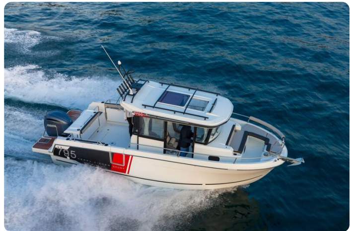
Jeanneau Merry Fisher 795 Sport - Series 2 - overhead view of starboard on the water