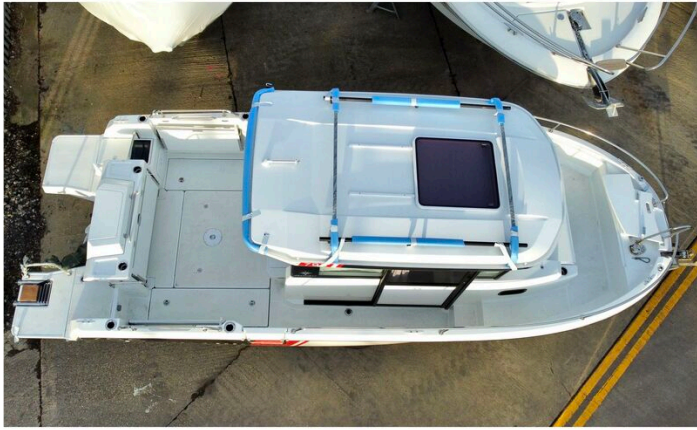
Jeanneau Merry Fisher 795 Sport - Series 2 - overhead view