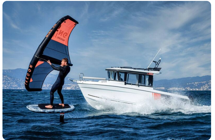
Jeanneau Merry Fisher 795 Sport - Series 2 - great for paddleboards and fun on the water