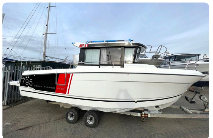
Jeanneau Merry Fisher 795 Sport - Series 2 - at Morgan Marine