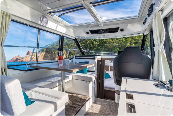
Jeanneau Merry Fisher 895 - wheelhouse with port side saloon and starboard side galley and helm position