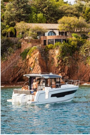
Jeanneau Merry Fisher 895 - near a chateaux