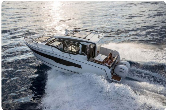
Jeanneau Merry Fisher 895 - port side