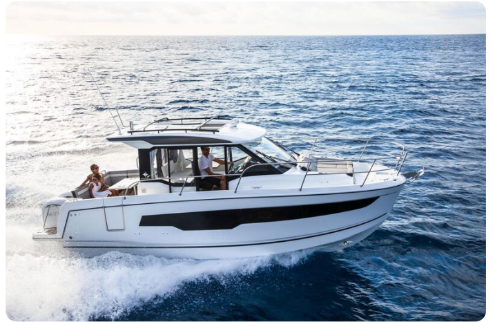
Jeanneau Merry Fisher 895 - starboard side view