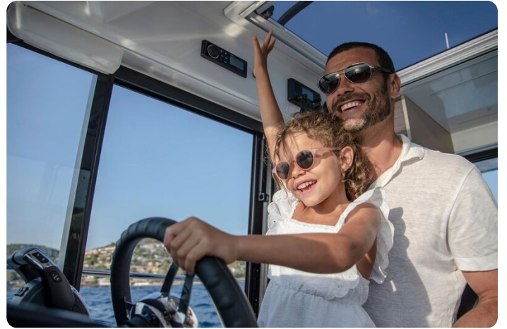
Jeanneau Merry Fisher 895 - sitting at helm position