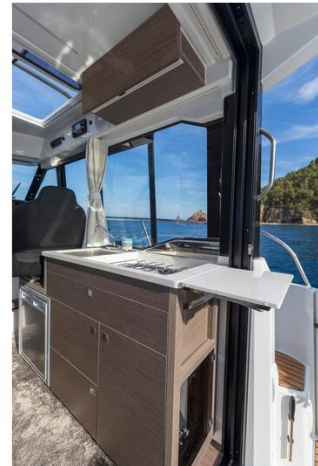
Jeanneau Merry Fisher 895 - starboard side galley