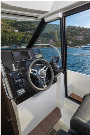
Jeanneau Merry Fisher 895 - helm position