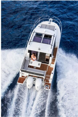
Jeanneau Merry Fisher 895 - overhead view