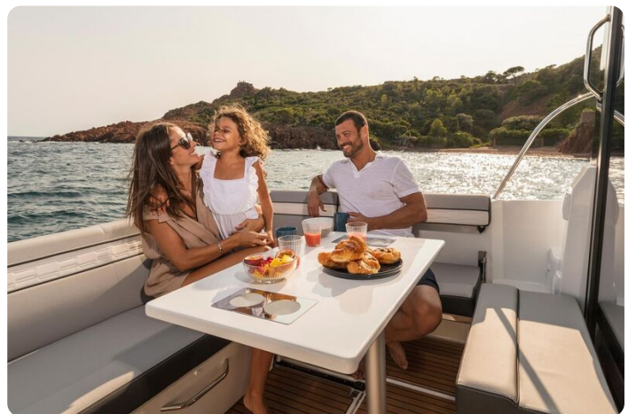
Jeanneau Merry Fisher 895 - dining at the cockpit table