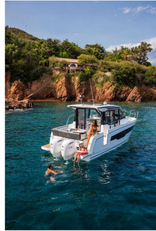
Jeanneau Merry Fisher 895 - swim platforms