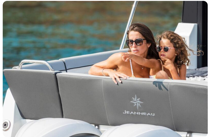
Jeanneau Merry Fisher 895 - people looking out over the aft cockpit bench seat