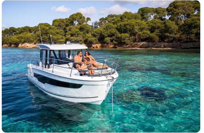
Jeanneau Merry Fisher 895 - relaxing on the forward sun lounger