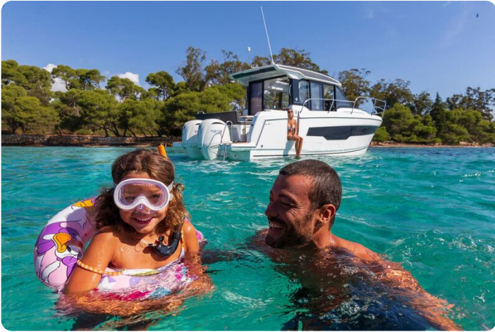
Jeanneau Merry Fisher 895 - fun in the water