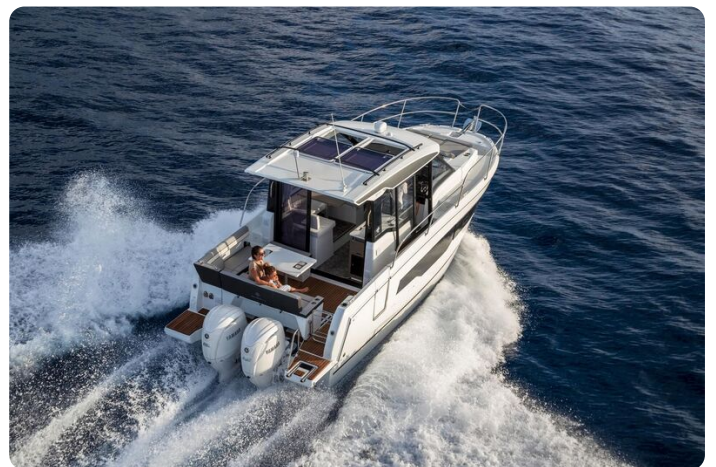
Jeanneau Merry Fisher 895 - overhead view from starboard side aft