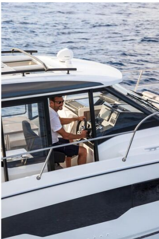
Jeanneau Merry Fisher 895 - helm side door for easy access to the side deck and cleats