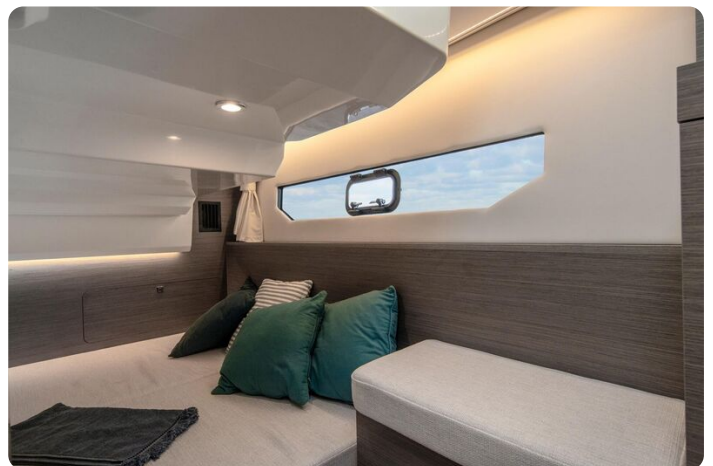
Jeanneau Merry Fisher 895 - aft cabin