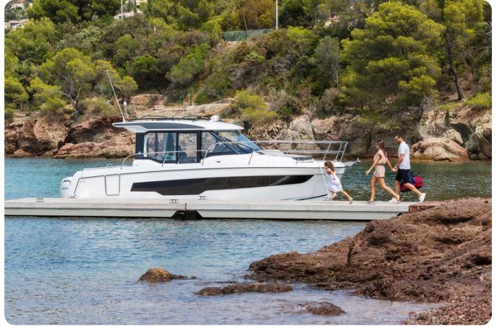
Jeanneau Merry Fisher 895 - walking along the pontoon