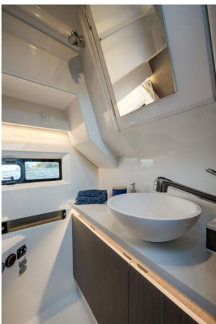
Jeanneau Merry Fisher 895 - toilet compartment