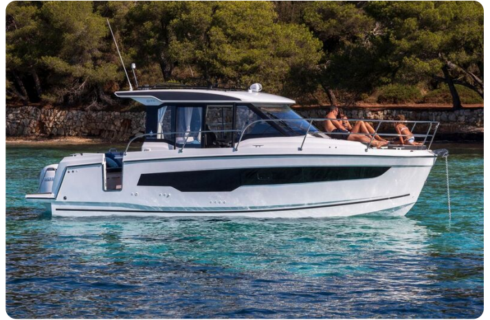
Jeanneau Merry Fisher 895 Series 2 - starboard side view on the water