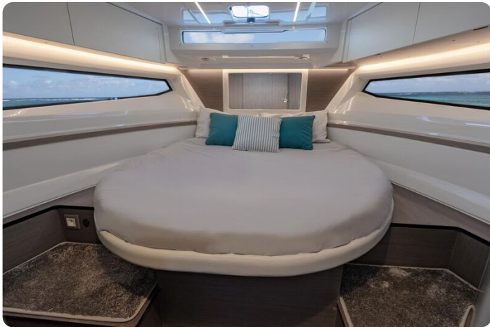
New Jeanneau Merry Fisher 895 - forward cabin