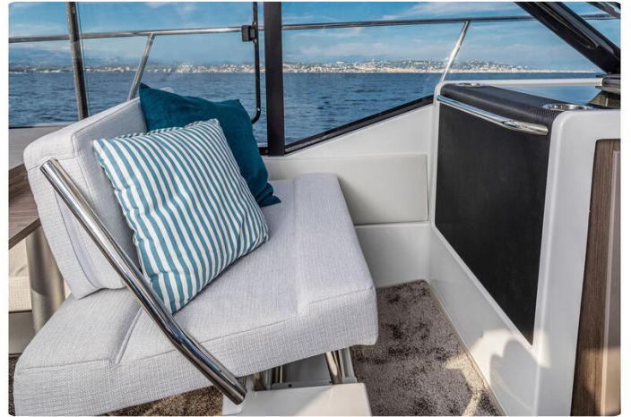
New Jeanneau Merry Fisher 895 - co-pilot seat