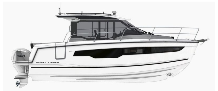
New Jeanneau Merry Fisher 895 - diagram of starboard side