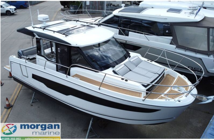
New Jeanneau Merry Fisher 895