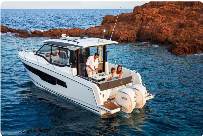
New Jeanneau Merry Fisher 895 - overhead view of transom and swim platform