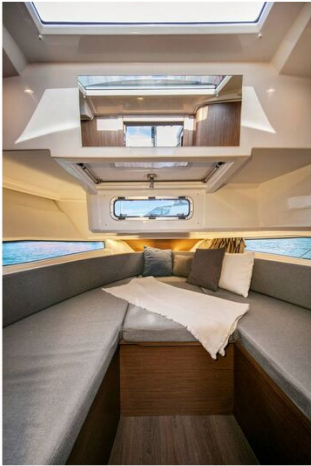
Jeanneau Merry Fisher 895 Sport - entrance to forward cabin