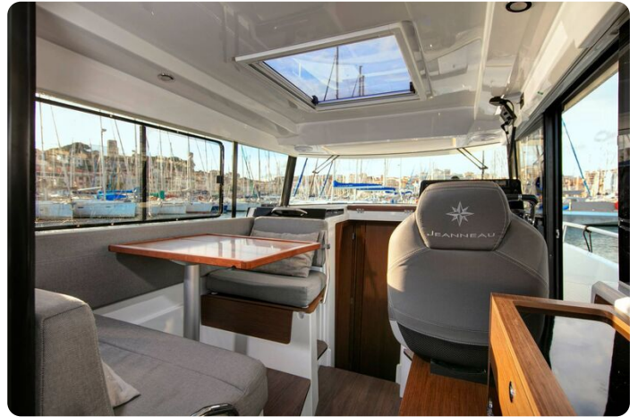
Jeanneau Merry Fisher 895 Sport - wheelhouse with port side seating + table and starboard side helm position