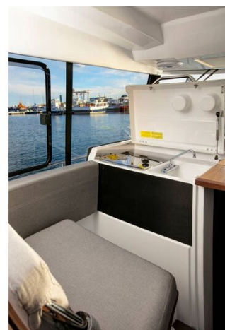
Jeanneau Merry Fisher 895 Sport - co-pilot bench