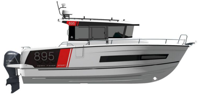
Jeanneau Merry Fisher 895 Sport - layout diagram of starboard side