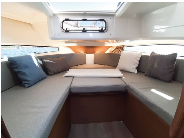
Jeanneau Merry Fisher 895 Sport - forward cabin with hatch to deck