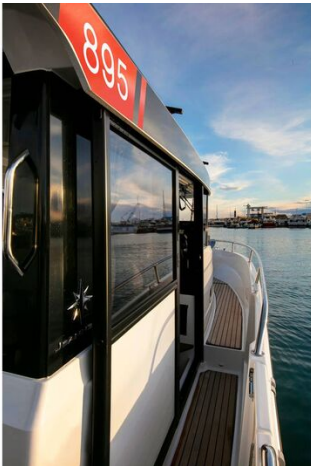
Jeanneau Merry Fisher 895 Sport - side deck towards bow