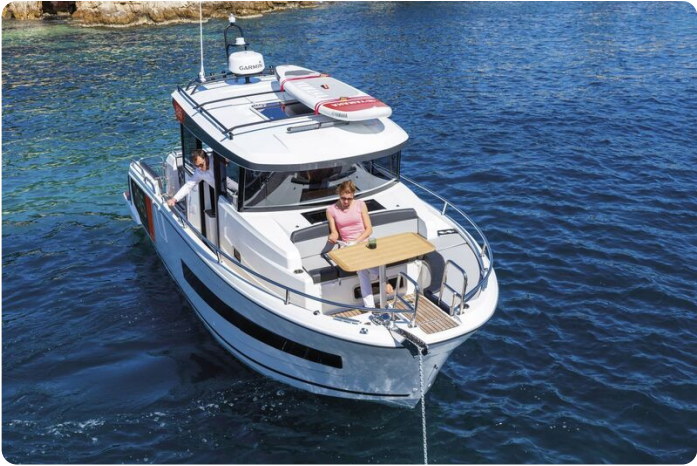
Jeanneau Merry Fisher 895 Sport