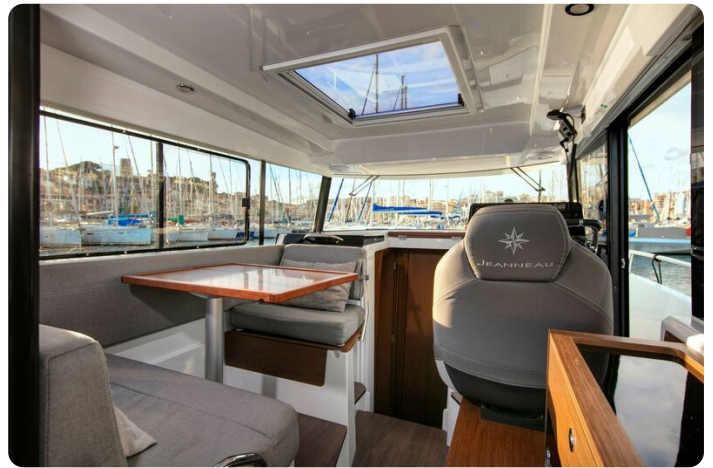
Jeanneau Merry Fisher 895 Sport - wheelhouse with port side seating + table and starboard side helm position