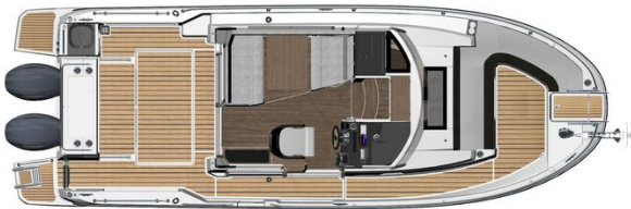
Jeanneau Merry Fisher 895 Sport - layout diagram of deck and wheelhouse interior