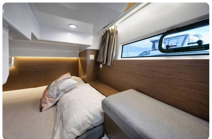
Jeanneau Merry Fisher 895 Sport - aft cabin