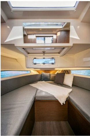
Jeanneau Merry Fisher 895 Sport - entrance to forward cabin