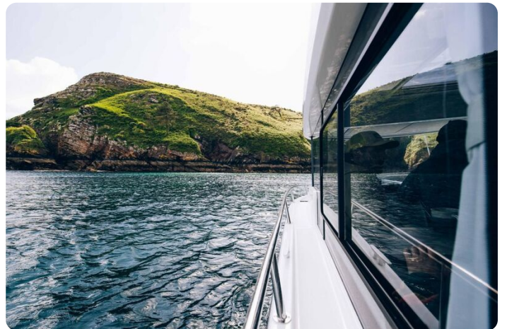
Jeanneau Merry Fisher 895 Sport - Series 2 - port side