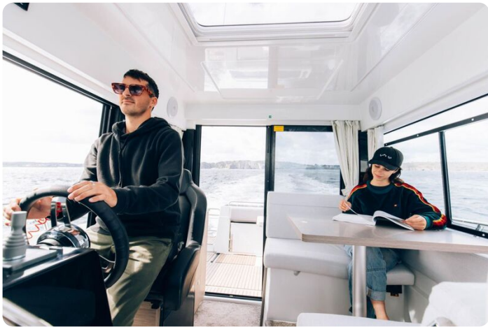
Jeanneau Merry Fisher 895 Sport - Series 2 - helm position and saloon