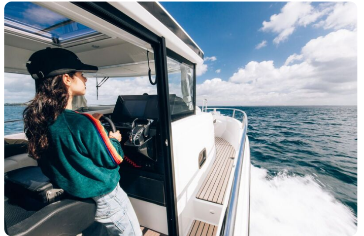
Jeanneau Merry Fisher 895 Sport - Series 2 - helm side door and wide side deck