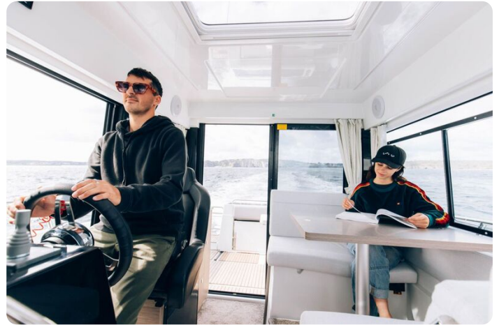
Jeanneau Merry Fisher 895 Sport - view from cabin steps through wheelhouse to aft