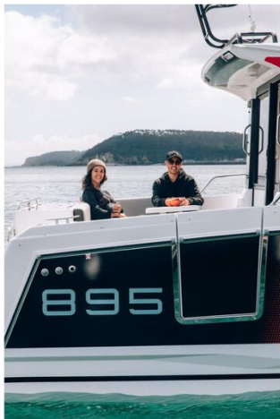
Jeanneau Merry Fisher 895 Sport - cockpit side gate on starboard side