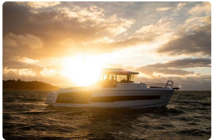
Jeanneau Merry Fisher 895 Sport - in beautiful sunset