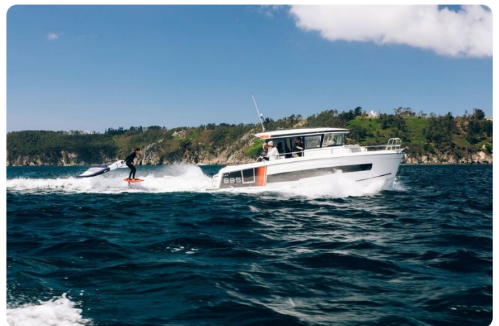
Jeanneau Merry Fisher 895 Sport - moving through the water